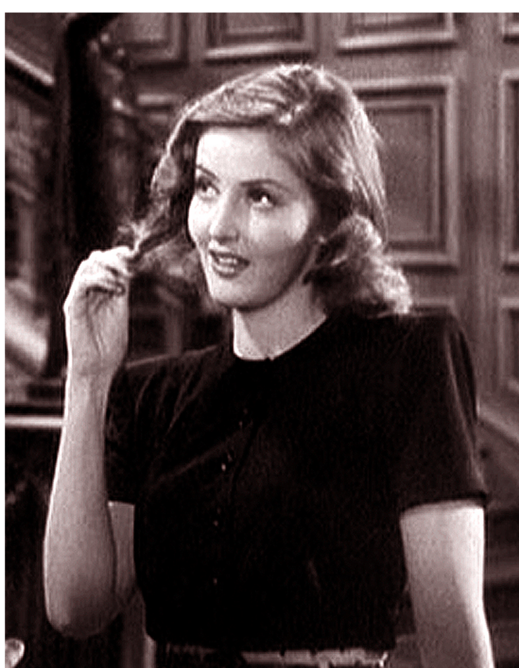
~as "Carmen Sternwood" in The Big Sleep

Miss Vickers was born in Ann Arbor, Mich., on May 28, 1925. Her father worked for the Ford Motor Co. and, consequently, Martha spent her early years in Chicago, Miami, St. Petersburg, Detroit and Dallas before going west with her family in 1940.