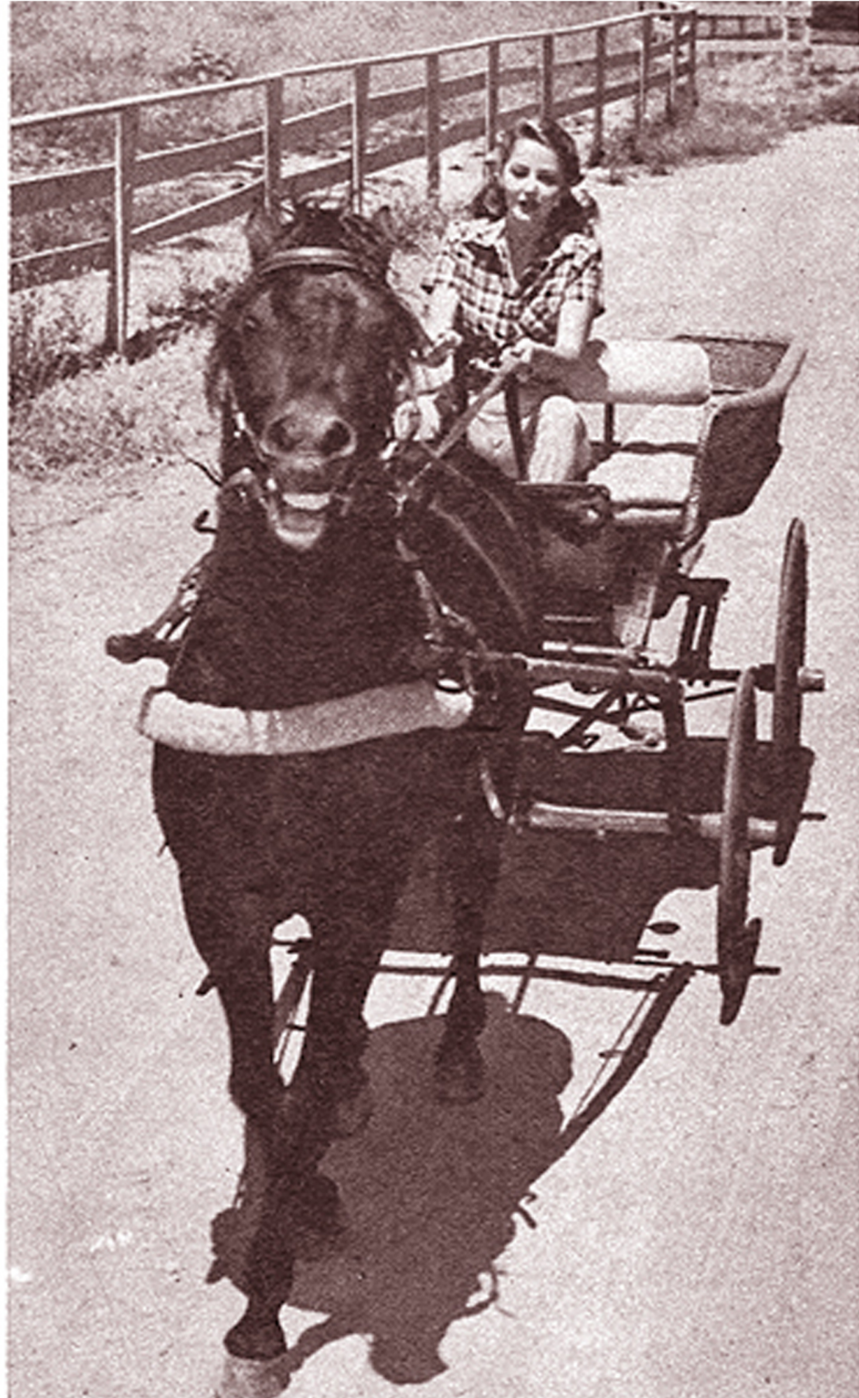
MISS VICKERS drives the hackney show pony while visiting on Harry Warner's ranch estate.

Miss Vickers has completed one picture since "The Big Sleep" and is currently working in a third, so there is a possibility that she will have completed three films before the public gets a glimpse of her on the screen. Her second picture is called "The Time, the Place and the Girl" in which she has the leading feminine role opposite Dennis Morgan and Jack Carson. She is currently working in the picture called "The Man I Love" in which she will have featured billing along with such other important players as Ida Lupino, Robert Alda and Andrea King.