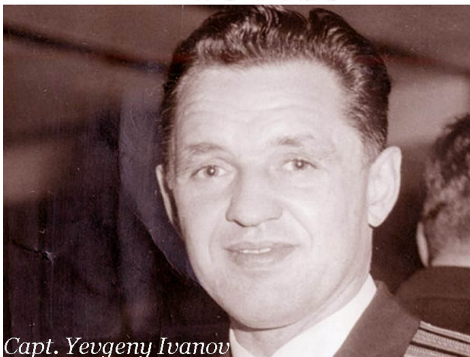
Capt. Yevgeny Ivanov

Capt. Yevgeny Ivanov, the Kremlin agent who shared Christine Keeler's affections with Britain's War Minister Profumo. Contrary to published reports, it was not the Profumo scandal that caused Ivanov's downfall—but his relationship with Penkovsky. The two were old friends and classmates for four years at Moscow's Military Diplomatic Academy, Russia's top espionage school.