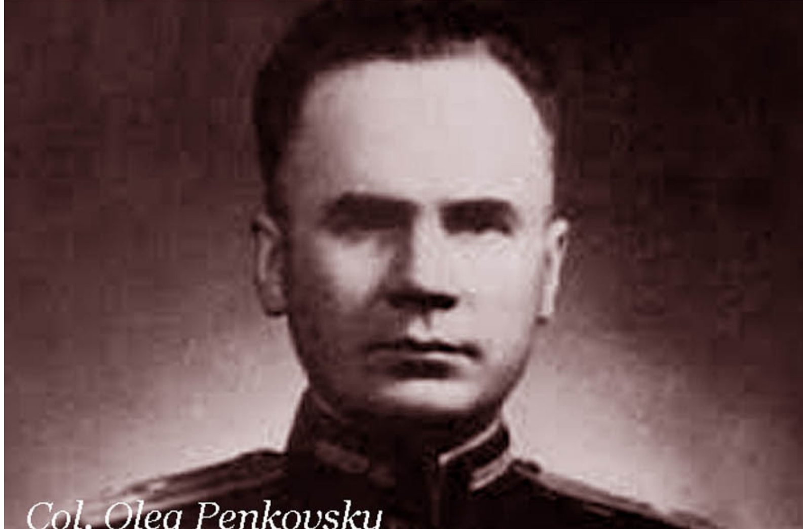
Col. Oleg Penkovsky

fought gallantly in both the Finnish campaign and World War II. He became a lieutenant-colonel at 26 and received a dozen decorations for valor, including the Order of the Red Star, two Orders of the Red Banner, the Order of the Patriotic War and the Order of Alexander Nevsky.