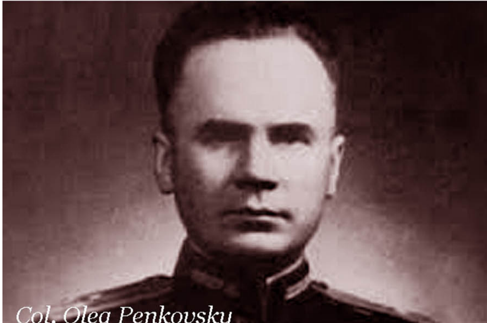
Col. Oleg Penkovsky

fought gallantly in both the Finnish campaign and World War II. He became a lieutenant-colonel at 26 and received a dozen decorations for valor, including the Order of the Red Star, two Orders of the Red Banner, the Order of the Patriotic War and the Order of Alexander Nevsky.