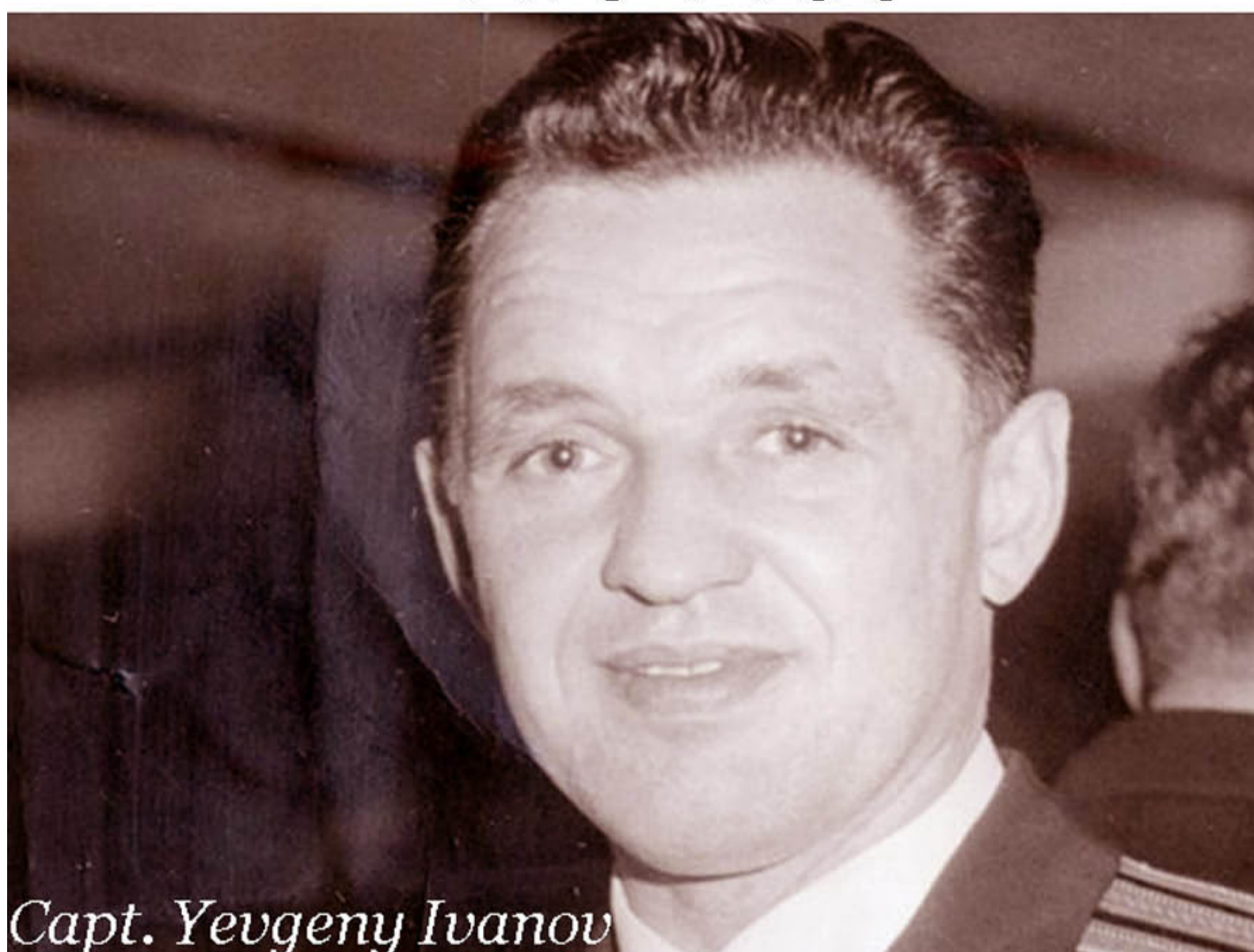
Capt. Yevgeny Ivanov

Capt. Yevgeny Ivanov, the Kremlin agent who shared Christine Keeler's affections with Britain's War Minister Profumo. Contrary to published reports, it was not the Profumo scandal that caused Ivanov's downfall—but his relationship with Penkovsky. The two were old friends and classmates for four years at Moscow's Military Diplomatic Academy, Russia's top espionage school.