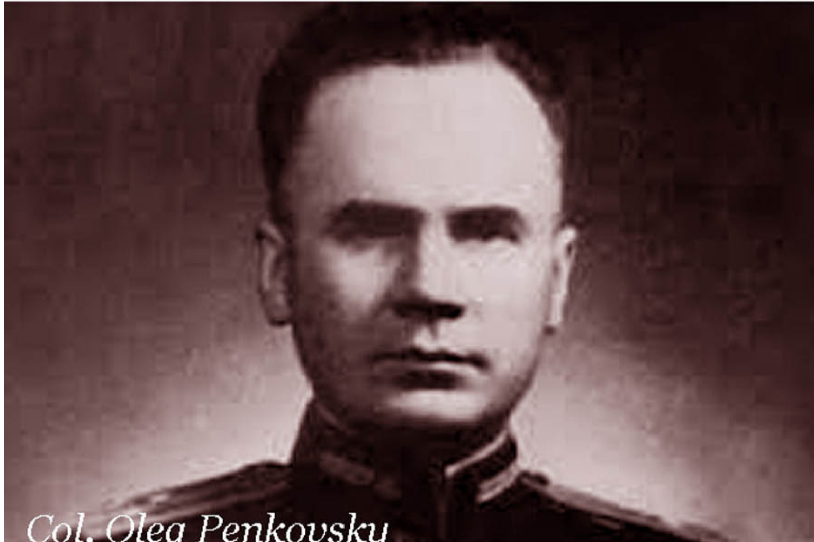
Col. Oleg Penkovsky

fought gallantly in both the Finnish campaign and World War II. He became a lieutenant-colonel at 26 and received a dozen decorations for valor, including the Order of the Red Star, two Orders of the Red Banner, the Order of the Patriotic War and the Order of Alexander Nevsky.