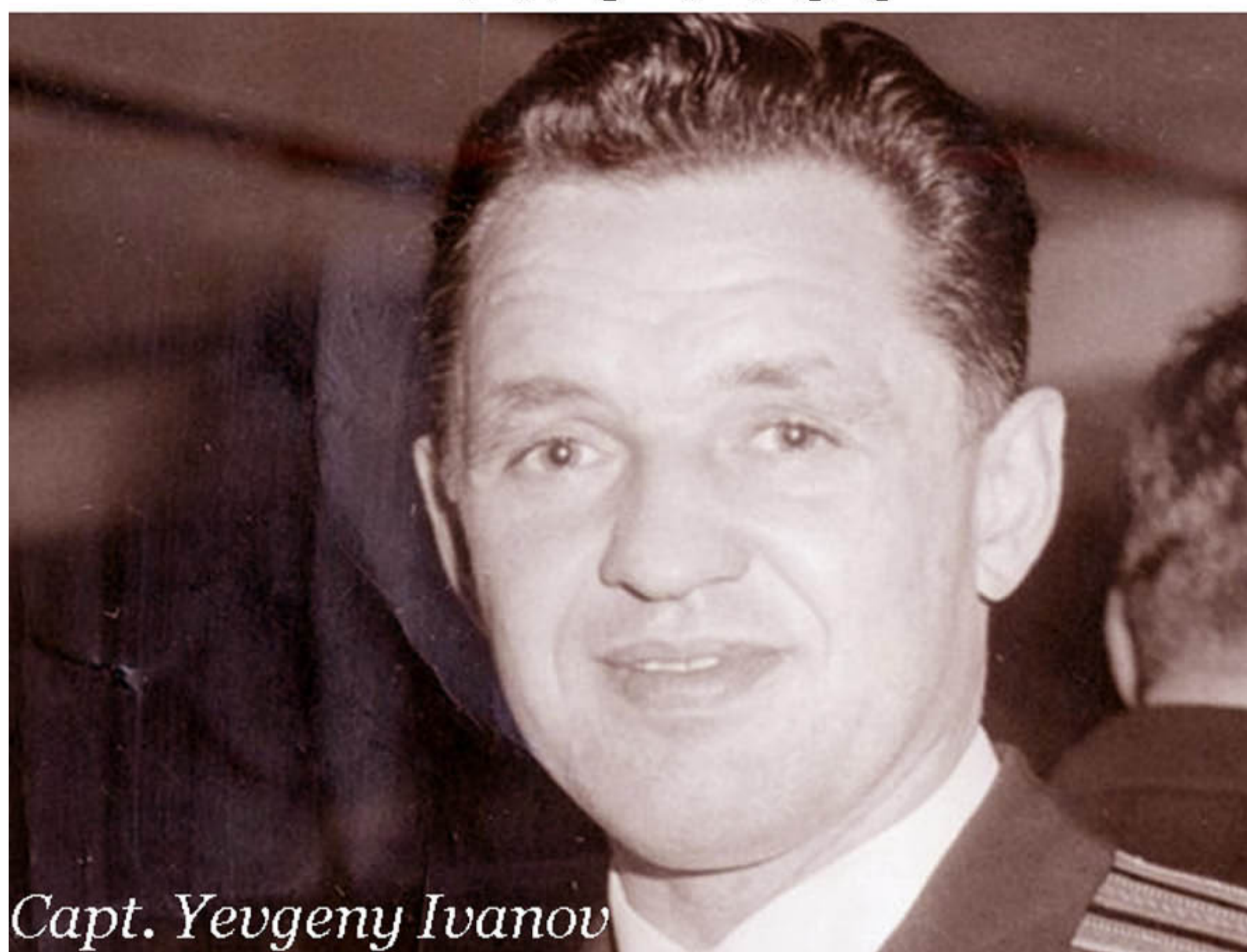
Capt. Yevgeny Ivanov

Capt. Yevgeny Ivanov, the Kremlin agent who shared Christine Keeler's affections with Britain's War Minister Profumo. Contrary to published reports, it was not the Profumo scandal that caused Ivanov's downfall—but his relationship with Penkovsky. The two were old friends and classmates for four years at Moscow's Military Diplomatic Academy, Russia's top espionage school.