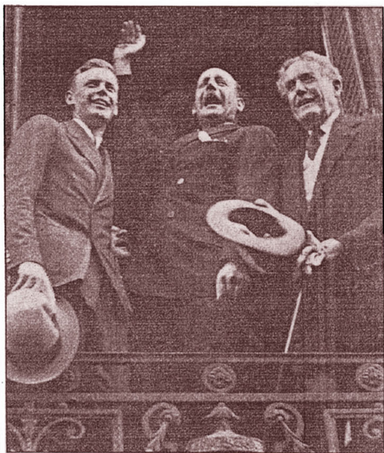
"A LAD HAS BECOME HERO OF THE WORLD"