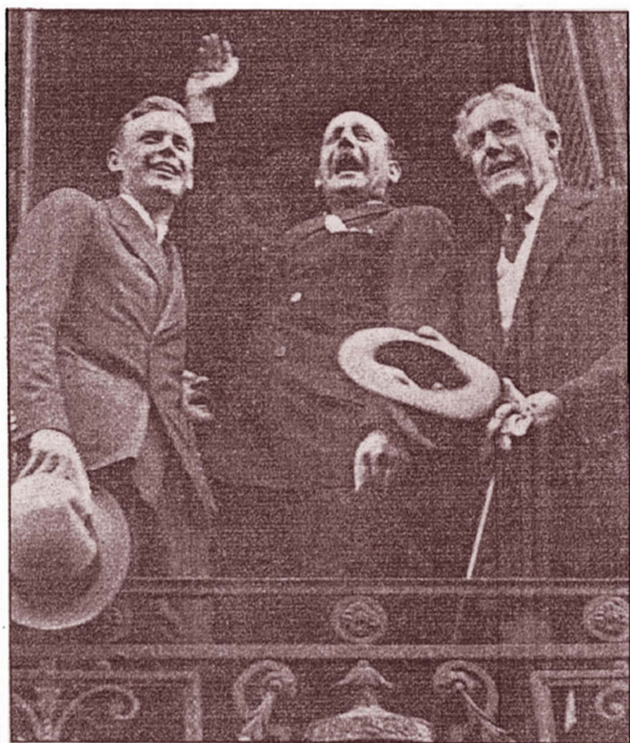
"A LAD HAS BECOME HERO OF THE WORLD"