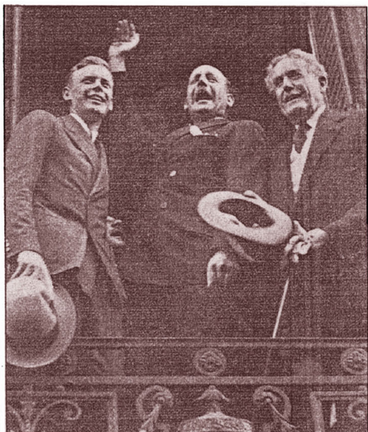
"A LAD HAS BECOME HERO OF THE WORLD"