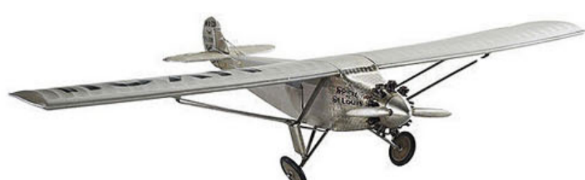
A Spirit of St. Louis toy.

'West' proved a useful rime. The patriotic note was sounded in a number of the verses, with 'dare and do' and 'red, white and blue' playing a prominent part. The fact that he flew alone made the strongest impression on his sonneteers, who insisted that he was not really alone, for the thoughts and prayers of thousands went with him. Most of the lyrists dedicated their work to the hero, but a few preferred to honor his mother."