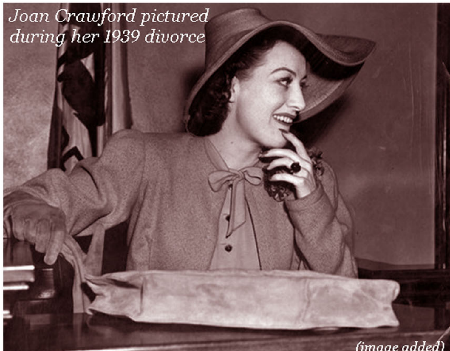
Joan Crawford pictured during her 1939 divorce