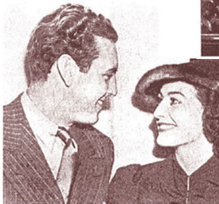
Clark Gable, the great lover of the screen; Allan Jones and Joan Crawford — all three examples of why Hollywood has a definite case against monogamy

Many of them do not keep their hearts. They fall in love with other ambitious youngsters, naturally and sweetly and inevitably, and they marry. And life goes on, work goes on, and the girl grows older and so does the boy. And perhaps one is more successful than the other, and the other can't take it. Or perhaps they were simply too young for marriage, too dazzled and too much in love with love to know what it was all about. So they part; and eventually are divorced.