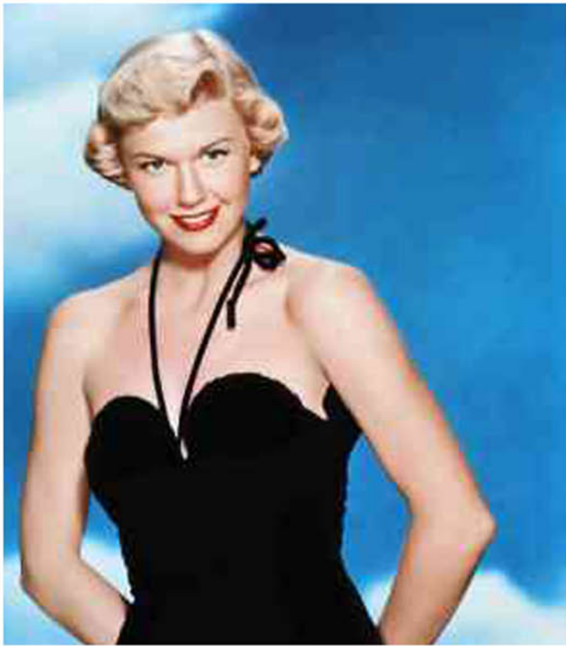
Anne Baxter's expression speaks louder than words.

Warner's Doris Day: She likes difference between men and women.