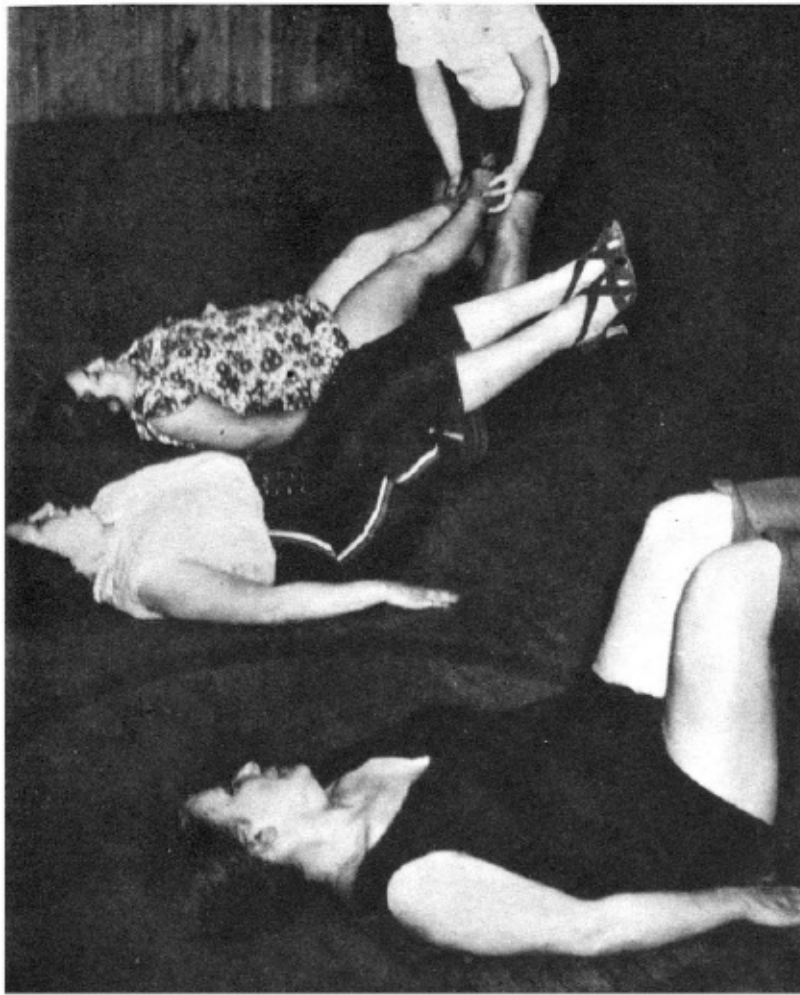
EACH OF THESE East Side mothers must pass a physical examination before being given the strenuous course of treatment. But when admitted they are put through their paces in the gymnasium by physical culture experts. This is the first time most of them have ever been inside a "gym".