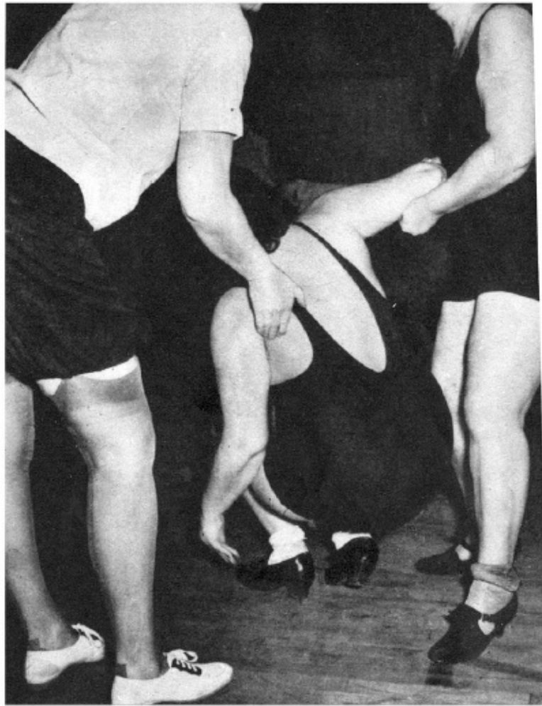
MUSCLES UNACCUSTOMED to such shenanigans sometimes let their owners down—but it's all in fun and the results are more than worth the effort. If a woman misses more than two classes in succession it is assumed she is no longer interested in the course and another takes her place.