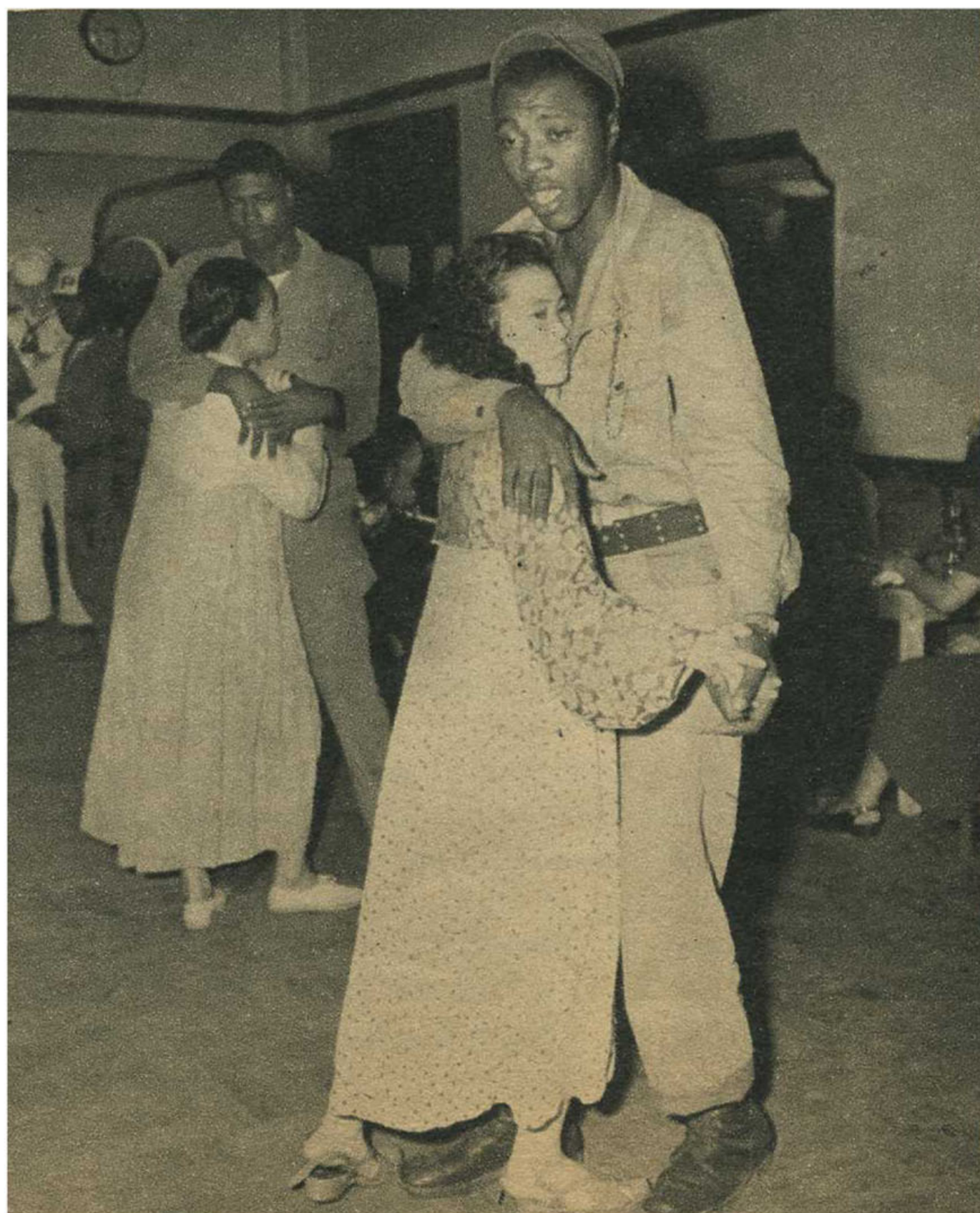
In Metropolitan Dance Hall in Pusan, Korea.

"Step into Tachikawa (a U. S. air base center in Tokyo's western suburbs), for one instance. You will see hundreds and thousands of women lining up on the streets. American soldiers hang around until they pick up one each from the lines and go somewhere.