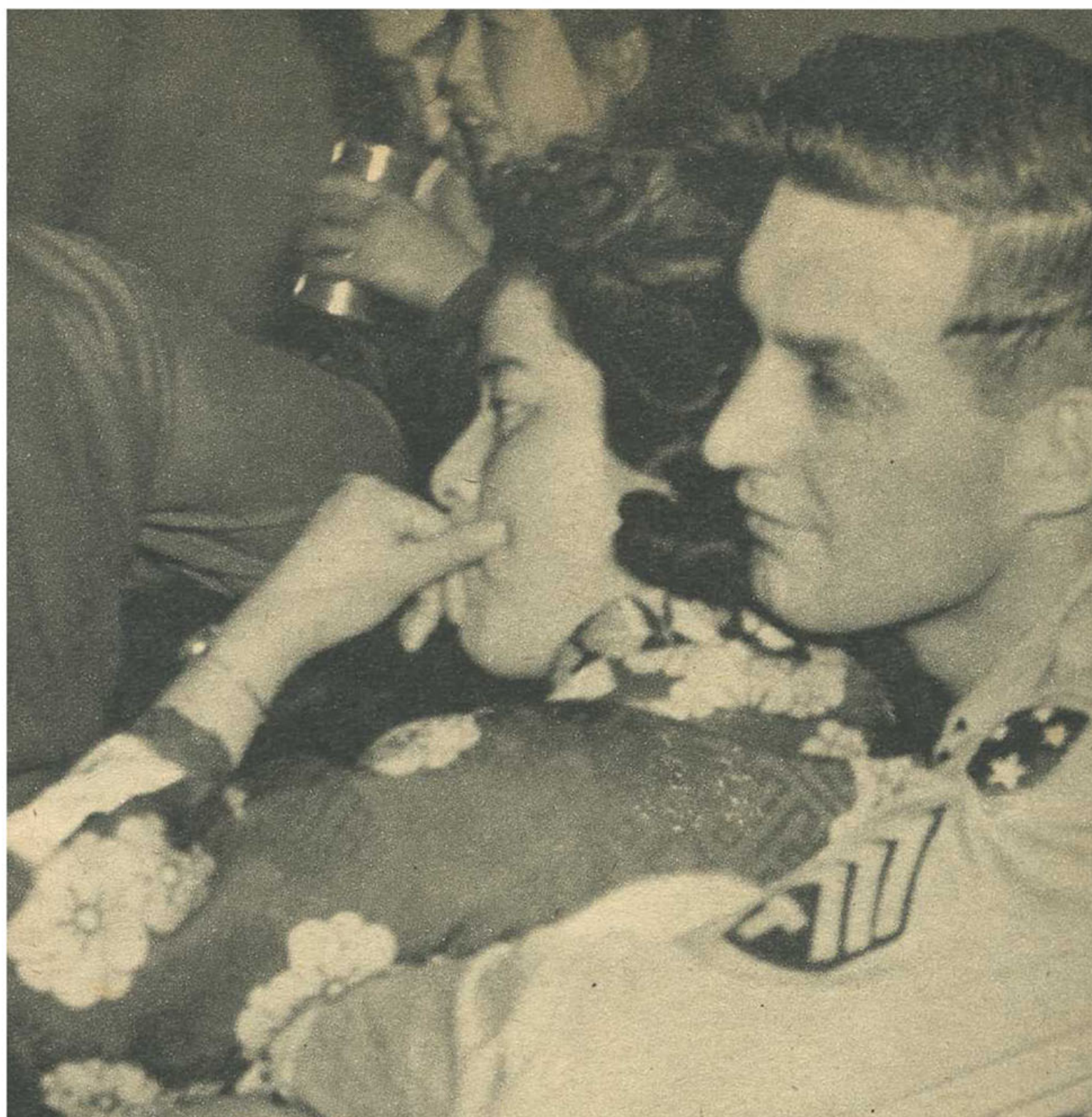
Sitting out a dance in Tokyo, listening to music.