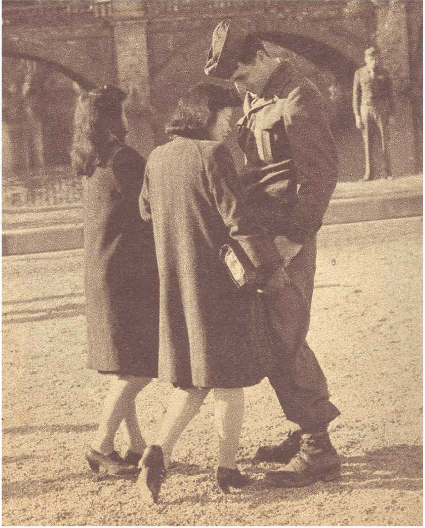
Sightseeing on the Tokyo Palace grounds.