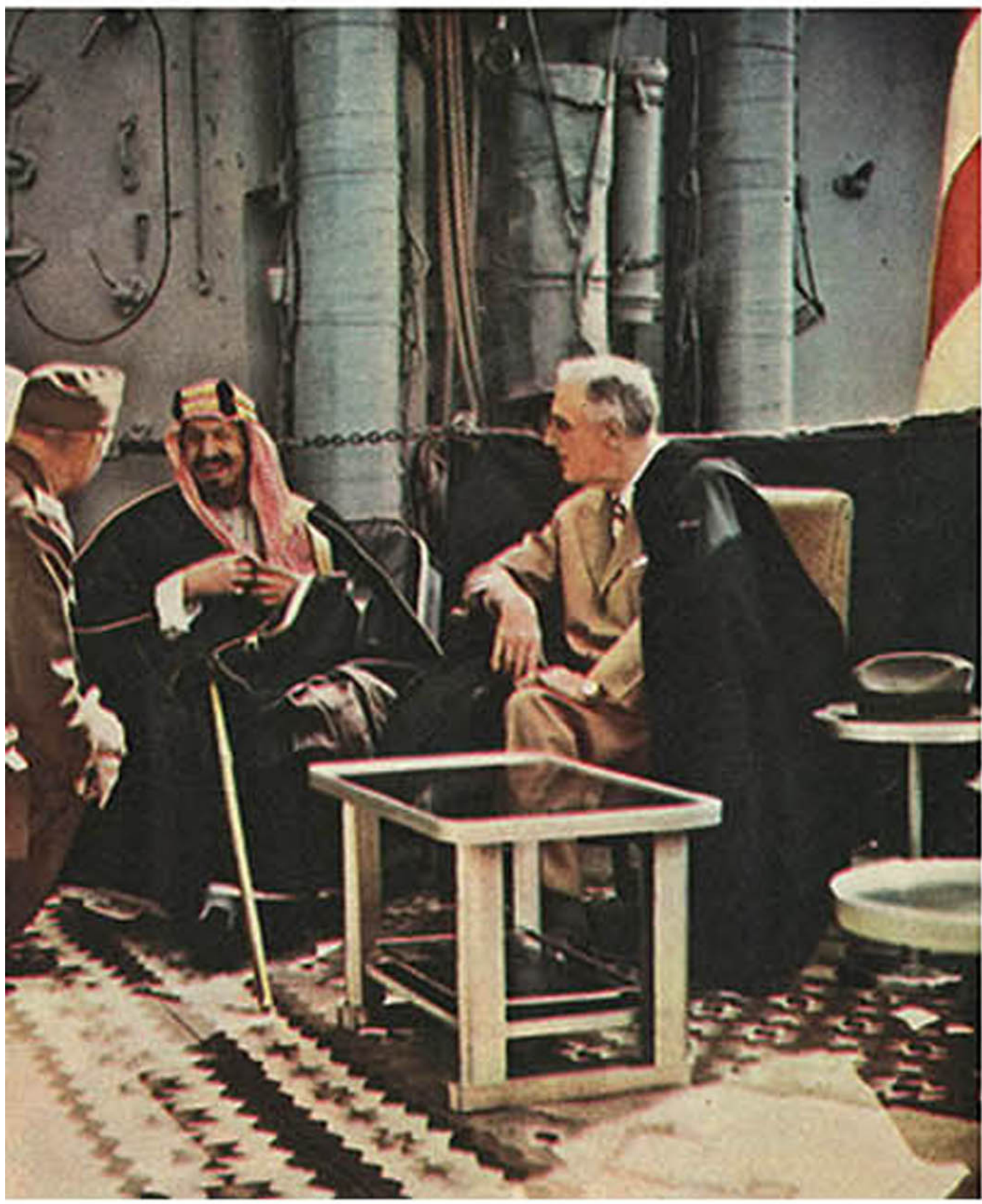
On his way back from Yalta, Roosevelt talked with King Ibn-Saud of Saudi Arabia, dreamed of working there sometime

"Well, I can't be President forever, and I don't know any people who need someone to help them more than the people in the Near East."