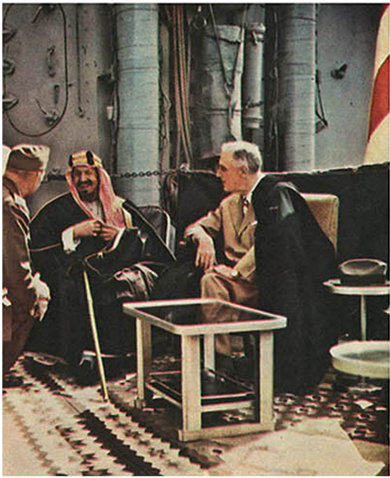
On his way back from Yalta, Roosevelt talked with King Ibn-Saud of Saudi Arabia, dreamed of working there sometime

"Well, I can't be President forever, and I don't know any people who need someone to help them more than the people in the Near East."