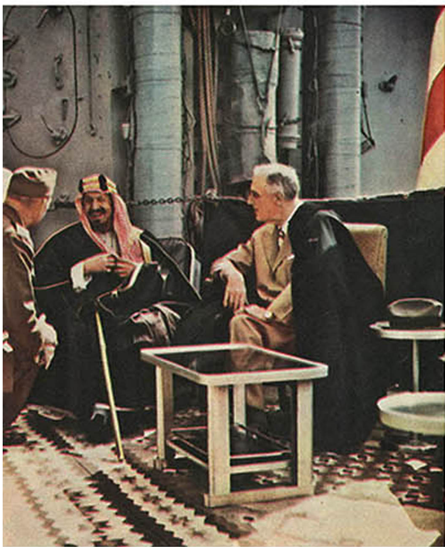
On his way back from Yalta, Roosevelt talked with King Ibn-Saud of Saudi Arabia, dreamed of working there sometime

"Well, I can't be President forever, and I don't know any people who need someone to help them more than the people in the Near East."