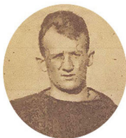
Light, Pennsylvania U.