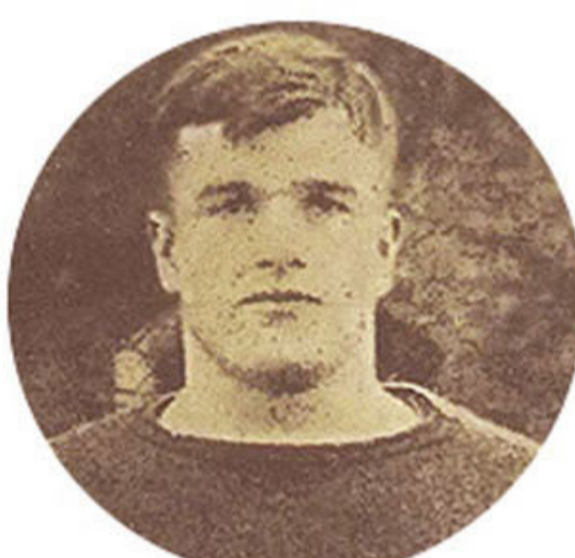
Rodgers, West Virginia.