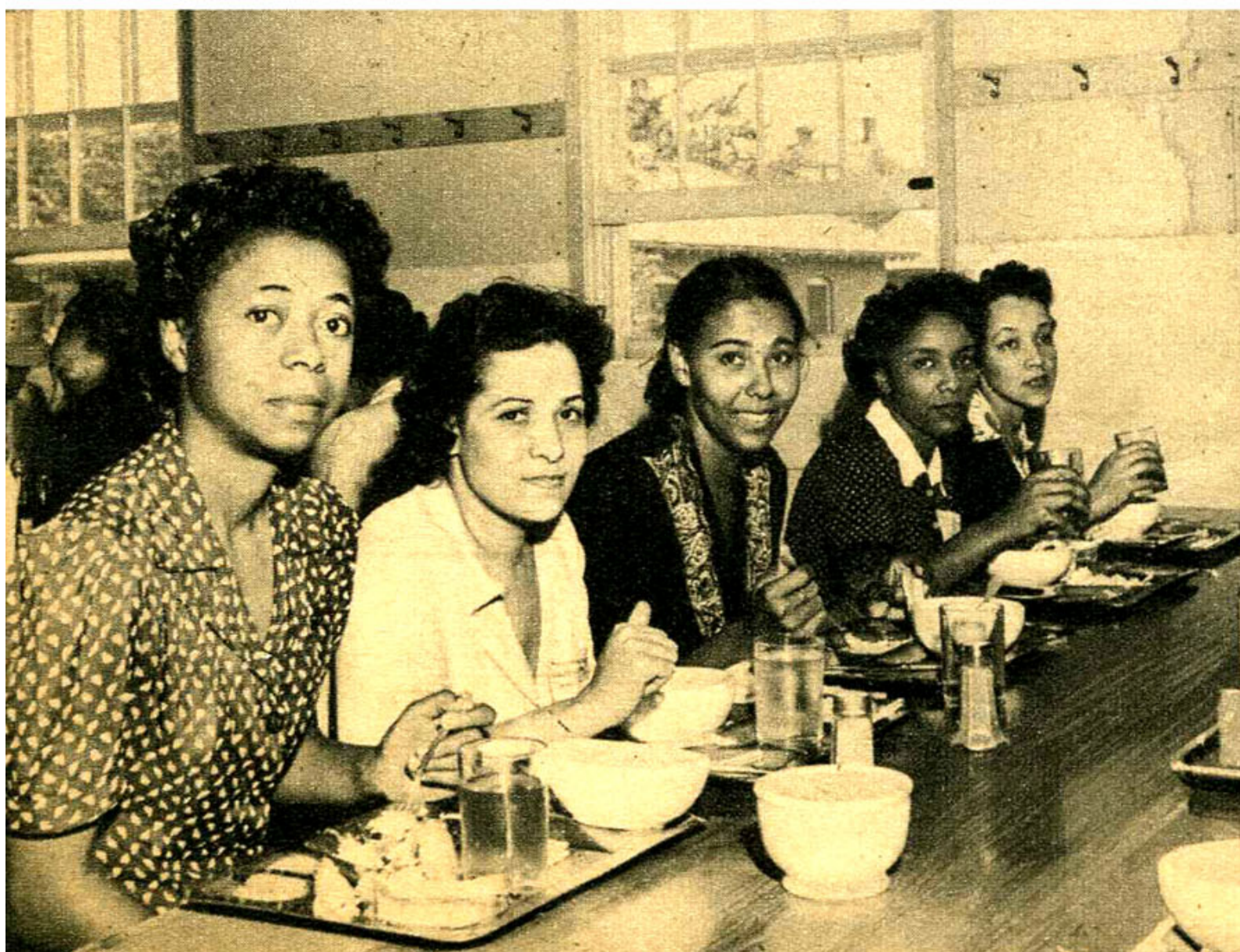
Five members of the colored regiment eat one of their first meals in the mess. According to WAAC Director Oveta Culp Hobby, they will eventually be assigned to Negro regiments at Fort Huachuca in Arizona.