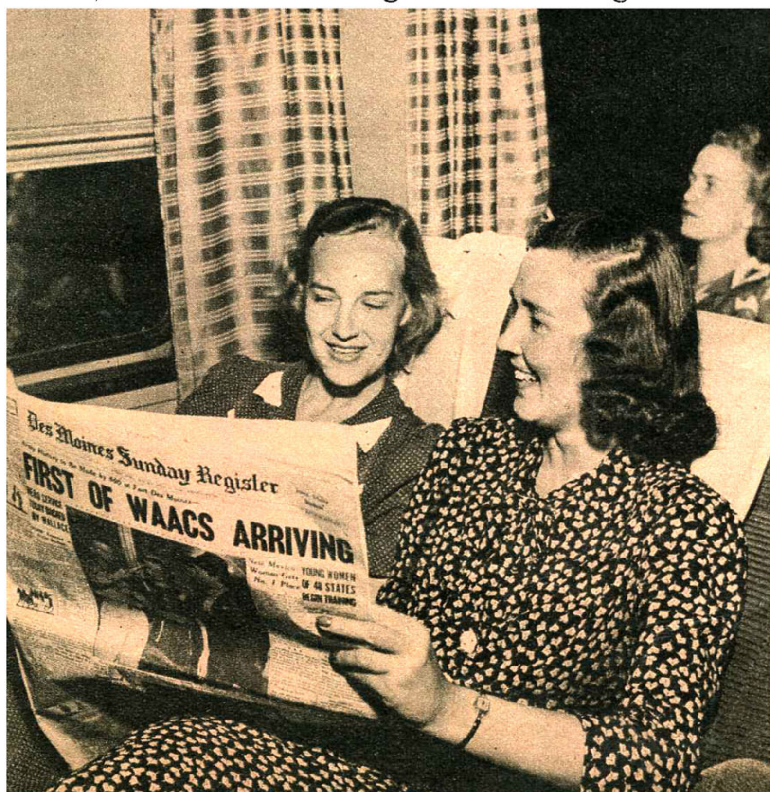
On the last lap of the journey to Fort Des Moines, a Tennessee WAAC-to be and one from Massachusetts get a newspaper preview of their arrival

They went through the army mill just as their brothers do, doffed their civilian clothes, and came out khaki-clad. Forty-seven items of clothing were given each WAAC member, ranging from girdles, pajamas (flannelette and cotton), anklets, stockings, slippers, to two uniforms—fatigue and regular—and a brown-and-white seersucker playsuit to wear during exercises. In the picture above, in which Mrs. Oveta Culp Hobby, WAAC Director, is reviewing a group of recruits on opening day, the women in the foreground are wearing the regular uniforms, and those in the background are in fatigue clothes.