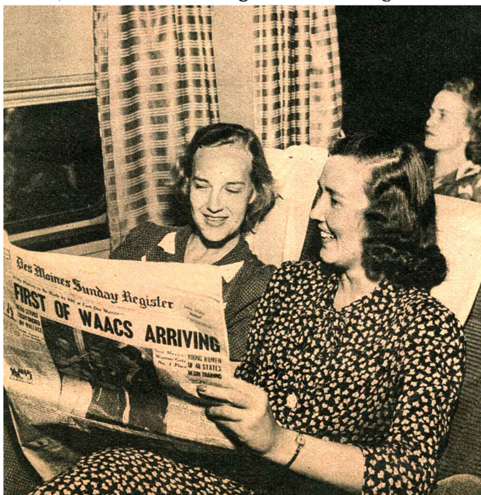
On the last lap of the journey to Fort Des Moines, a Tennessee WAAC-to be and one from Massachusetts get a newspaper preview of their arrival

They went through the army mill just as their brothers do, doffed their civilian clothes, and came out khaki-clad. Forty-seven items of clothing were given each WAAC member, ranging from girdles, pajamas (flannelette and cotton), anklets, stockings, slippers, to two uniforms—fatigue and regular—and a brown-and-white seersucker playsuit to wear during exercises. In the picture above, in which Mrs. Oveta Culp Hobby, WAAC Director, is reviewing a group of recruits on opening day, the women in the foreground are wearing the regular uniforms, and those in the background are in fatigue clothes.