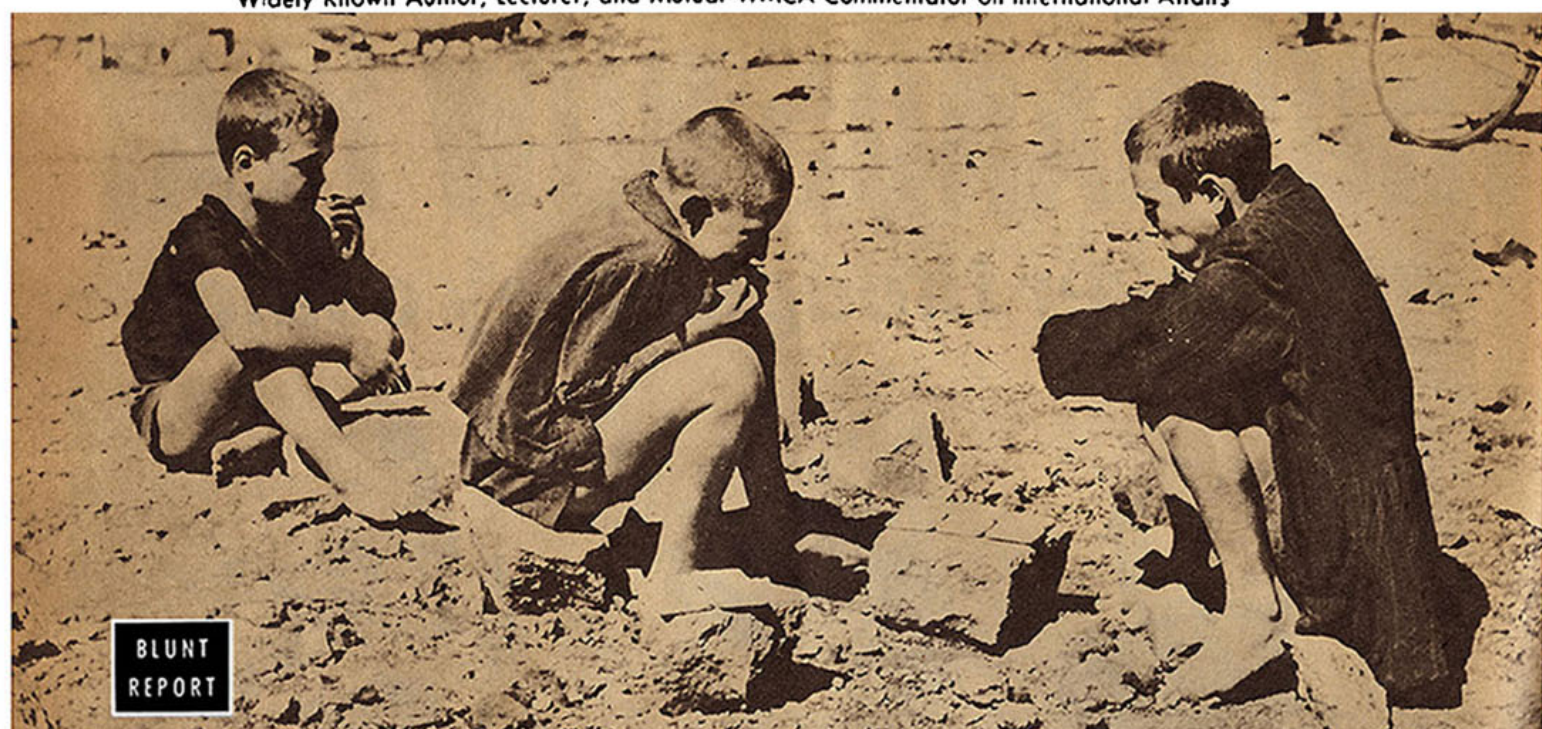
War's aftermath! These famished children, wolfing food scraps, personify the millions of needy Europeans who must be succored by the United States and its post-war allies if they are not to fall prey to Communism. To many of them the democracies' solemn promises of freedom sound hollow, mean simply freedom to starve.

Widely Known Author, Lecturer, and Mutual-WMCA Commentator on International Affairs