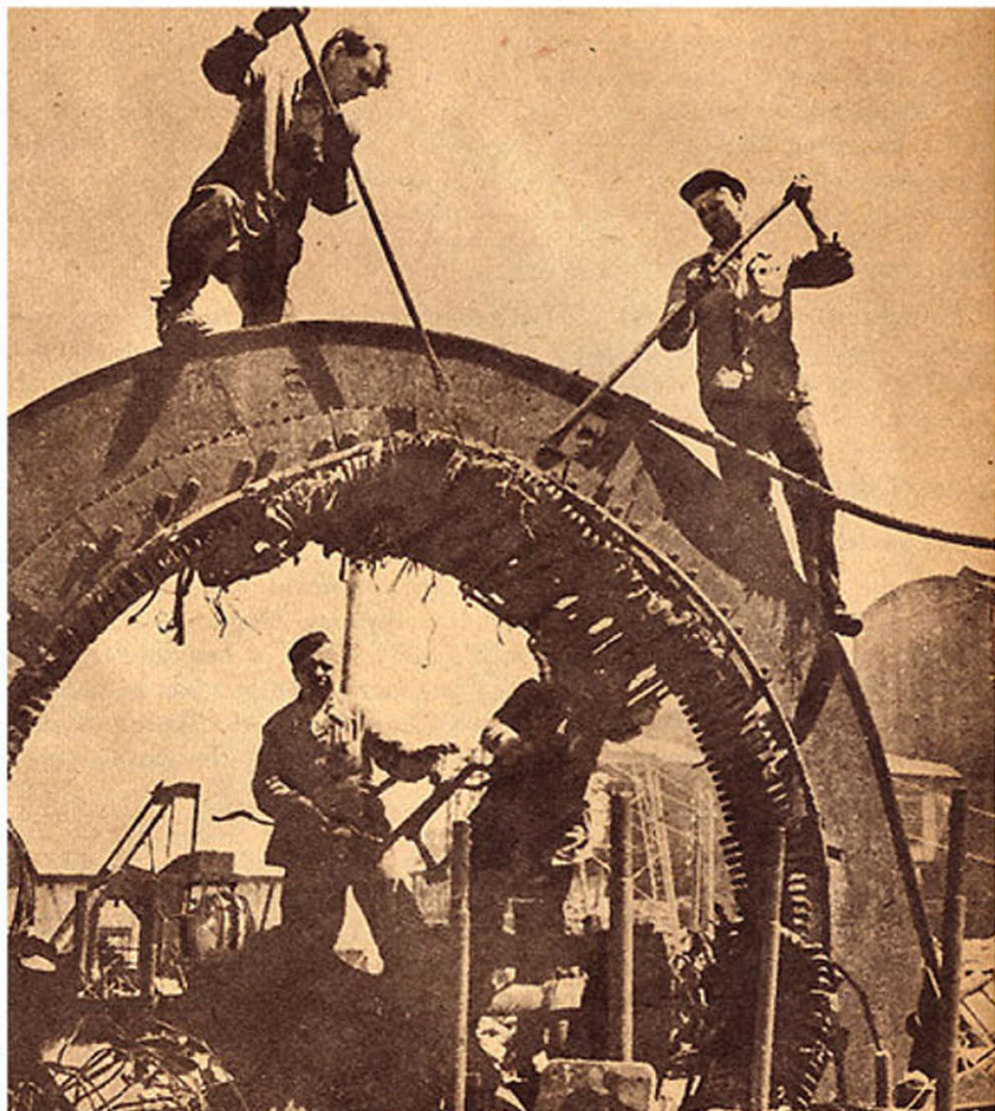
One more demonstration of war's wicked destruction in this picture of a Russian restoration crew at work on a Donbas coal mine, dynamited by retreating Germans.

depends on what they talked about. Spheres of influence? But Russia makes it evident that she would like to see her influence extended all through Europe.