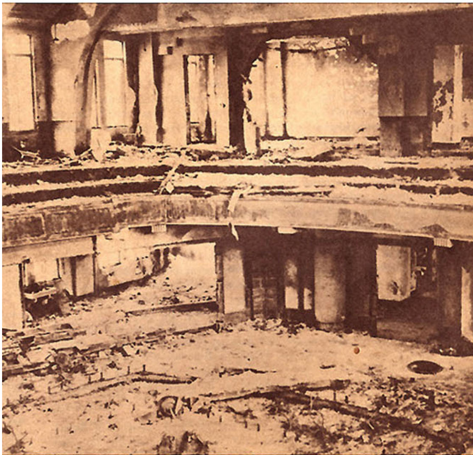
Your city hall, atom-bombed, could be gutted and pulverized as readily as was Hiroshima's Municipal Office Building. Picture preaches a succinct sermon for current peace efforts.

It would take a titanic personal revolution for most of us to bring our minds around to world government. And there is no guarantee that it would preserve freedoms and prevent war. What everyone knows, however, is that the world is now the prisoner of the same political patterns that have produced wars in the past. It is essential that we engage in a mighty pro-democratic, honorable and total effort to avert war now.