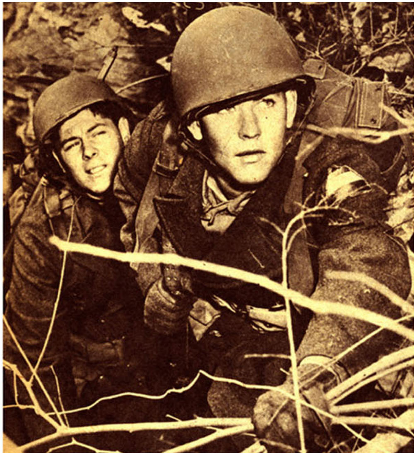
American boys in experimental Universal Military Training unit at Ft. Knox. Says Cecil Brown: "Russia will not be stopped by the absence of military power."

Much of our power depends on the power developed by Western European nations. They won't have any power worth mentioning for a few years. For that reason, the trend now is to provide American military assistance to Europe.