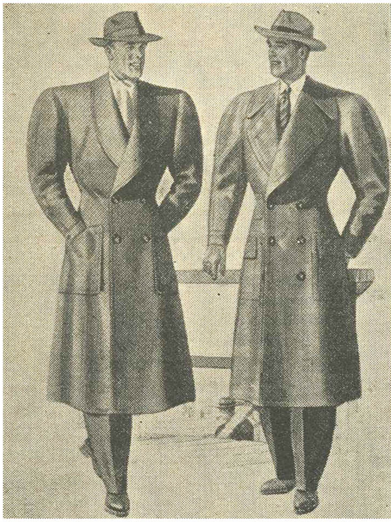
Designs for zoot at its zenith.

cuffs so tight they have to be zippered. But night life for these "characters" is precarious, as dance-hall proprietors prefer their clients "broad" (not sharp). If a zooter's coat reaches below his finger tips, the "heave-ho" (bouncer) performs. The idea is that, if the zoot suit is extreme, so is the character inside it.