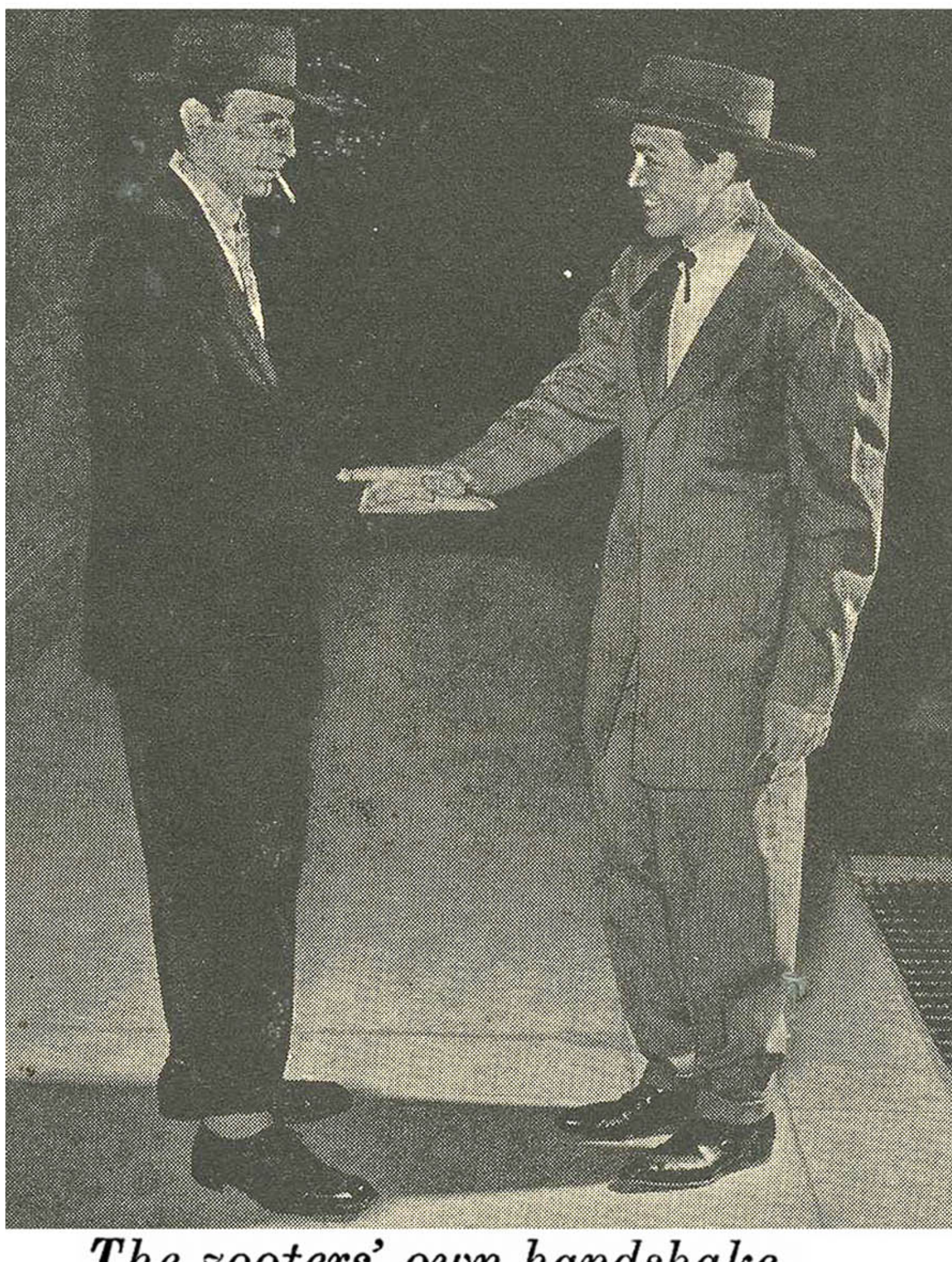
The zooters' own handshake, palm to palm

Although the war hit swing addicts amidzoot—a WPB order last March limited men's clothing to slightly less material than the average prewar business suit—the jive world took it in stride.