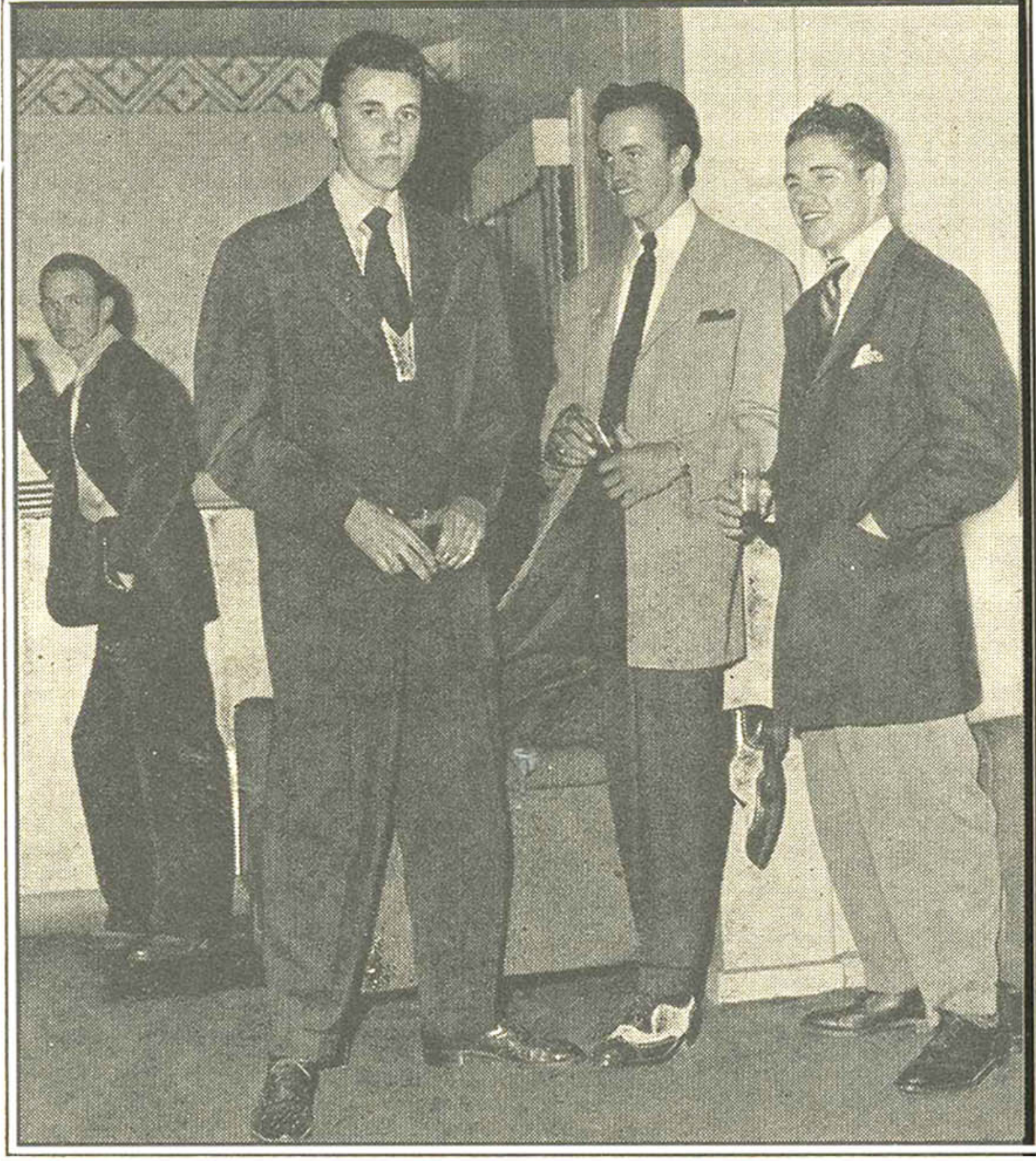
Moderate zoots, with and without contrast

Harlem sartorial artists came up with a modified zoot, proclaiming its self-sacrificing patriotism in V-for-victory pockets, stitching, and pleats. And tailors prophesied last week that quality, not quantity, would set the style. Detail will be wackier, and colors louder. In other words, the zoot will still be solid, if you dig me.