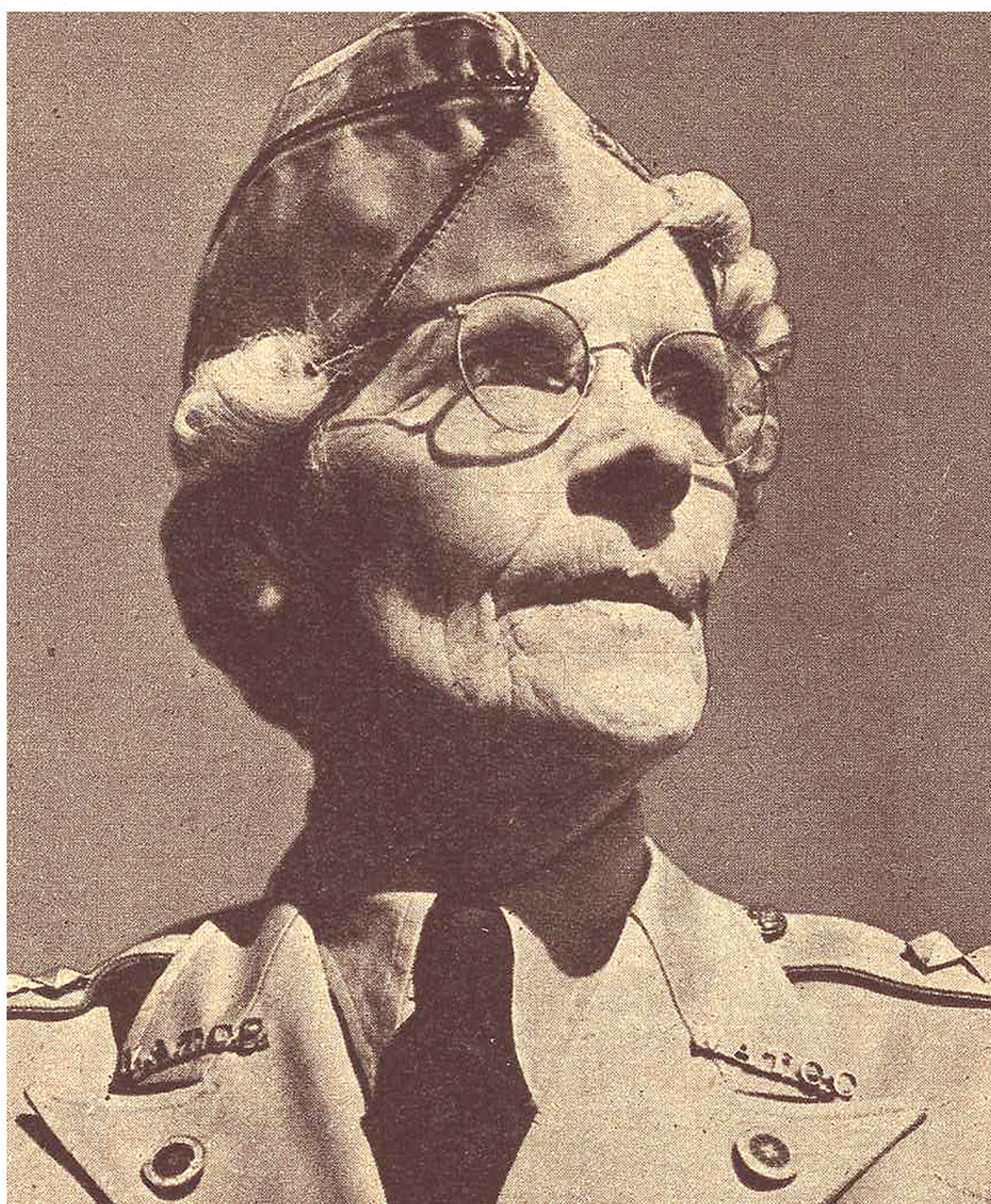
PARATROOPER COLONEL JULIA DOWELL has order of Purple Heart, commander-in-chief of Women's Ambulance and Transportation Corps, directs a group of women parachute jumpers.