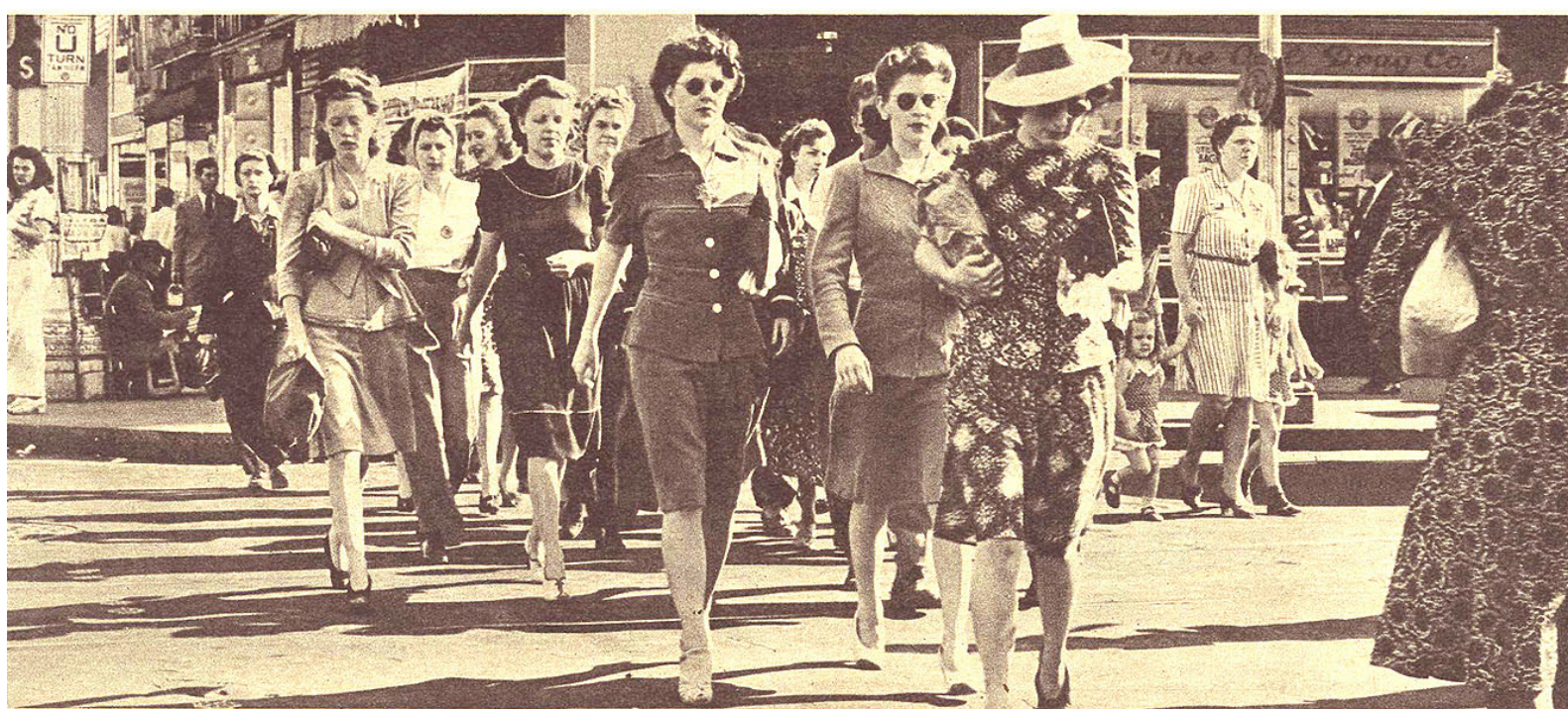
NO SET RULE OF DRESS IS FOLLOWED BY WOMEN IN WAR. THEIR WAR OCCUPATIONS MAKE ANYTHING ACCEPTABLE, AND BECOMING.