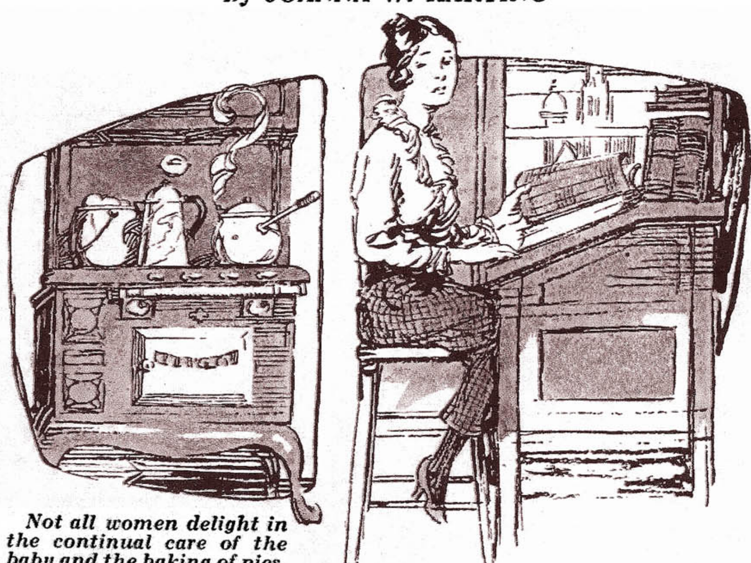
Not all women delight in the continual care of the baby and the baking of pies.

T WO years ago when the men began to drop out of the industrial world at the call to the colors their women associates gradually slipped into their places, and in the majority of cases effectively filled them.