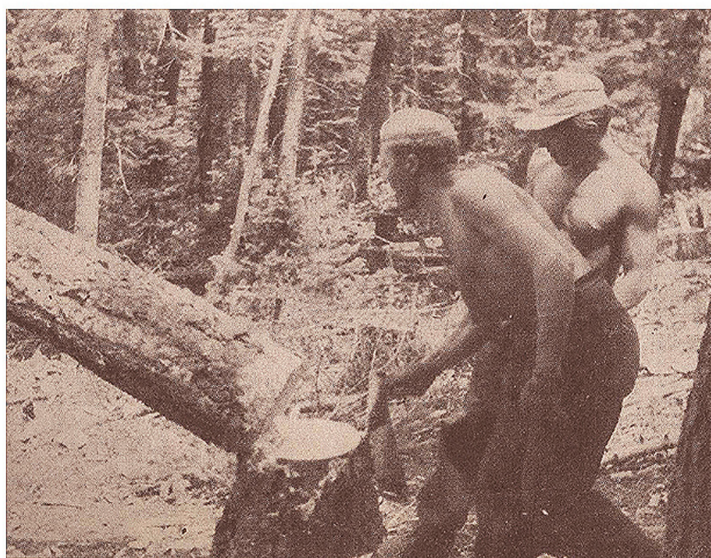
INTERNATIONAL RED CROSS

U.S. soldiers give full military honor at the funeral of a Nazi prisoner. Several captives have died, some killed themselves, a few were "purged" by Nazis