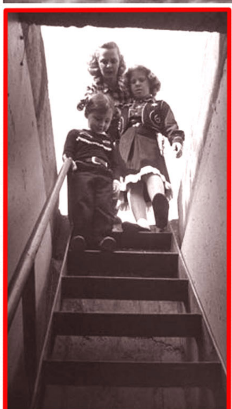
Manufactured by Walter Kidde Nuclear Labs, the Kokoon has its own gasoline generator, toilet, filter.