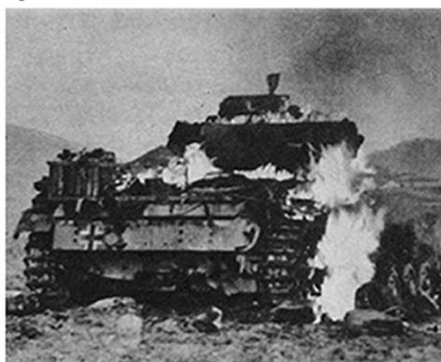
"He also serves who sits and burns." A Nazi big one serving the Allied cause in Tunisia.