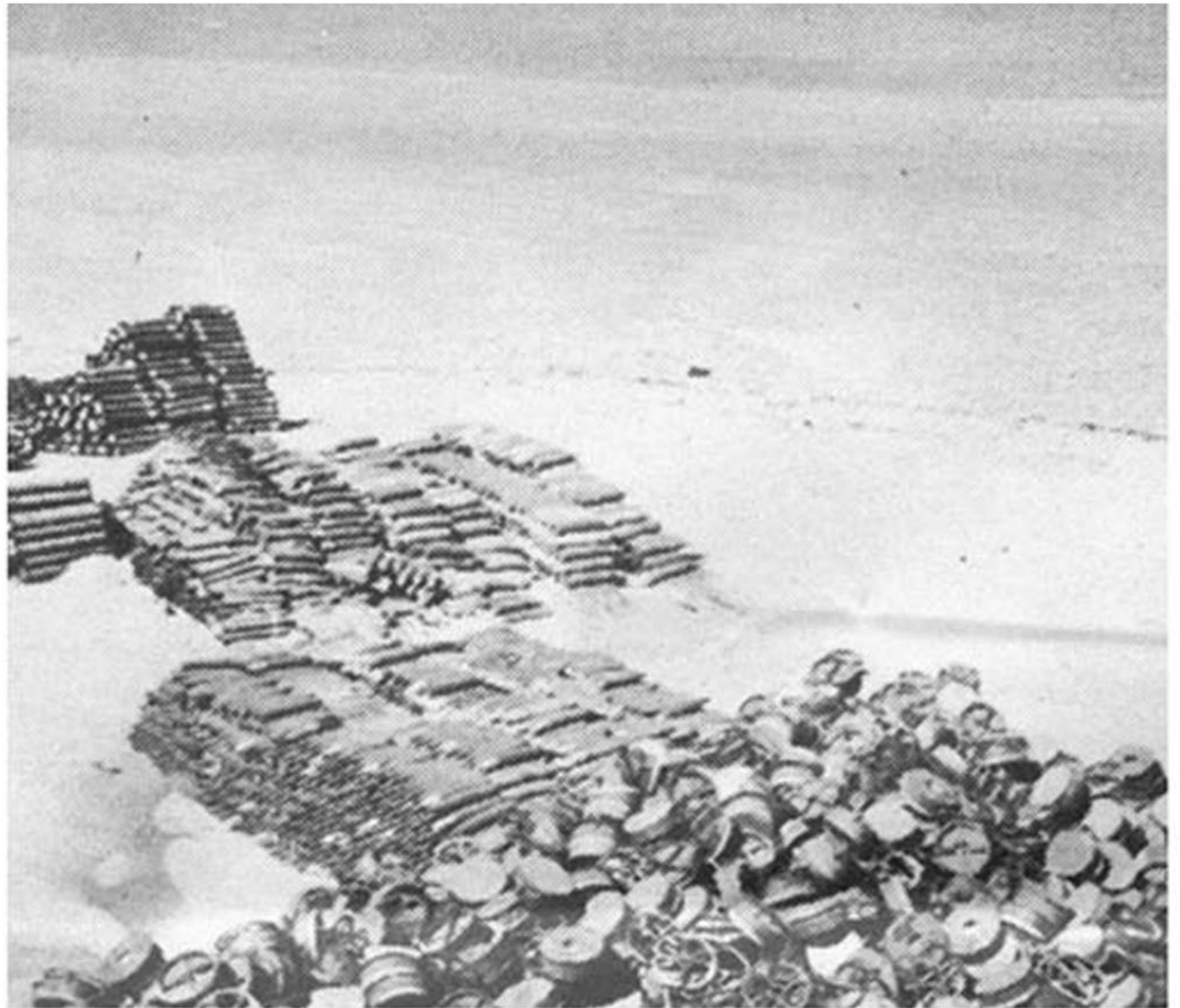
Mines, shells and other ammunition are piled on deserted Utah beach. When a new mine is located, it is rendered harmless and added to the growing pile

The 88s were still whooming in when Janicki