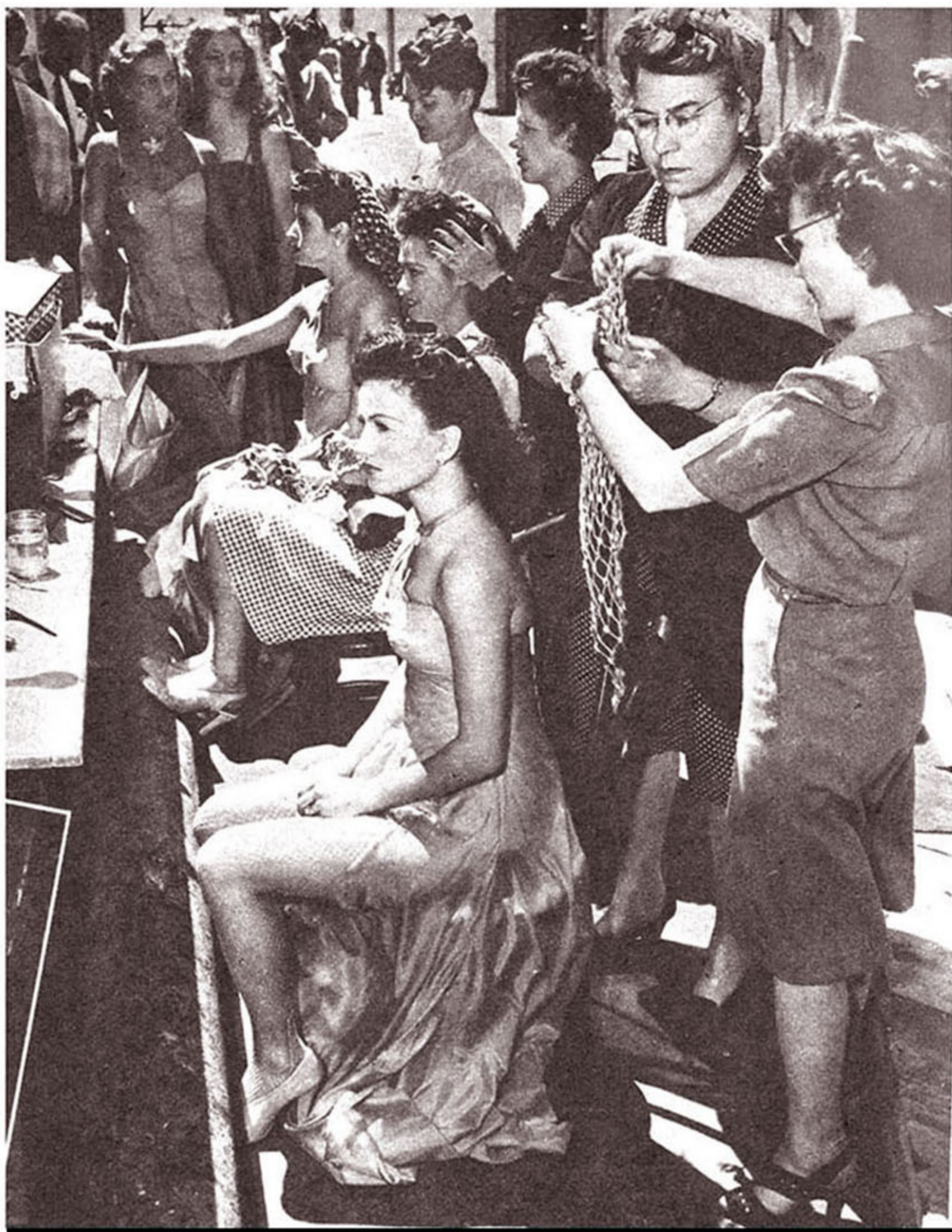
Here's proof that they can still pick 'em out in Hollywood. These girls were chosen by MGM to act in the Ziegfeld Follies. Wardrobe women are getting them ready for a coming number.

War-time restrictions result in sets made from chewing gum and glue, but cameras bravely continue to grind out epic after epic.