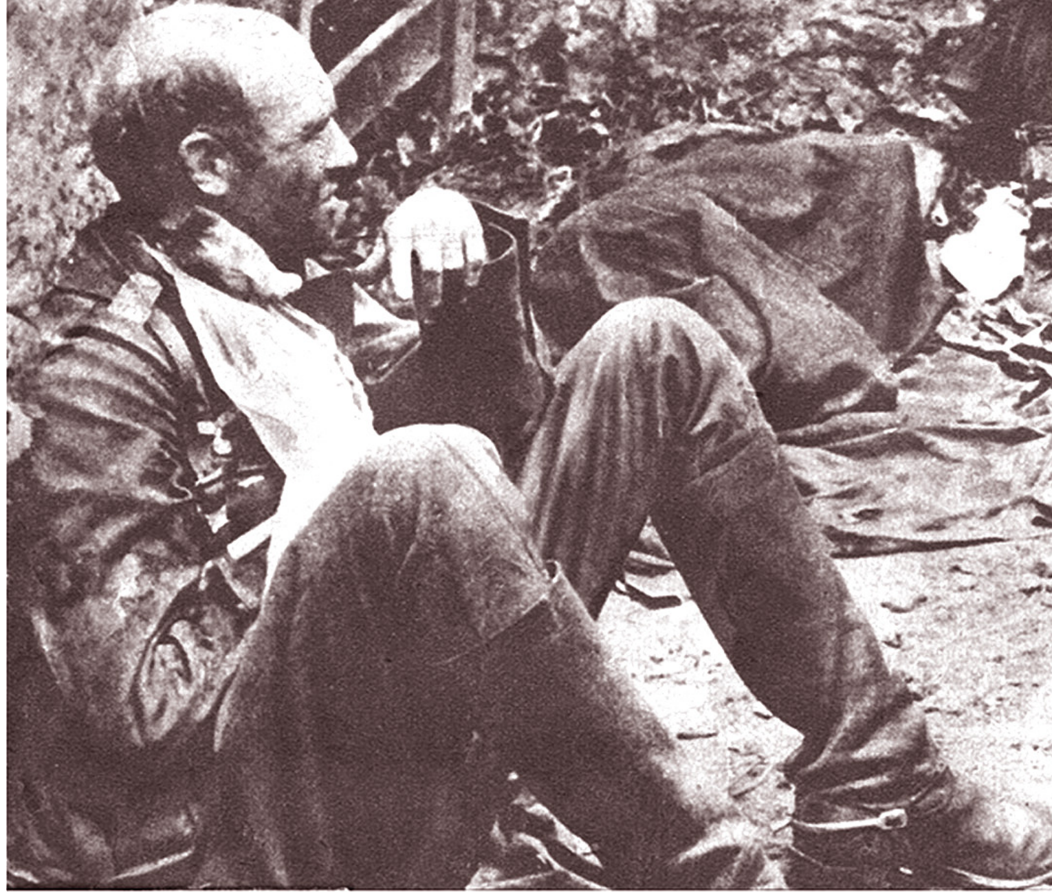
THIS BALDING NAZI PRISONER PROVES THAT HITLER'S ARMY IS NO YOUTH MOVEMENT

we came over, we found the big fields had been flooded and all that was left were the small fields with tall trees, maybe 70 feet high. And we ran into enemy machine-gun and mortar fire."