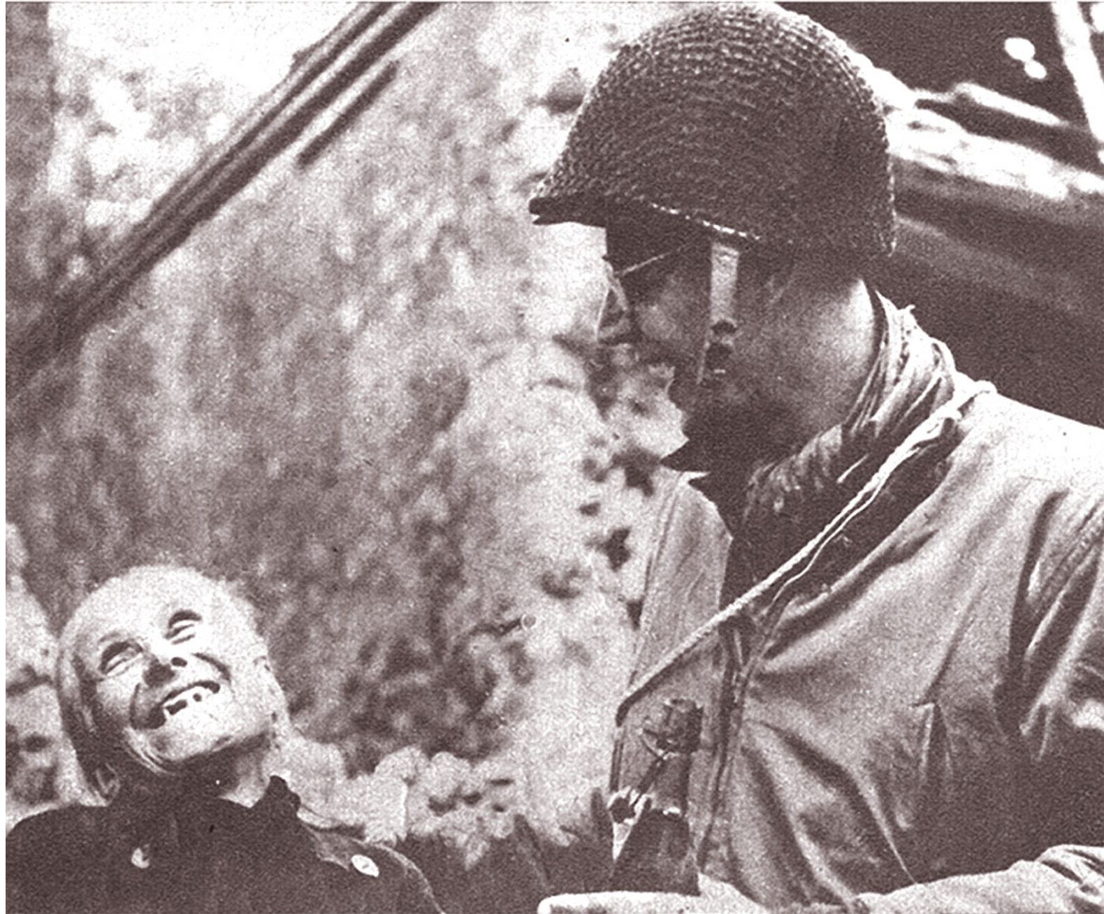
THERE'S HUMOR, TOO, AS A U.S. SOLDIER JOKES WITH AN AGED FRENCH WOMAN

"There was no field big enough even for a glider to land on, much less a power plane. Those fields are all narrow and small and they've got