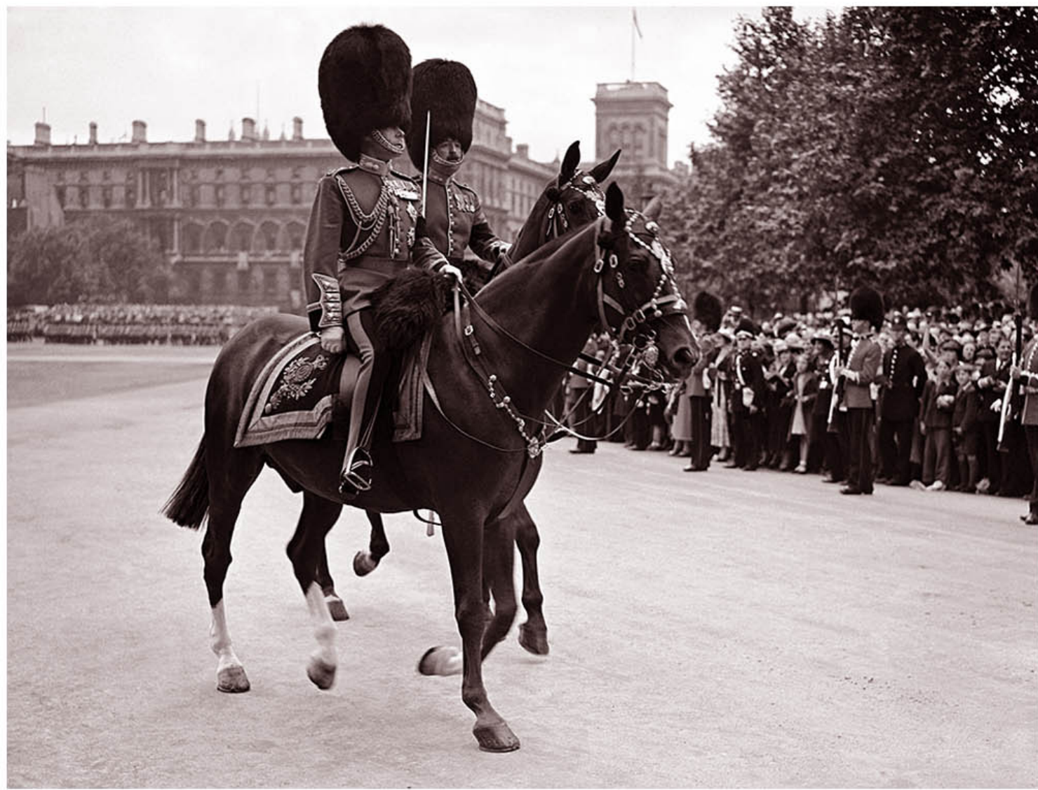
The Prince at the ceremony of Trooping the Color

cares and worries, he still has that happy, boyish smile.