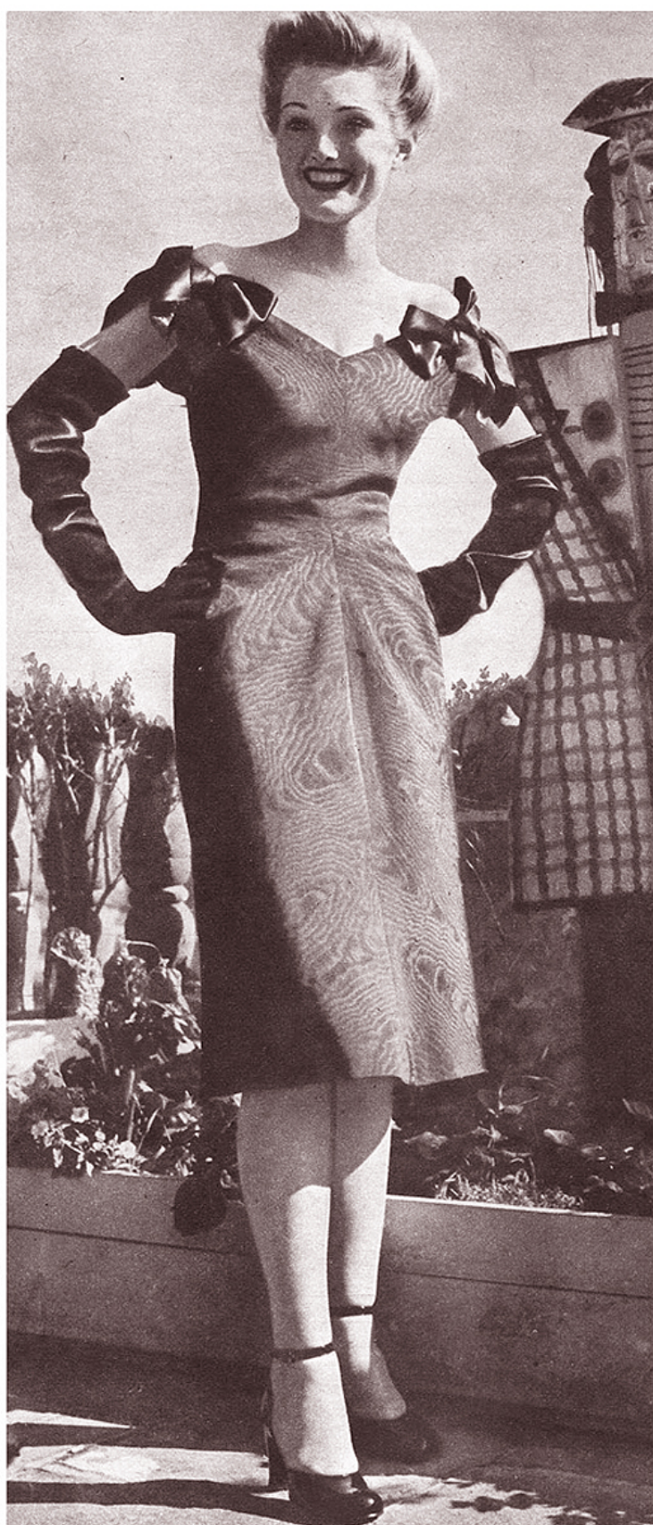
A SHORT FORMAL, THIS TOBACCO MOIRE is a definite product of the times. Cigarette-slim in contour, it boasts a low neck, short skirt, bows in place of sleeves and only a suggestion of hip drapery. It is a design that requires only three yards of fabric while comparable pre-war styles called for six yards or more. Satin dinner gloves are bought separately.