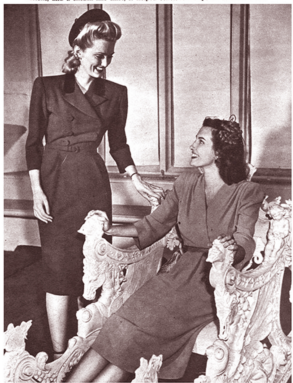
THIS SIMPLIFIED DARK WOOL SUIT is a typical wartime fashion. Single-breasted, collarless and devoid of wasteful detail, it measures up to the WPB order. Similarly the fabric buttons, embroidery and narrow gored skirt help make it a perfect 1943 design. The dress in the foreground gives the usual back view of the straight silhouette. Note band instead of belt.