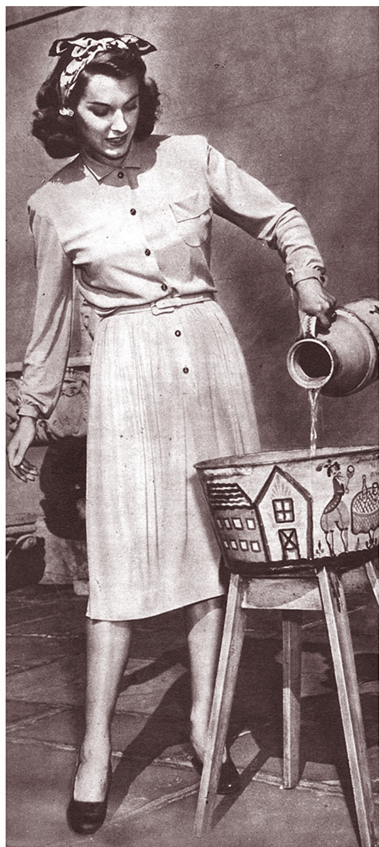
AT LEAST ONE YARD OF JERSEY was saved in cutting this rayon classic. Slight gathers, front and back, achieve a dirndl effect without using excess yardage. Under the new L-85 apparel ruling a dress can utilize only cloth needed for basic silhouette (specified for size) and cloth to cover trimmings (limit—700 square inches of non-transparent fabric).