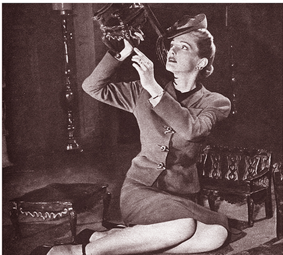
THIS CIGARETTE-SLIM SUIT DRESS conforms to the L-85 regulation permitting no more than two pockets and one collar or single revers. Collarless and with a flap detail that simulates a four-pocket arrangement, this design saves one yard of wool. By using a scarf in place of the blouse, plastic instead of metal buttons, and a sheath-like skirt, it helped conserve manpower and materials.