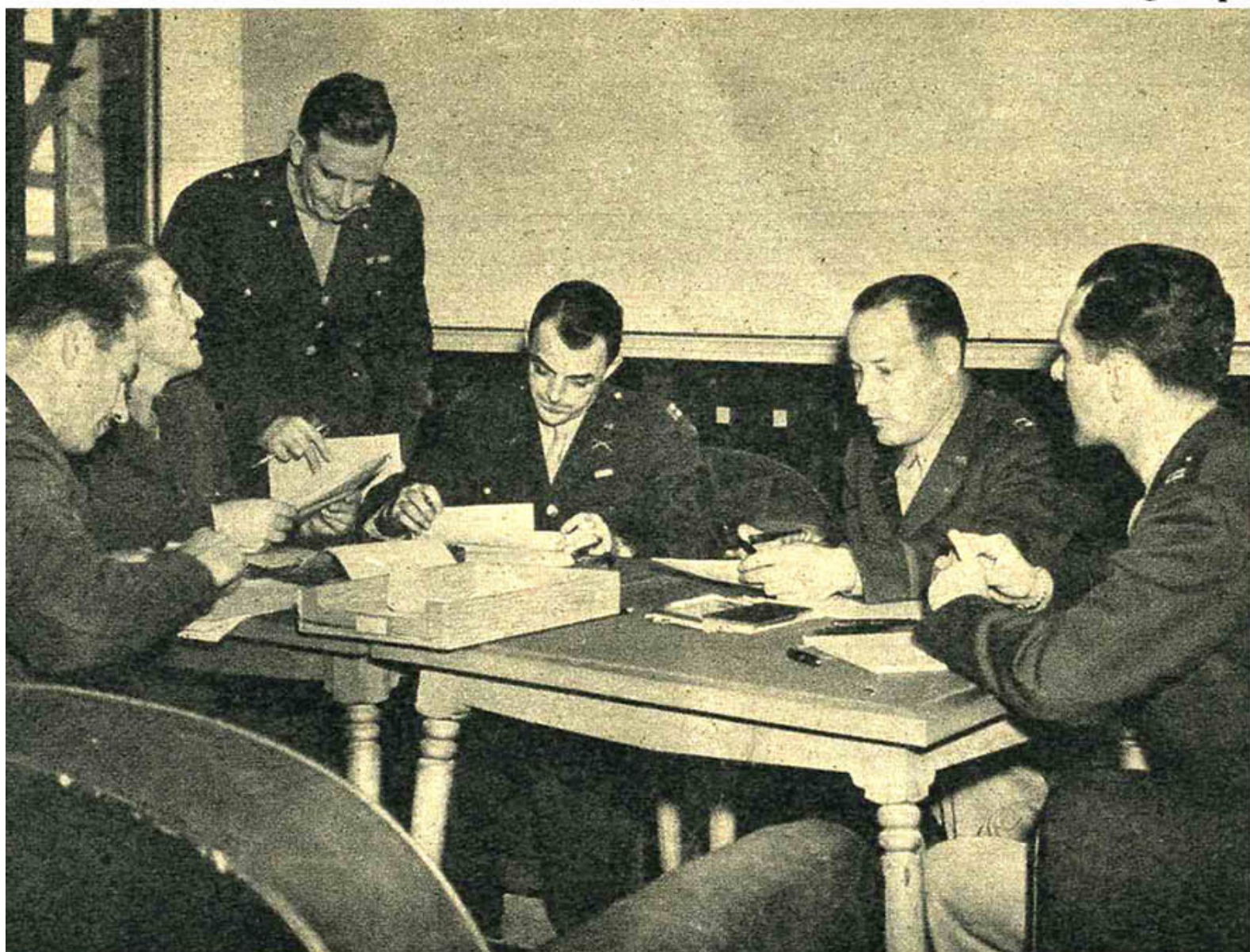
WAR DEPARTMENT CENSORS going over copy in North Africa. All news stories are passed through censor's hands, but more information reaches civilians in this war than in last. Very little is now being deleted.