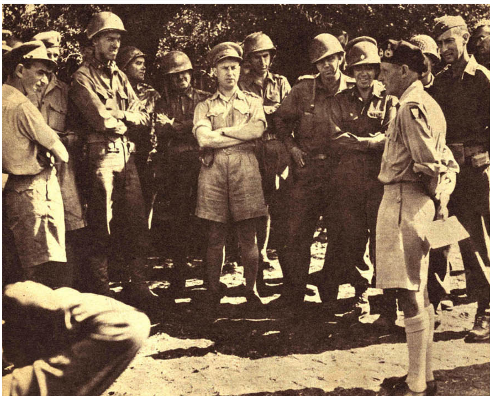
GENERAL MONTGOMERY TALKED FRANKLY WITH CORRESPONDENTS AT ITALIAN FRONT. GEN MARK W. CLARK IS BEHIND HIM.