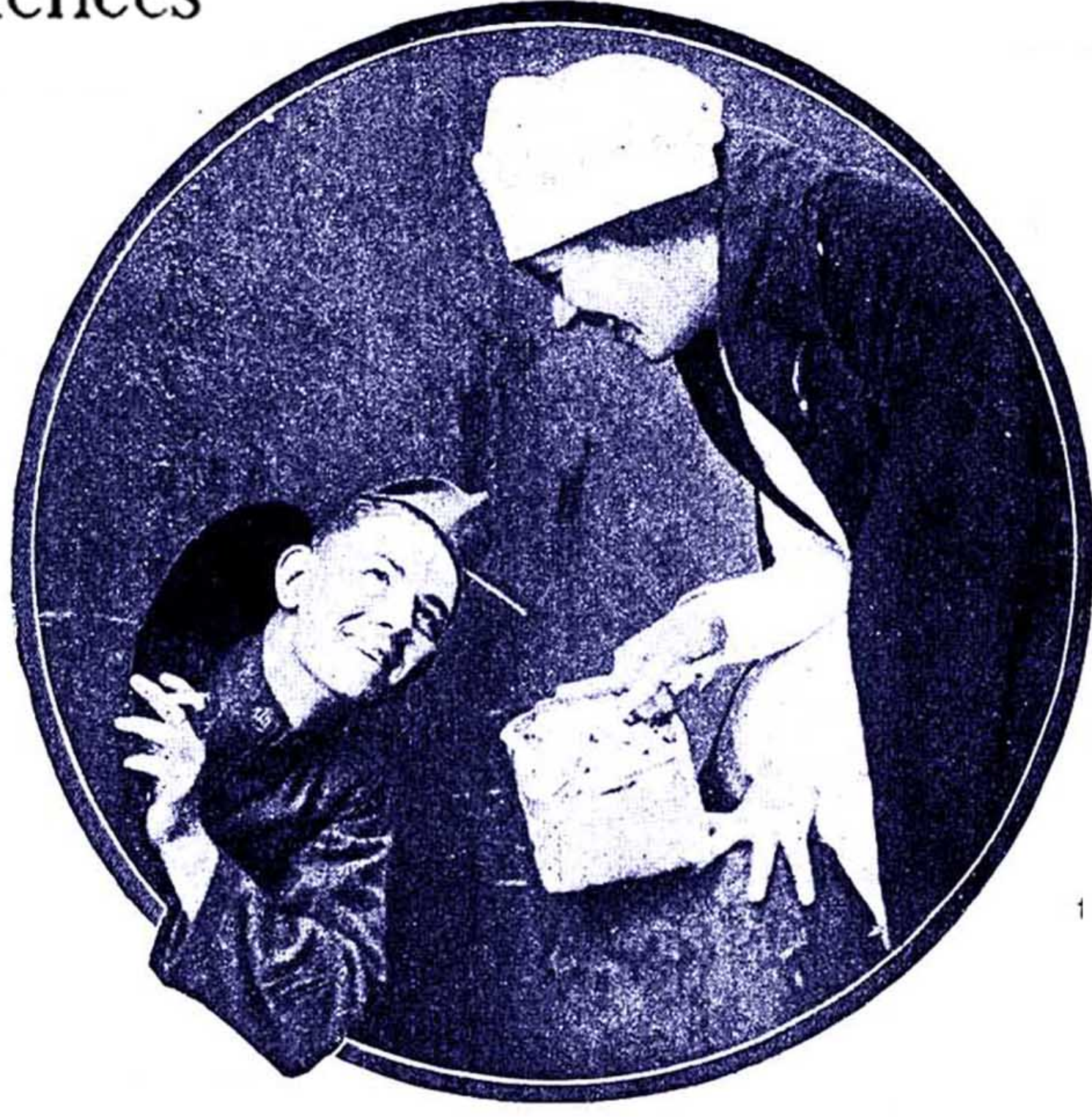
Home again and a Red Cross welcome.

Yanks Return from Chaotic Russia Fed Up with Service & Seek New Words to Describe Their Unusual Experiences