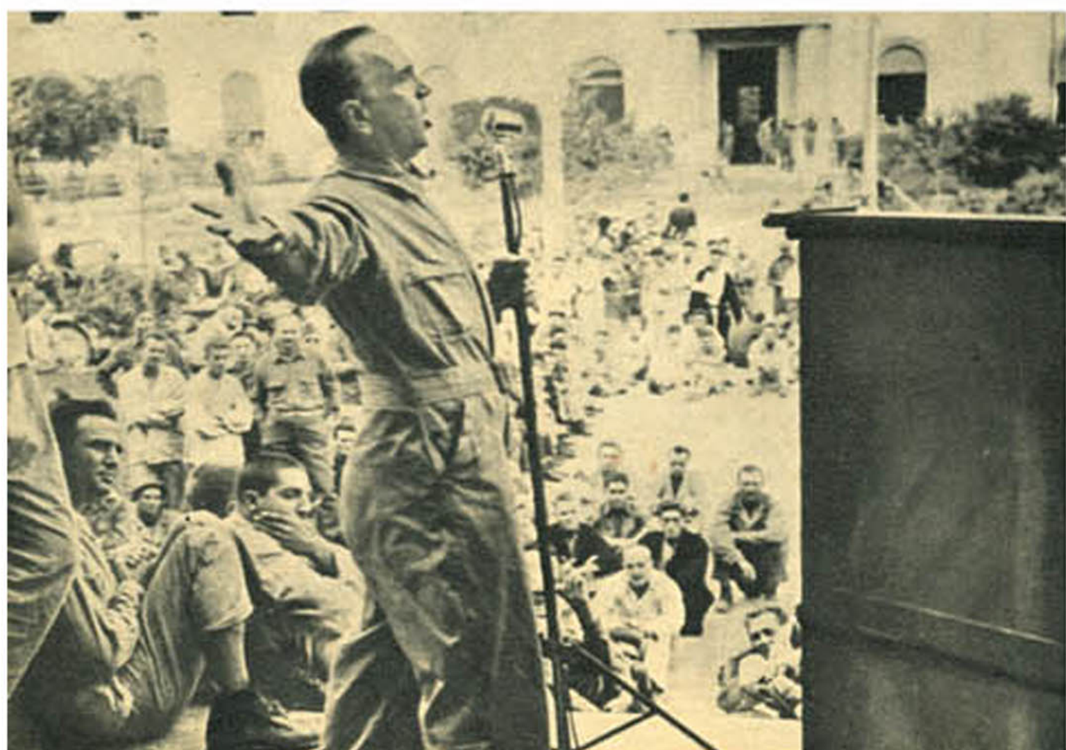
Al Jolson, first to chart camp shows circuit, performs in coveralls in Palermo.