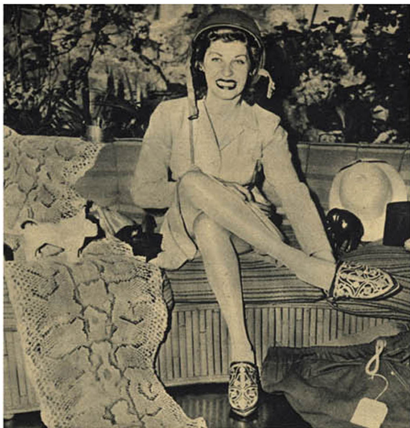
SOUVENIRS picked up during her four-months tour of North Africa are assembled around Martha Raye (above) after her return to the States.