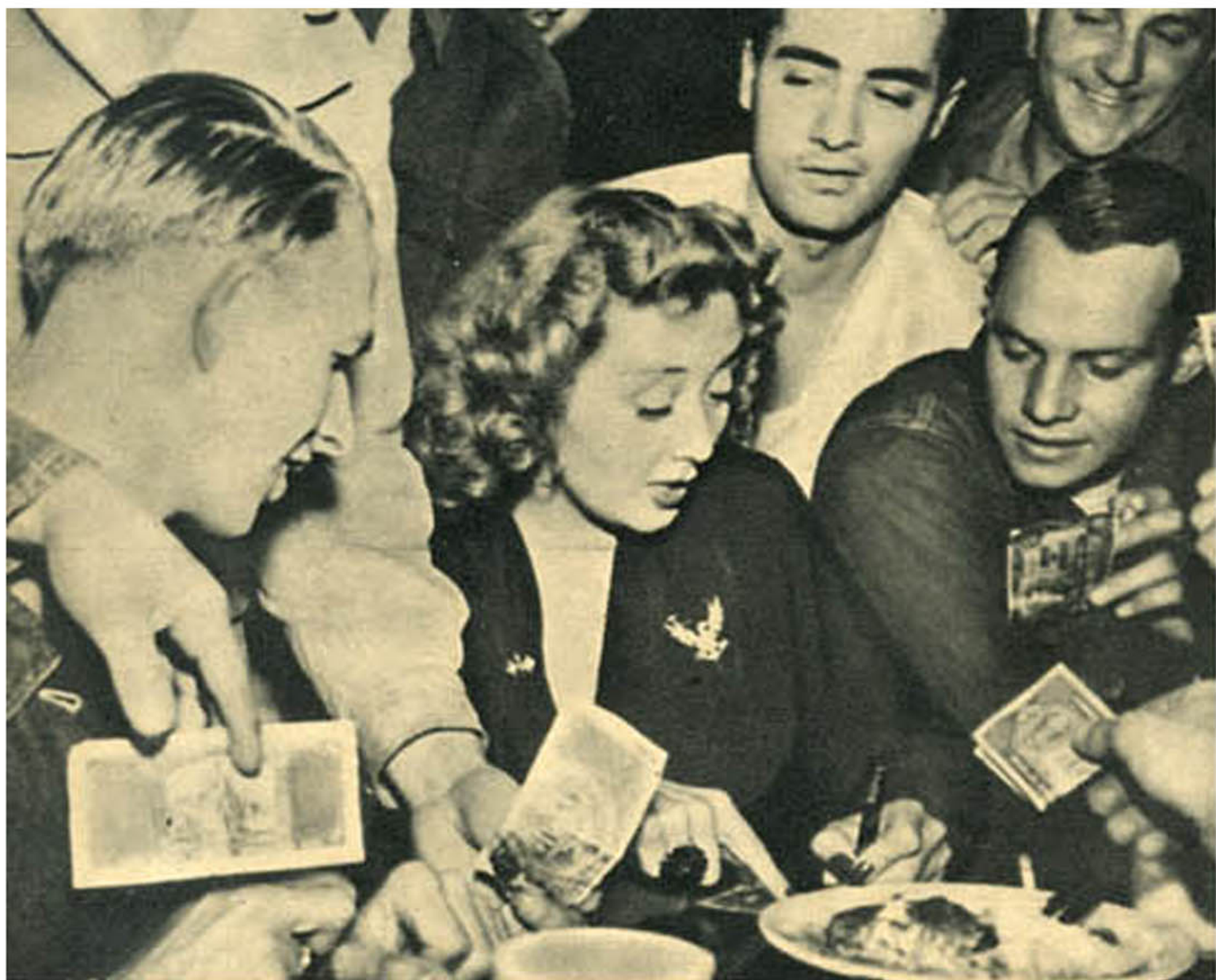
JOAN BLONDELL brought welcome feminine entertainment to the boys up in bleak Newfoundland. When she introduced the Short Snorter Club there, she found plenty of prospective members who wanted bills autographed.