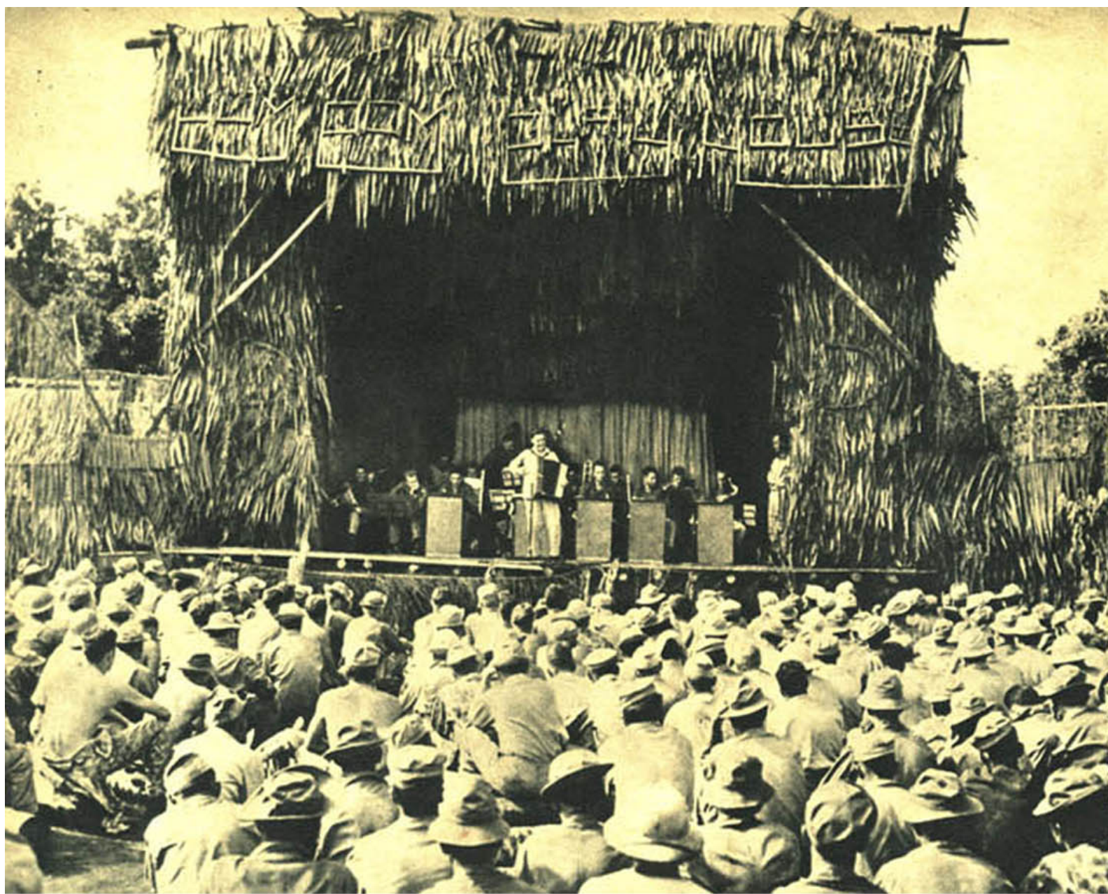
U. S. O. CAMP SHOW PEOPLE ENTERTAIN APPRECIATIVE SERVICEMAN AUDIENCES THE WORLD OVER. HERE THEIR THEATER IS A THATCHED AUDITORIUM IN NEW GUINEA