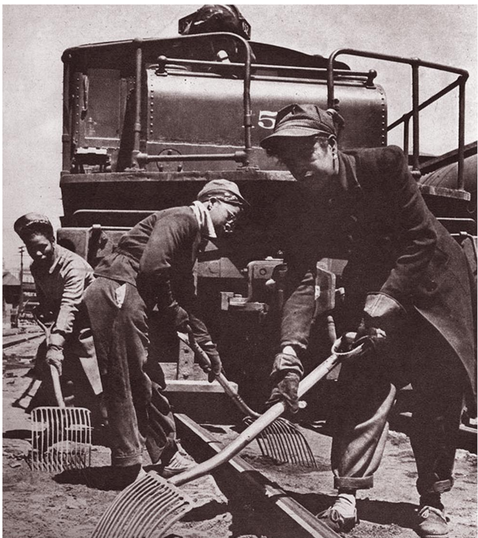
TRACK GANGS OF FIVE TO 20 GIRLS KEEP THE RAILROAD YARDS NEAT AND SAFE BY CLEANING UP DEBRIS