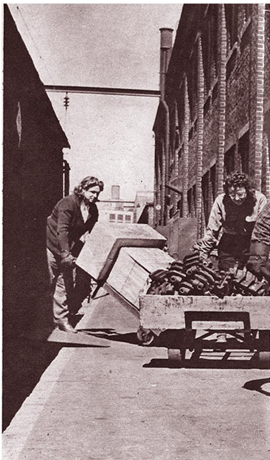
TRUCKERS WHEEL REPAIR PARTS FROM FREIGHT CAR TO STORES DEPARTMENT OF PENNSYLVANIA RAIL YARD.