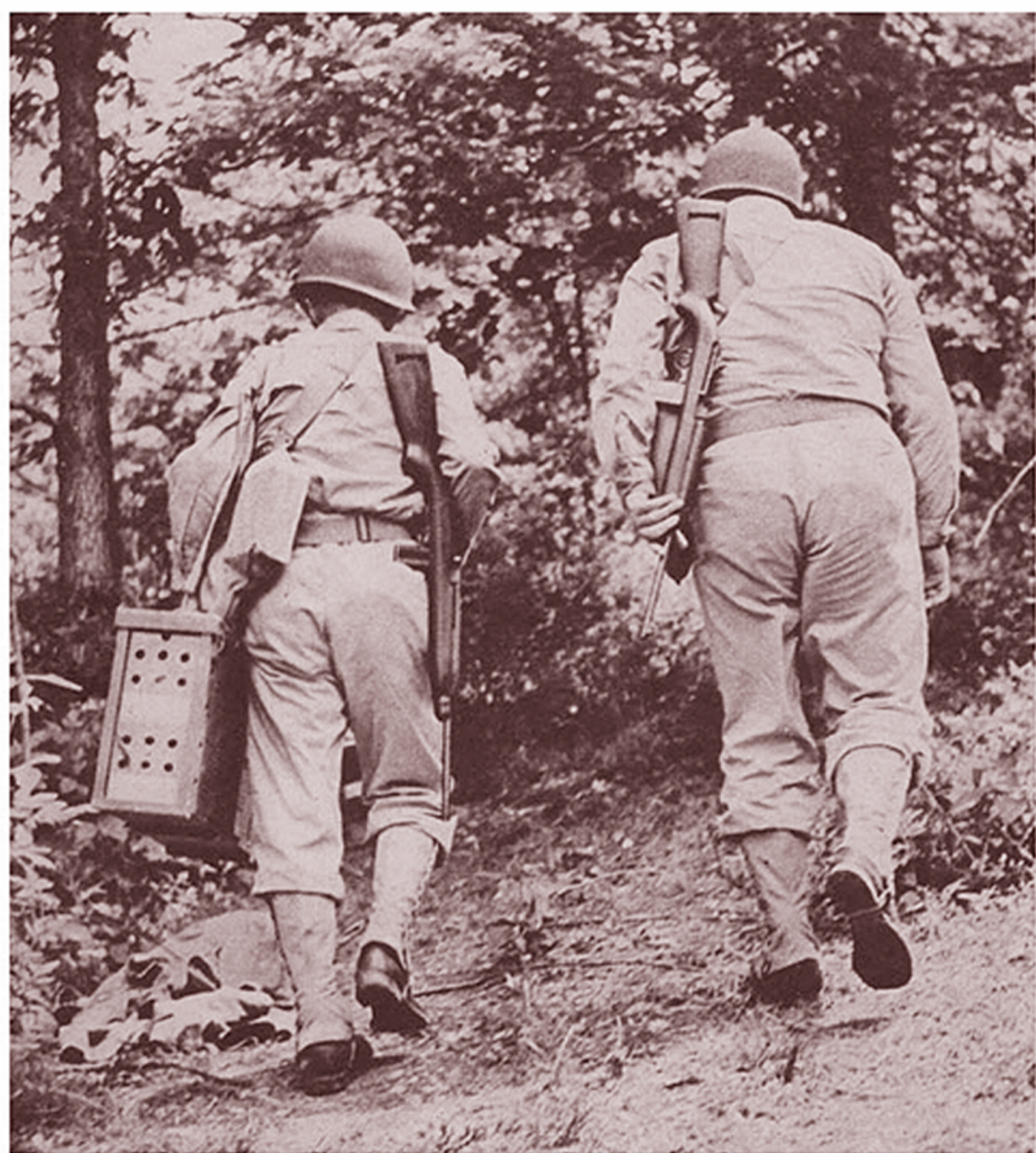
COMBAT TEAM of infantrymen starts on maneuvers with two pigeons in one of the new release boxes and equipment for sketching enemy positions. Birds released are seldom noticed by the enemy and are impossible to shoot down.