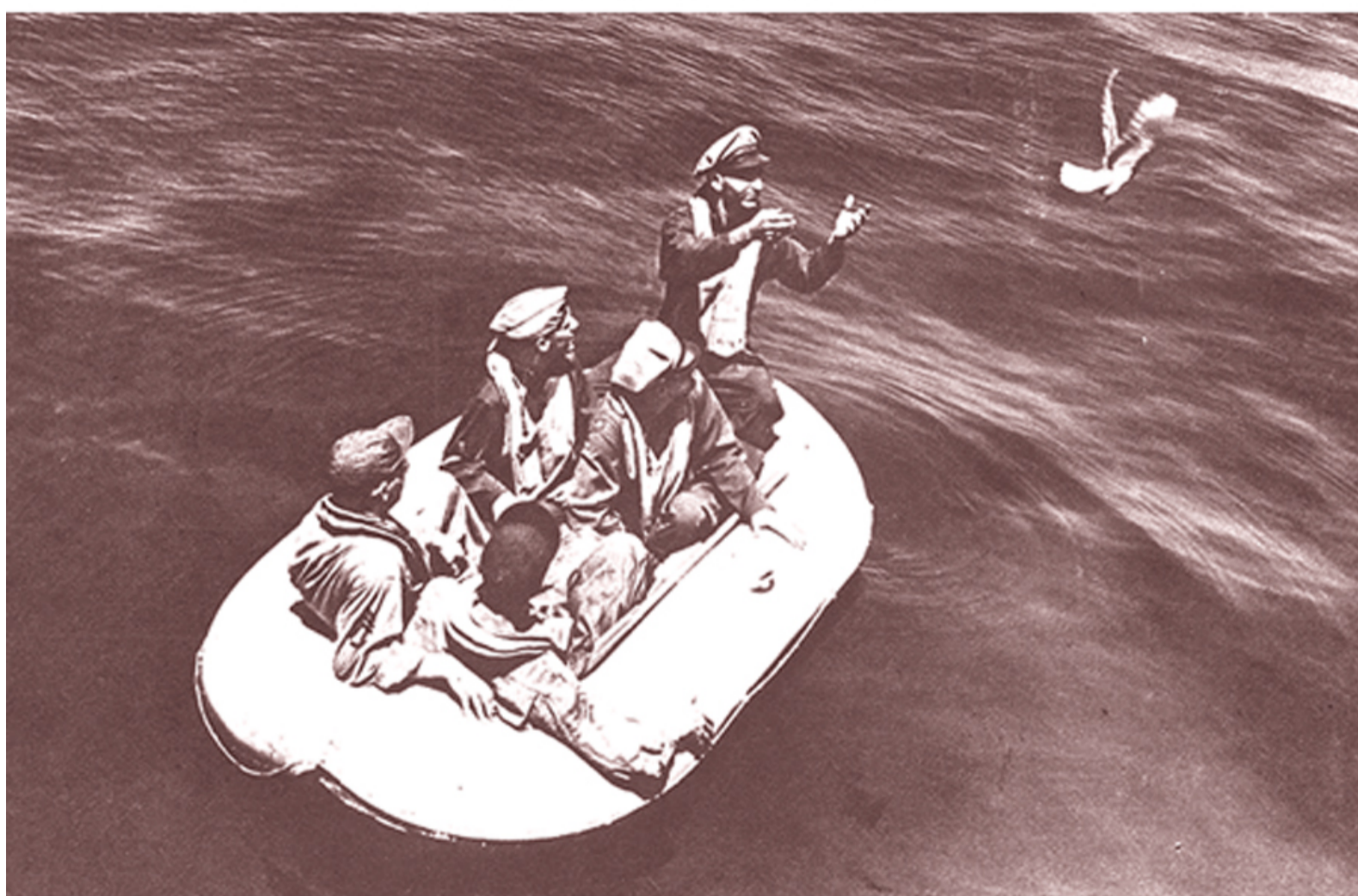
RUBBER ARK SENDS FORTH A DOVE. BOMBER CREWS, FORCED DOWN AT SEA, REPORT POSITION BY COURIER. A RADIO WOULD BETRAY THEIR LOCATON TO ENEMY SUBS