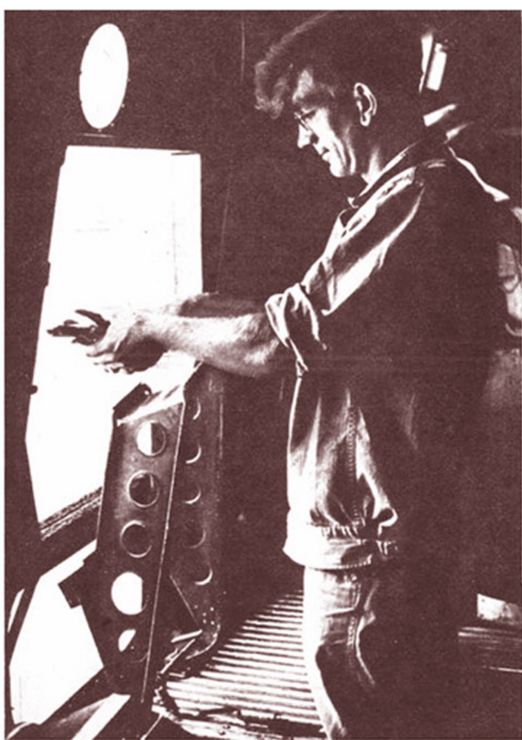
TAKE-OFF from bomber: bird is held facing the air-flow and released. "Signal by pigeon" cannot be intercepted.