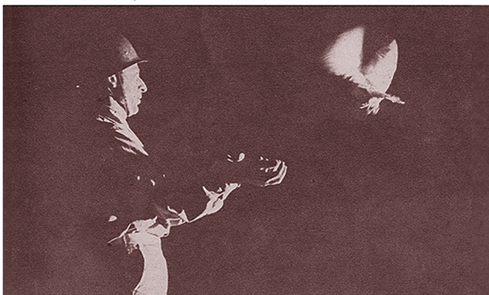
NIGHT FLIGHT: 14 years of experiment and breeding have given the U. S. Army a night flying pigeon. Here Staff Sergt. Charles Purpura releases one for test flight.