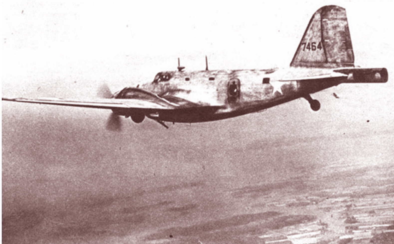
PIGEON IS SEEN directly below the tail of the plane. As bomber pulls away from him, he circles once, then heads straight toward the home loft. Science can't explain homing instinct