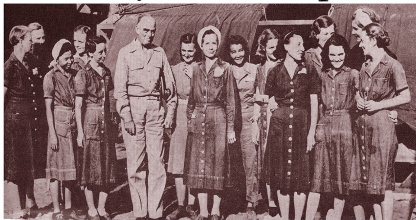
Below: Dramatically rescued after 37 months as prisoners of the Japs, these Navy Nurses were awarded the Bronze Star. Photographed with Admiral

Thomas C. Kincaid, USN, they are wearing uniforms made in prison from ripped-up dungarees. During their imprisonment they worked ceaselessly to care for their fellow internees.