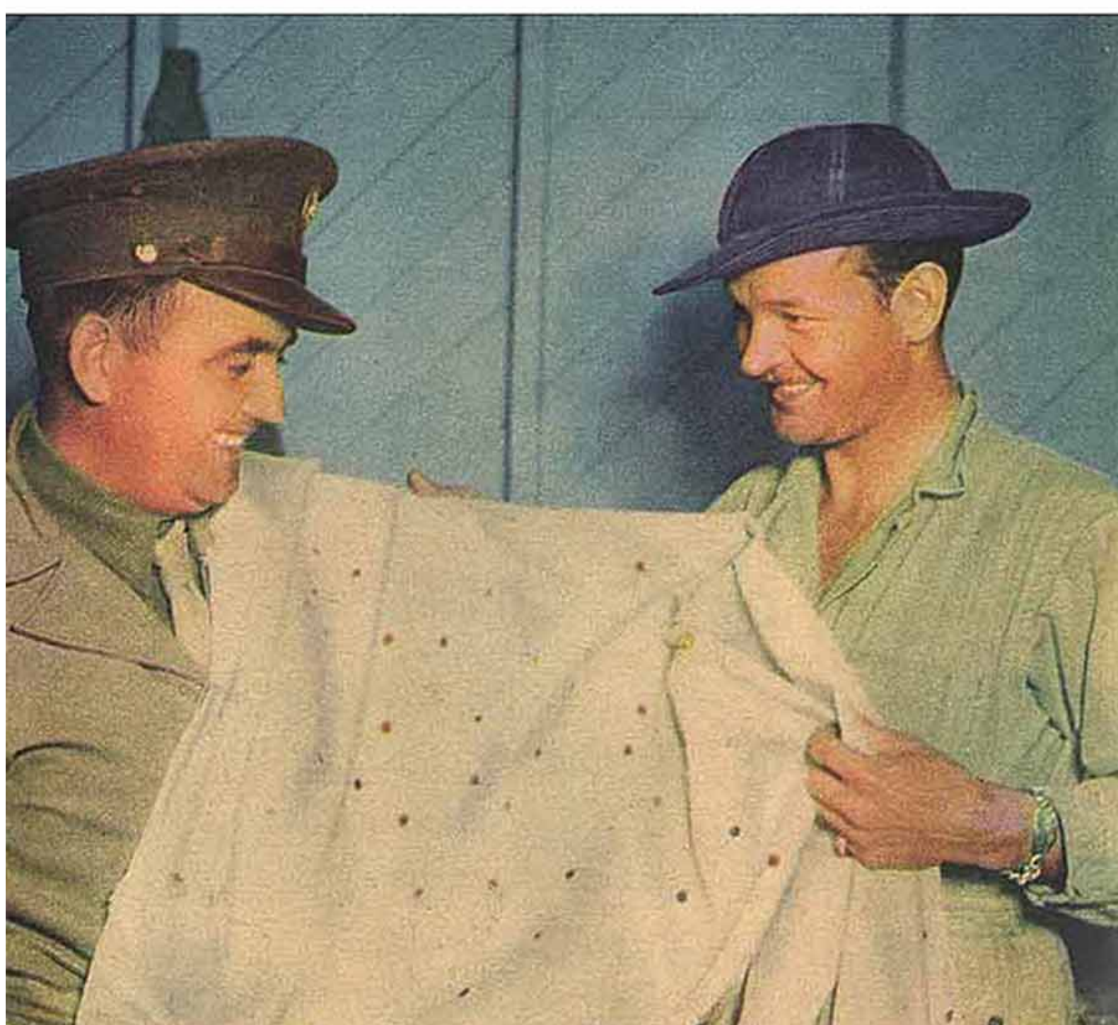
INDIVIDUAL SCORES made on a target sleeve are computed by the colored markings left by the bullets. Men who fail after five weeks of training are "washed out" as gunners.