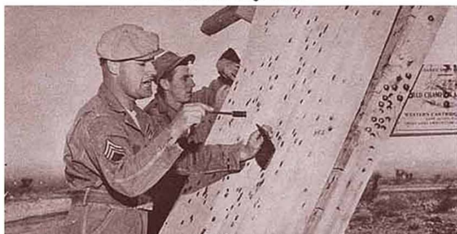
PRELIMINARY TRAINING takes place on ground, where men shoot at stationary targets such as this one. Later they practice from trucks, then in plane.