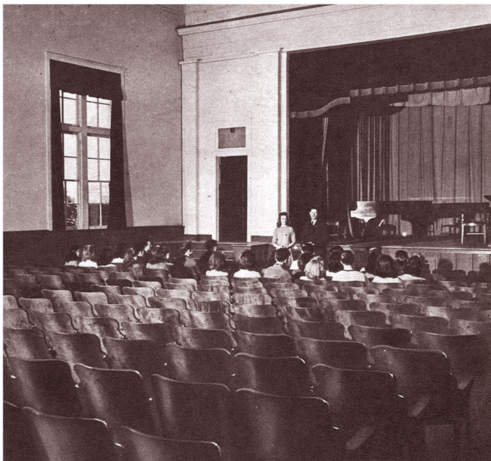
NEW TEACHERS ARE SCARCE: NEARLY EMPTY HALL IN GEORGIA TEACHERS' COLLEGE HOLDS ENTIRE SENIOR CLASS

of rationing, salvage and bond sales. But the fact remains that at this critical time in our history between 20,000 and 25,000 positions have been abandoned and thousands of classes are overcrowded. Look at these figures: In October, 1939, there were practically no teaching jobs vacant. In October, 1943, there were 7,700—and in addition, about 57,000 more positions had to be filled by teachers who could not meet regular certification requirements. Conditions this year are much the same. Why have we suffered these losses?