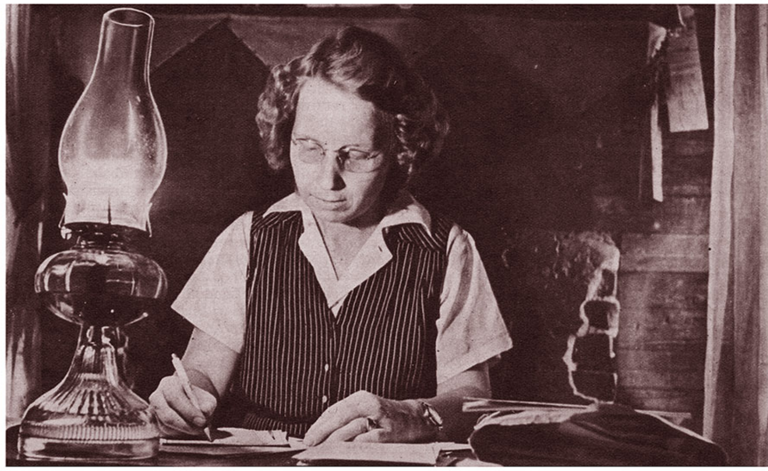
TEACHER'S HOMEWORK LASTS UNTIL LATE—HEAVY SCHEDULE LEAVES HER LITTLE TIME FOR RECREATION

Yet, at a time when the nation must have more and better education, many teachers are missing. By "missing" I do not mean to cast unfavorable criticism. Every community can testify to the competent and unselfish job teachers have done both at their posts and in voluntary wartime tasks