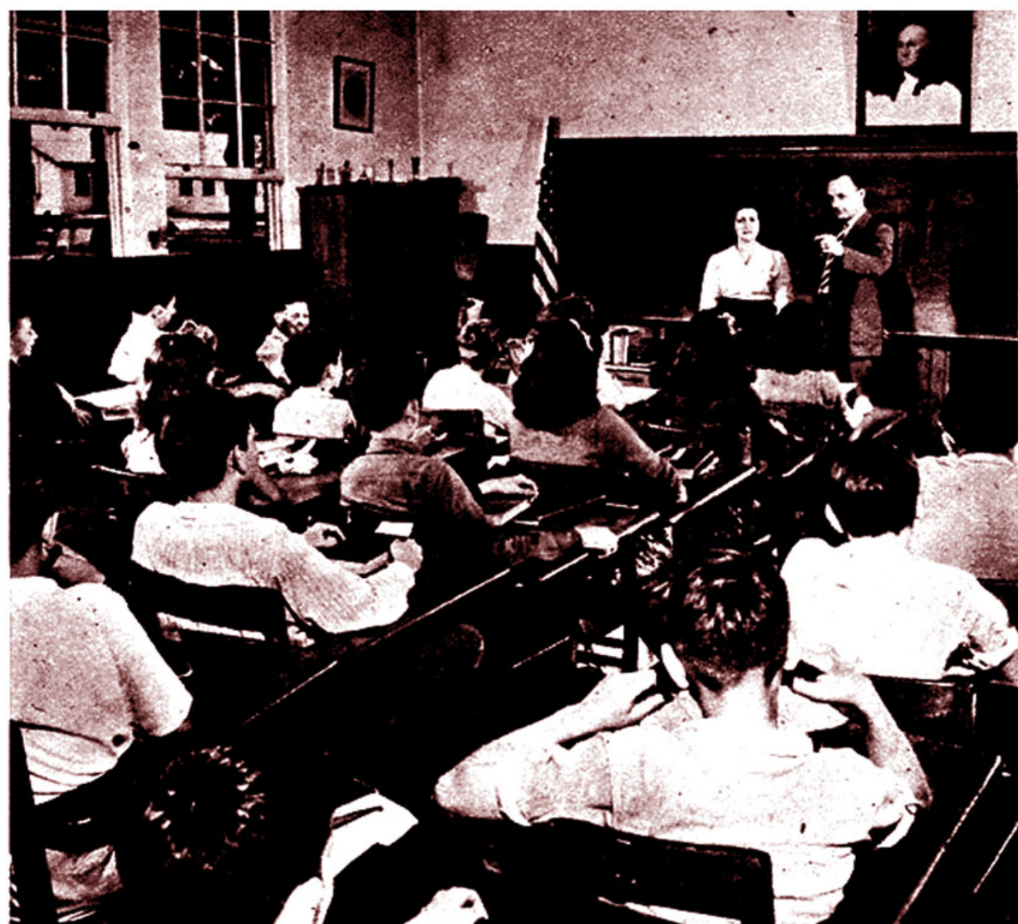
NEW TEACHER takes over, the sixth this class has had in seven months. She is an Army wife, may have to leave at any moment.

Let there be no mistake about it—the danger is here. Ignorance is a field from which dictatorship can spring. A younger generation, growing up in ignorance, will weaken our democracy for, under certain conditions, it could be captured by demagoguery and fraud. Saving America's schools may mean saving our country twenty years from now.