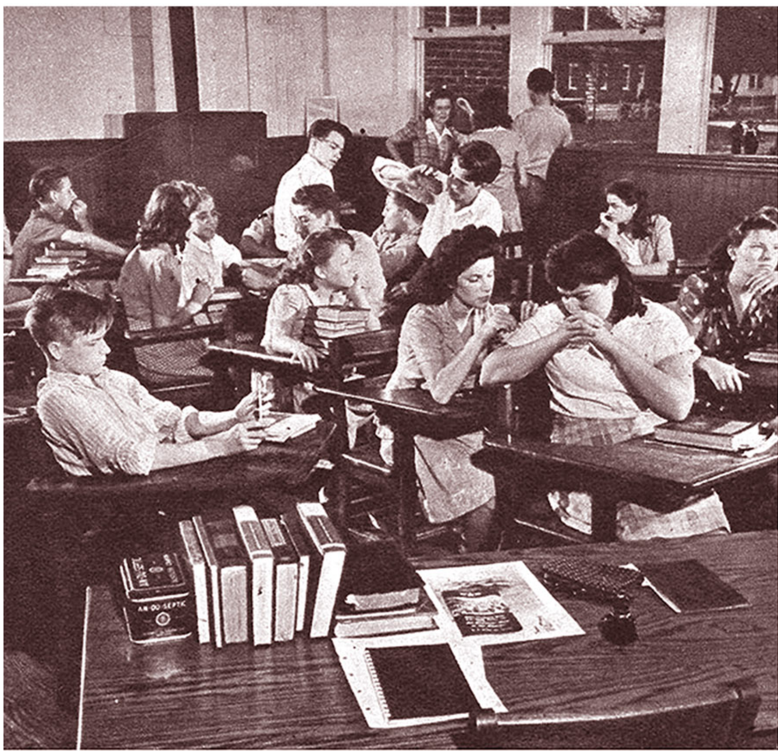
NO TEACHER: kids are bored and restless. This condition is found all over the nation where classes have been left without teachers.

And yet, income increases for other groups have been three or four times as great. Right now, in 1944, with the cost of living what it is, 30 teachers in every 100 are paid less than $1,200 a year. Five in every 100 receive less than $600. Is it any wonder that in the face of rising living costs, offers of jobs in essential industry and business at better pay have found teachers willing to leave the classroom?