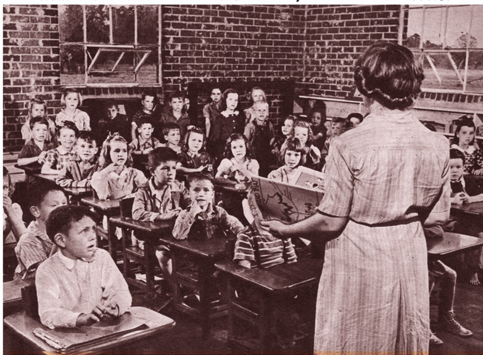
A COMMON SCENE IN MANY STATES: PUPILS STAND IN CROWDED CLASS. THIS SCHOOL IS AT HINESVILLE, GA.

With thousands of teachers at war, the children suffer