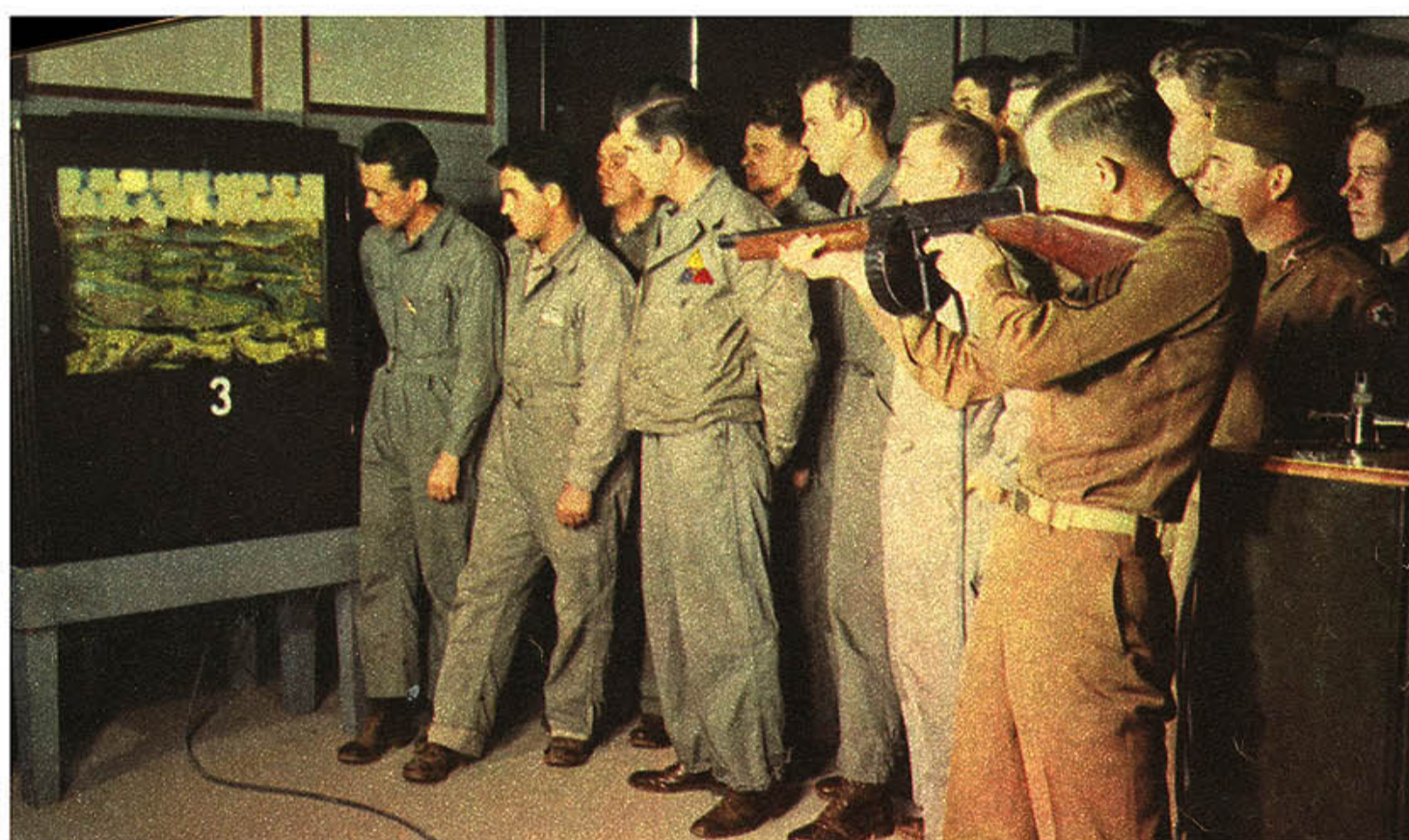
TANK GUNNERS. Men in the Gunnery Dept. at Ft. Knox, Ky., practice marksmanship with an electric-eye gun before going out on the range. The U.S. now has seven armored divisions