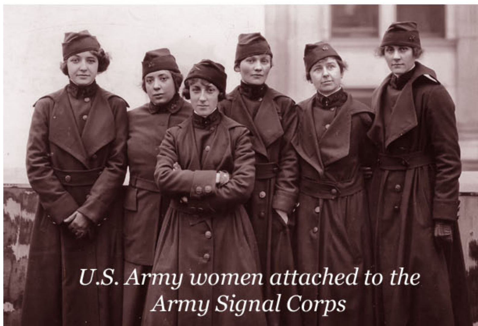
U.S. Army women attached to the Army Signal Corps

aviation program. The board in charge of aviation spent weeks perfecting the plans. It could not, however, take steps to realize them until the council had accepted them and Congress voted the funds.