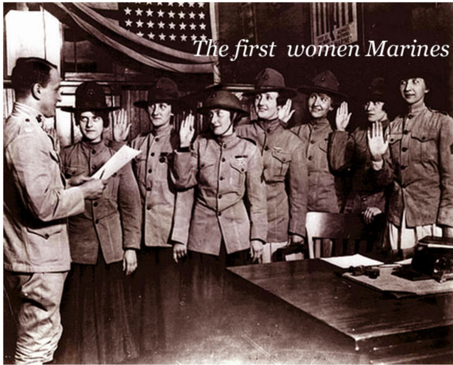
The first women Marines