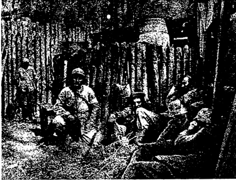
Germans Blinded by Their Own Gas and Captured by the French in Recent Offensive.