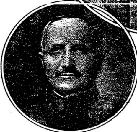
Major Gen. William L. Sibert, in Charge of War Gas Work of the American Army.