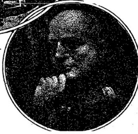
Privy Councillor Haber, Responsible for Much of the Deadliness of German Gas Warfare.

enters into its composition, but a drop of it on a soldier's sleeve penetrates, and, after the lapse of hours, blisters like mustard. It is a deep burn, and causes great swelling. But mustard gas is so innocent in appearance and so inoffensive to the nostrils that the soldiers were not on their guard against it. The chief sufferers were the artillerymen, who threw aside their masks after working for a time amid it. The masks were of little avail, anyhow, for the kind then in use did not last ten minutes in an atmosphere drenched with the drug.