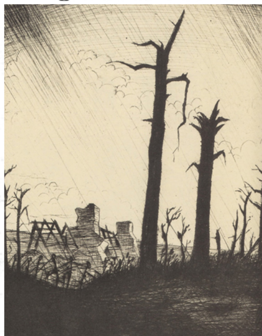
"Reclaimed Country" (1917)

Just as Dr. Johnson maintained that there was some good to be got out of every book, so it may be urged that there is some good to be got out of every artistic theory. The particular good thing to be got out of the work of the Italian futurists was their successful rendering of the suggestion of movement. This was obtained by a generous use of slanting lines in the composition, and this convention not only gives life and movement to such a painting as "Returning to the Trenches," but used regularly and with an avoidance of curves it also tends to suggest the movement of a vast machine rather than of individual human beings. It was the peculiar distinction and triumph of Mr. Nevinson to leave aside all the extravagances of futurism and snatch from it the two things that helped him to render realistically a new world in a new way. From the very first he stood apart from all other painters of the war