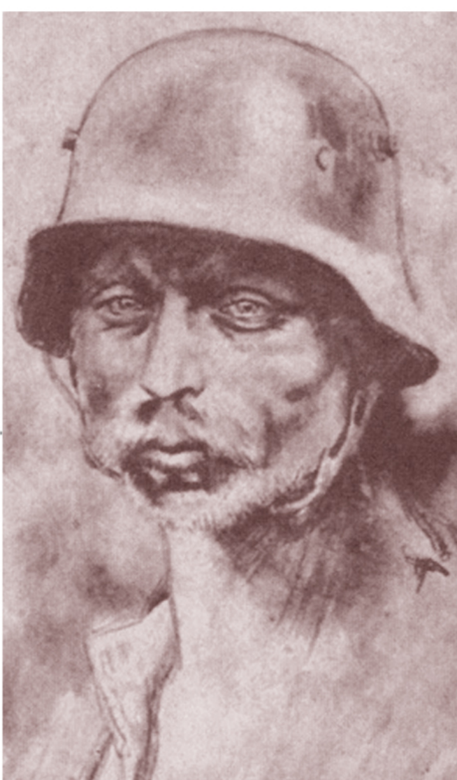
"HEAD OF A GERMAN."

a bending road for his subject, Mr. Nevinson in the first painting of the series conveys an impression of the endless chain of vehicles going up to the front through country unravaged by the war. The very poplars diminishing in the distance all add to the suggestion of infinity. In the second painting the big guns are seen passing through the area of aeroplane observation and frontal light railways. The third shows infantry and horse artillery, beyond the dumping grounds, passing over country recently recaptured. The emphasis on the diagonal lines of the advancing infantry is more subtle here than in the earlier "Returning to the Trenches," but the method is the same, and an admirable suggestion of movement is again the result. Equally successful is the treatment of the gun-team, the taut legs of the animals eloquently conveying