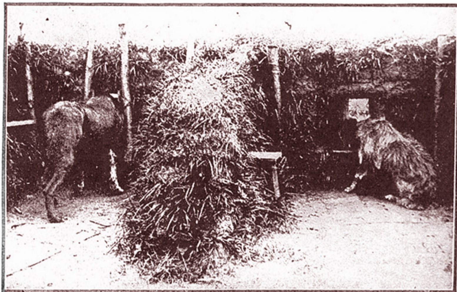
The French have been using dogs in the trenches to watch through small peep-holes, and give the alarm if any activity develops in the enemy lines

than to trail the wounded men. In the early stages of the war he was taught to bring back the cap of any wounded man he might find; but experience has shown this to be unwise, for, in many instances, the dog could not perform his task if the injured man had no hat, or if he were wearing the new steel helmet so tightly held by the chin strap that the dog could not remove it. For this reason the ambulance dog is now taught to be less particular as to what he brings back, and he often returns with a tobacco pouch, a handkerchief or any other small article that he can find in the pockets of the wounded soldier. His task then is to lead the stretcher bearers to the spot where his find is lying. In this work the keen nose of the dog has been the means of saving many lives, for wounded men not infrequently crawl into a thicket or other hiding place to get out of the way of shells or snipers, with the result that, hidden from sight, they are overlooked. Usually the ambulance dog carries at his collar or in small saddle pouches, a first-aid kit, by means of which the wounded man can succor himself, if conscious, stimulants, and a pocket collar to receive any message that the soldier is able to write. Dogs in the trenches are sometimes provided