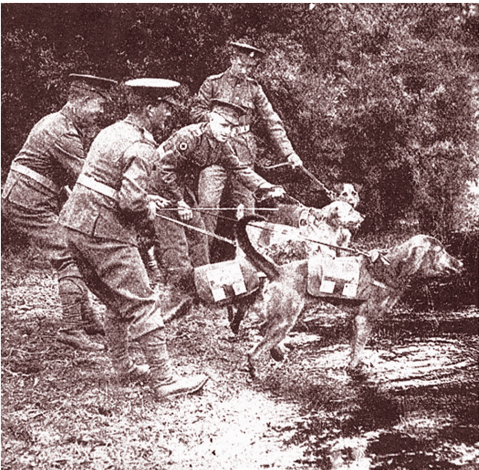
BRITISH FIELD AMBULANCE DOGS