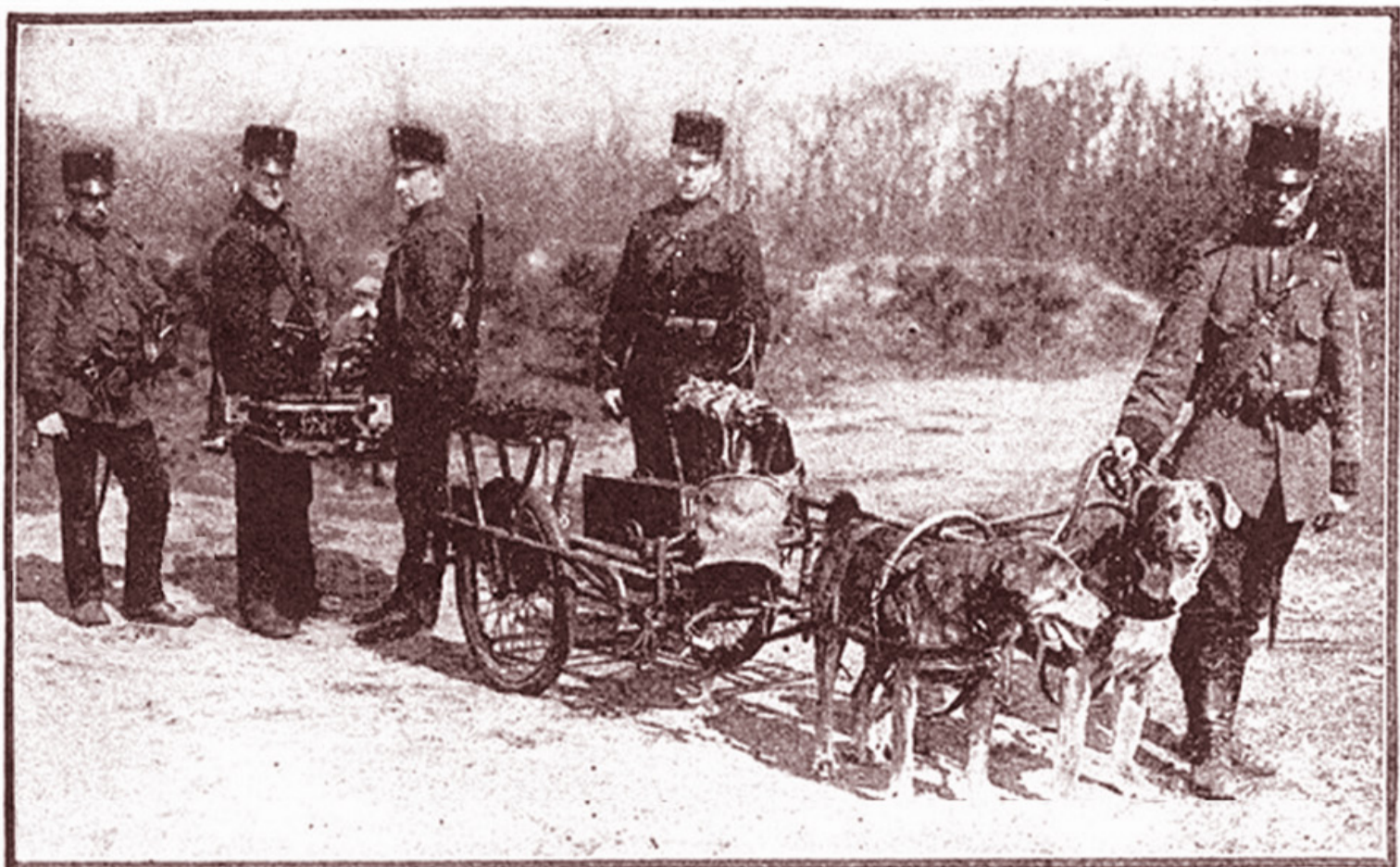
A Dutch machine gun drawn by dogs. These dogs are so well disciplined that they will not bark when in action and show no fear or excitement under fire