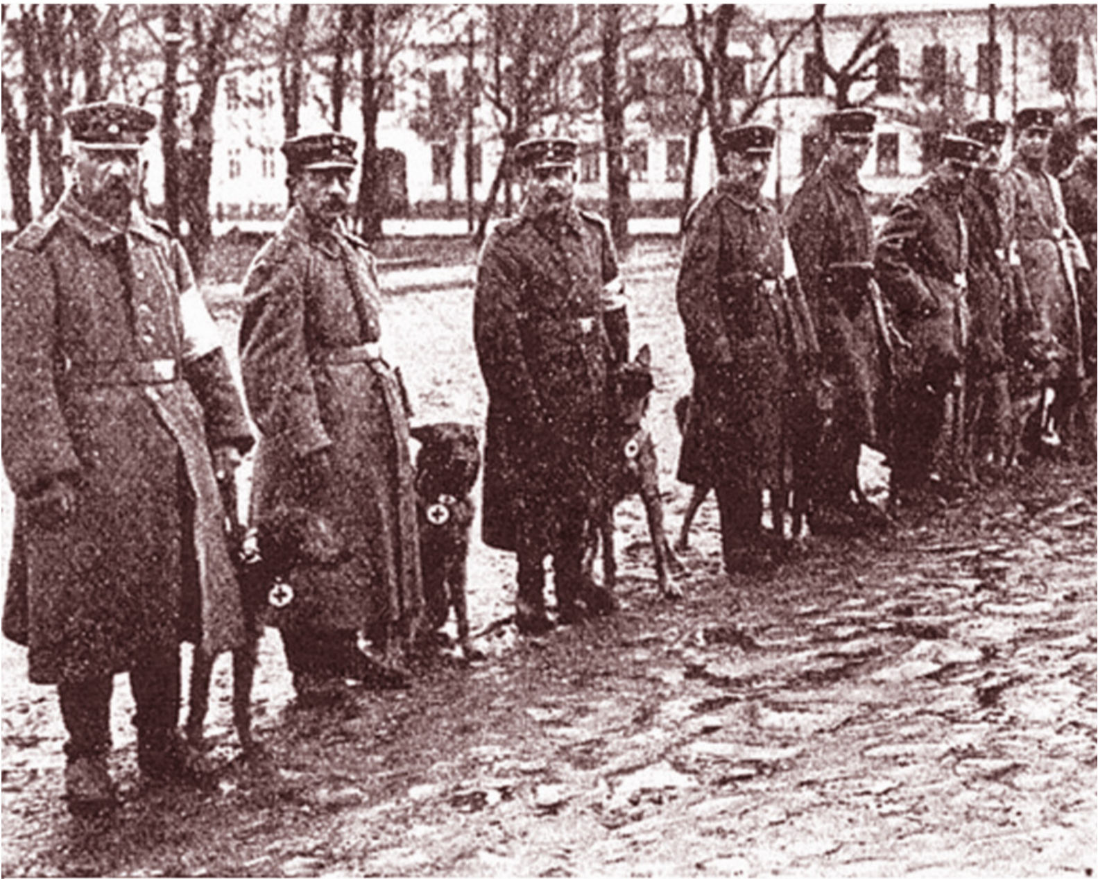
German police dogs are used by the German Ambulance Corps for rescue work in the field

It will be apparent from this brief outline that dogs are in demand for many purposes of war in Europe. As yet we have heard nothing of the use of war dogs by the Turks, but it would be strange if they had not taken a leaf out of the German book of military efficiency. Doubtless some of the despised Pariahs of the Constantinople streets have attained a more glorious destiny on the field of battle.