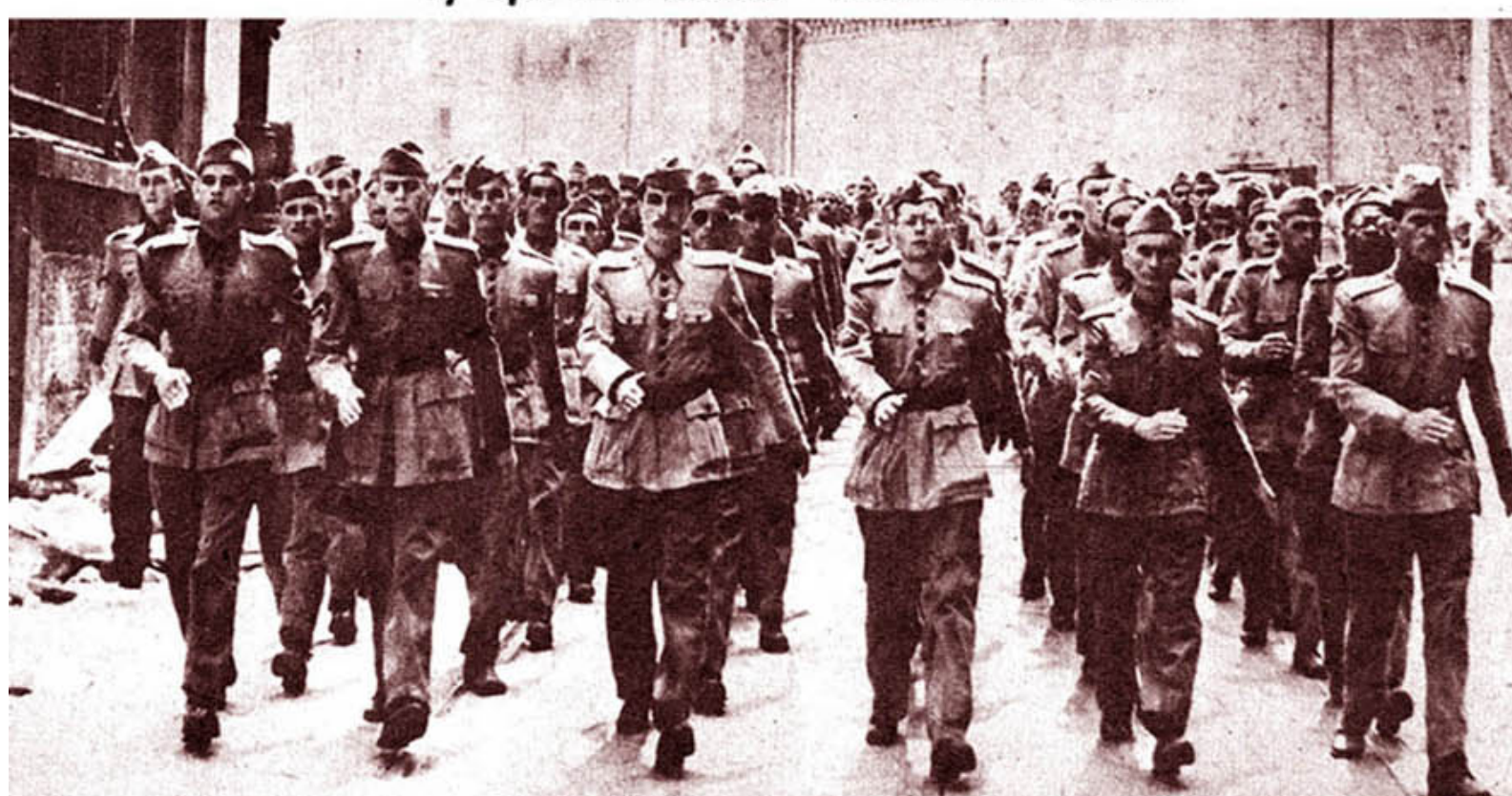
Troops from the 1st Division, Brazilian Expeditionary Forces, march through the streets of Naples. Their green uniforms with high buttoned collars differ from those worn by other soldiers of the United Nations.

W E had a hard time getting accustomed to the latrines on the ship. Back in Brazil a man going to the latrine would enter a cubicle that had a door to insure privacy. It was very difficult on the ship for the men, just sitting there looking at each other. But they're getting used to it."