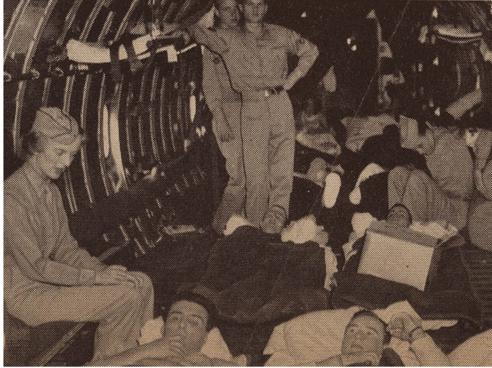
ARMY NURSE TENDS WOUNDED FROM KOREA IN U. S.-BOUND PLANE