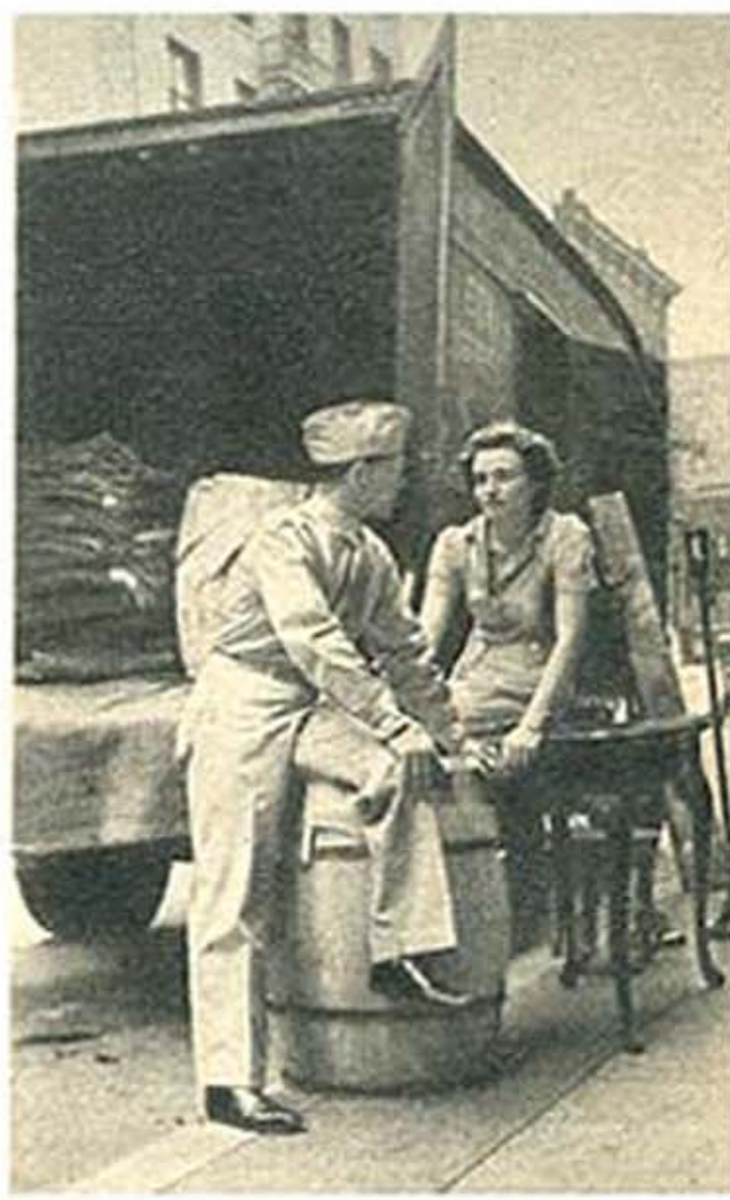
SCHMIDT FURNITURE goes to neighbors—except sentiment pieces. They want to "start from scratch" after the war.