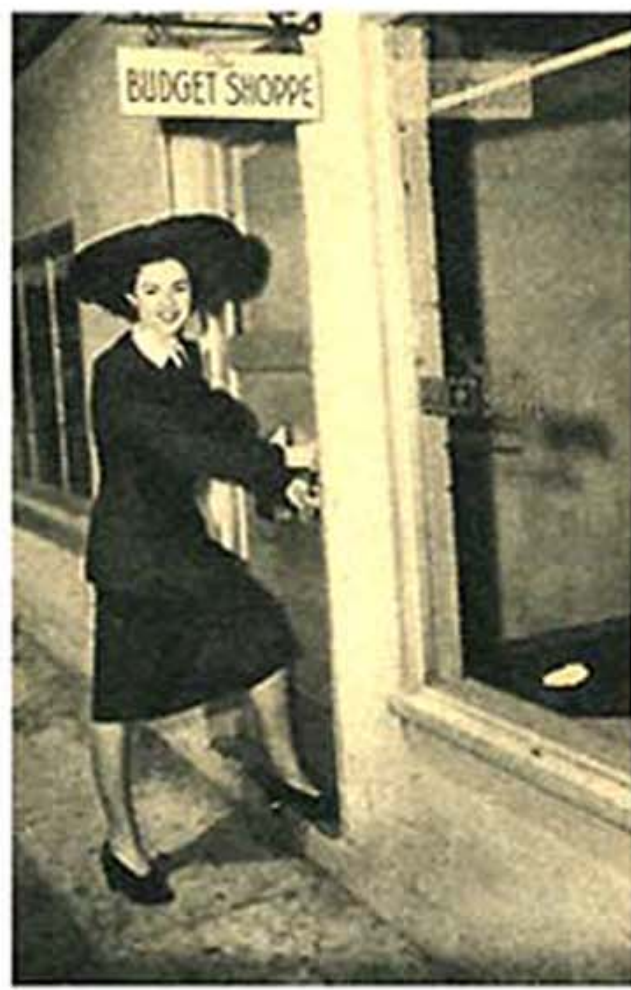
PADLOCKED . Wilma Jo's Budget Shoppe will be closed for the duration. Customers promised they'd be back for reopening.