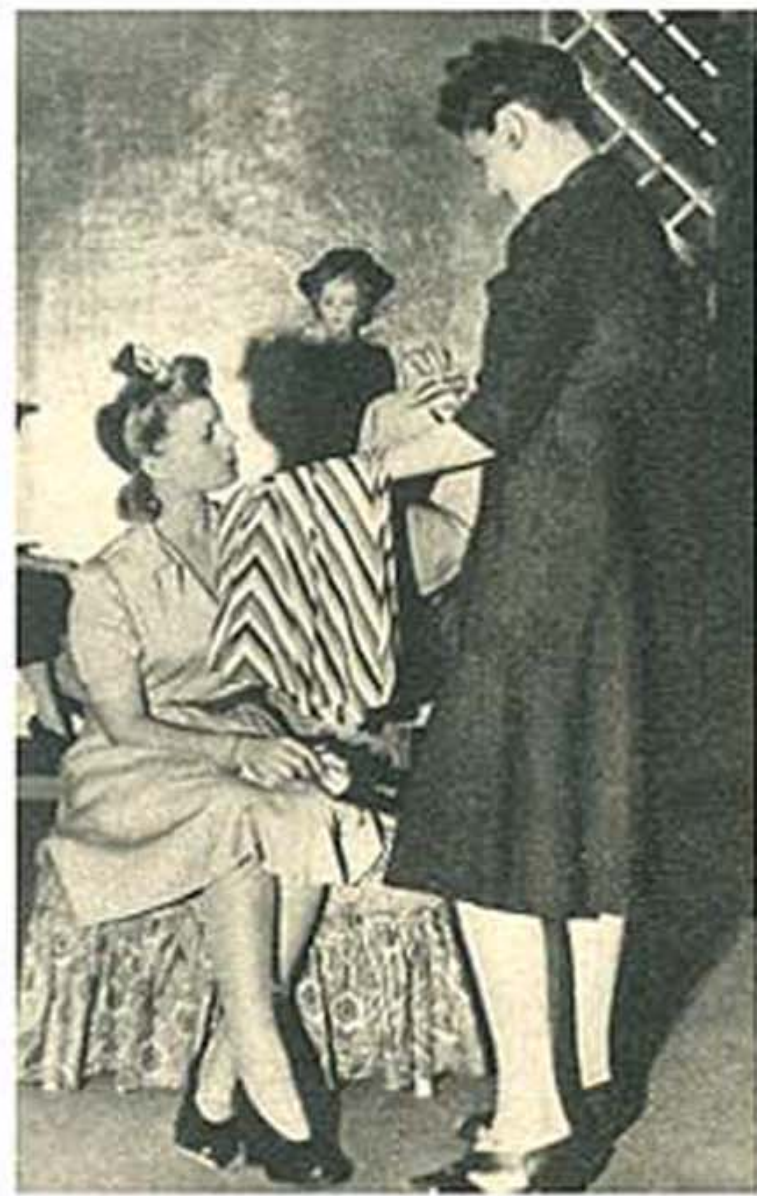
CIVILIAN DRESS is permitted off-post. A relief from the tailored Army uniform, feminine fashion is for leave evenings.