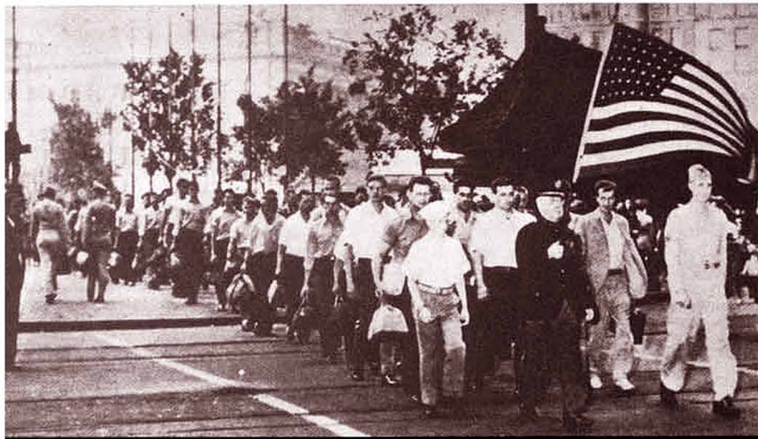
Victory didn't stop the draft. The day after Jap surrender these men were inducted in Cleveland.