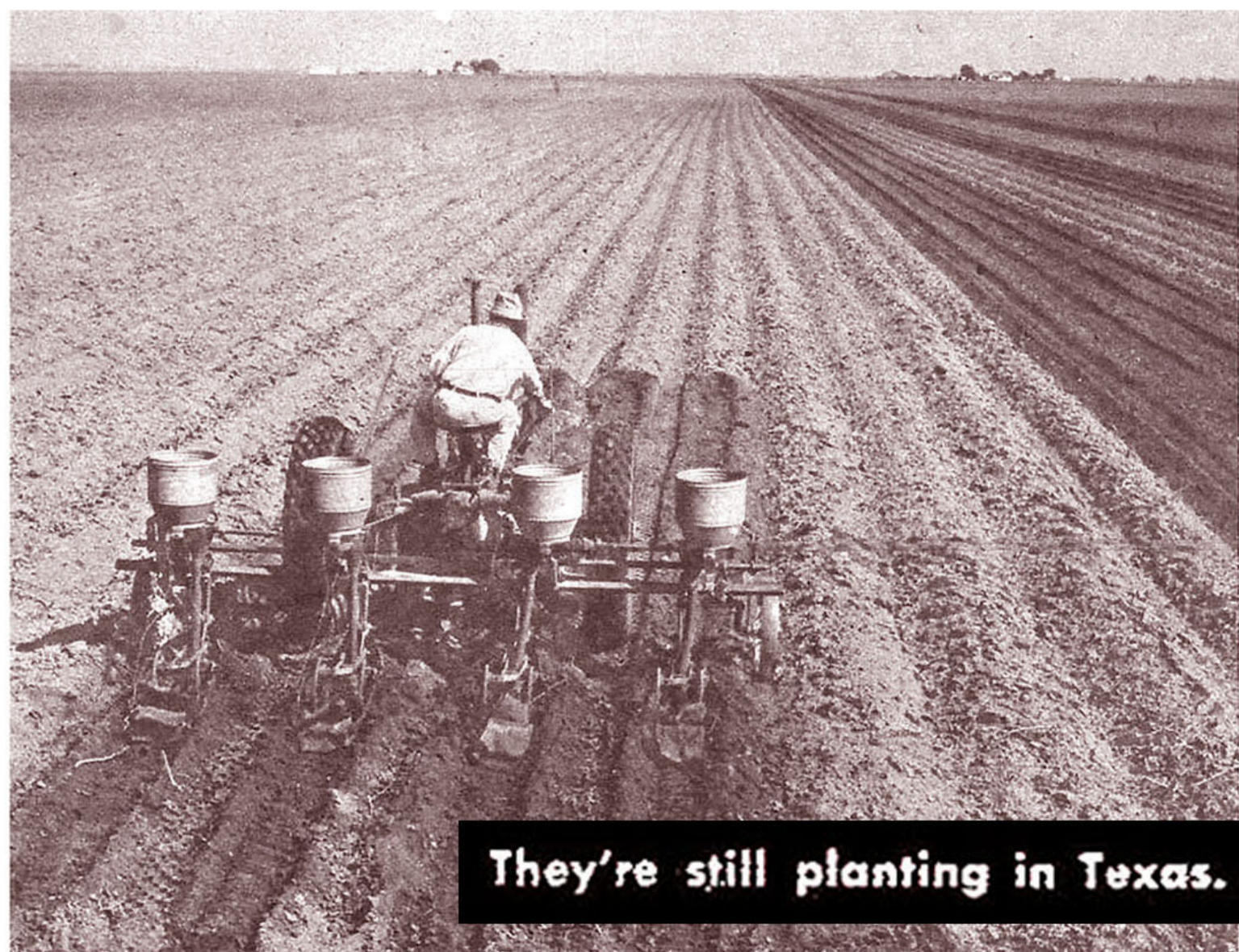
They're still planting in Texas.

Here the delicate question of our relations with the Soviet Union enters into the picture, and Joe cannot fail to notice the numerous indications that the unity of the United Nations has slipped a