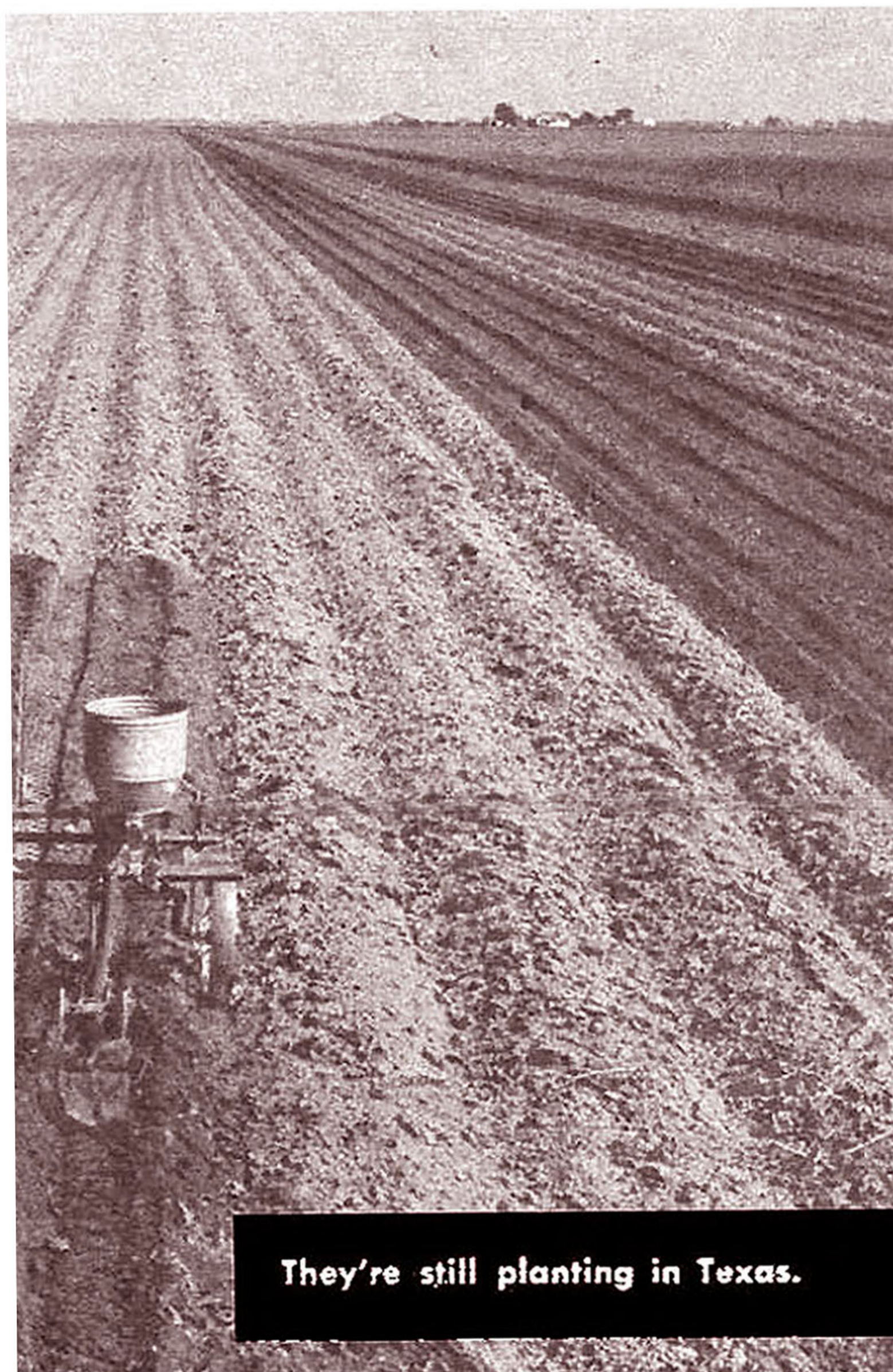
They're still planting in Texas.