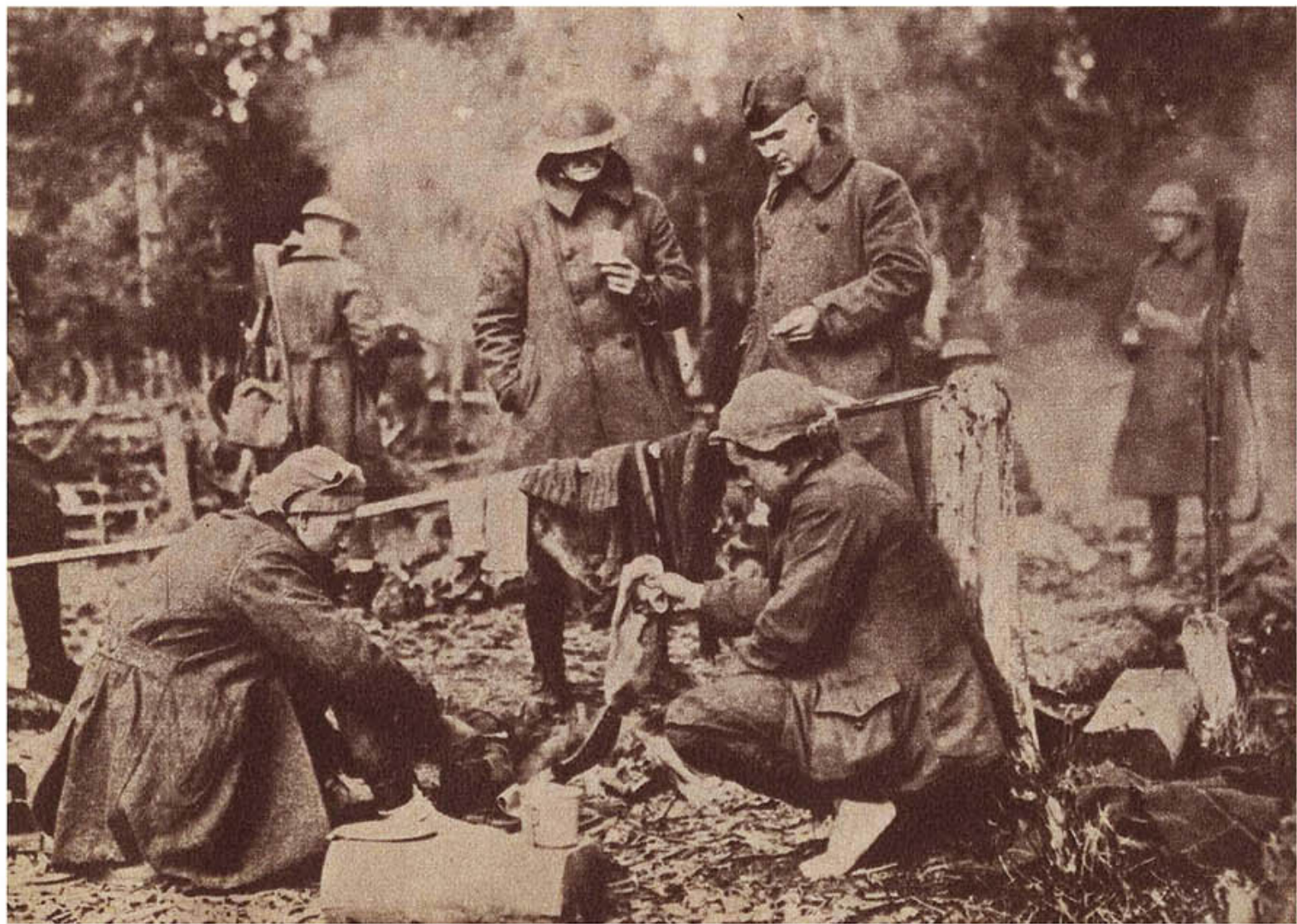
Even after snow cleared, conditions were tough. Here, U.S. soldiers dry clothes over fire after 17-mile advance through muddy swampland.

Pitted against an enemy as brutal and devious then as he is now, they were confronted by equally brutal climatic conditions—long, bitter hours of arctic darkness; clinging, waist-deep snow; and temperatures which often dropped as low as 20 degrees below zero. They lived for day after dreary day on canned and dried rations in their lonely outposts. Untried troops with mostly green officers, they learned as they went along, griping and swearing, but completing their mission with the respect of Allies and enemies alike.