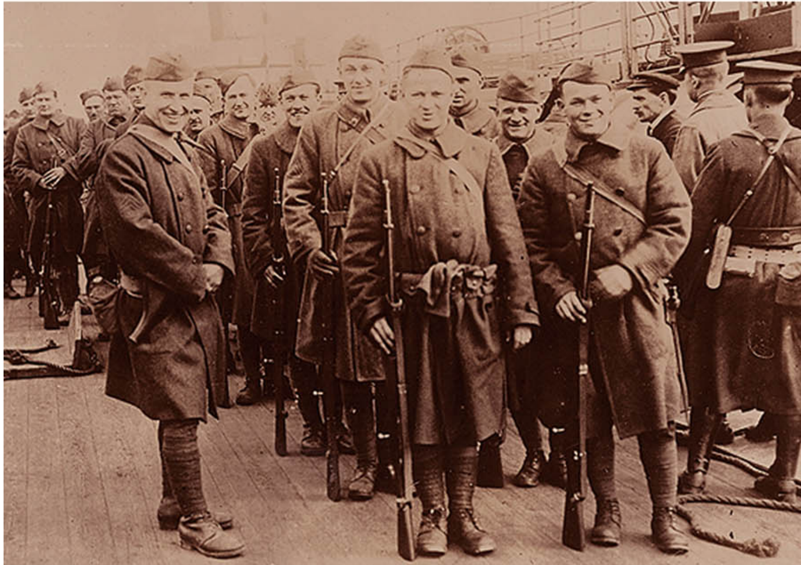
The 339th Infantry Regiment en route.

But the area was menaced by some armed Red steamboats operating from the lake, so before we reached the town the decision was made to neutralize these vessels. Accordingly, Jones threw a two-mile spur from the main line through the woods to the lake, and American motor patrol boats were carried in and launched.