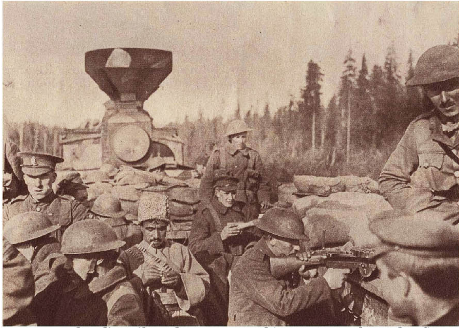
MacMorland's railroad troops, working constantly under fire had an armored train which included sandbagged flatcar.

Note ancient engine in the background of the photograph.