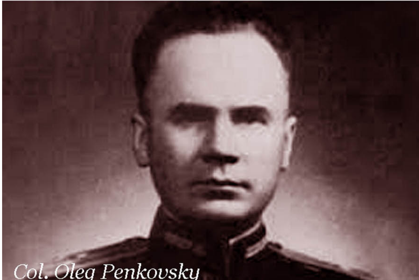
Col. Oleg Penkovsky

fought gallantly in both the Finnish campaign and World War II. He became a lieutenant-colonel at 26 and received a dozen decorations for valor, including the Order of the Red Star, two Orders of the Red Banner, the Order of the Patriotic War and the Order of Alexander Nevsky.