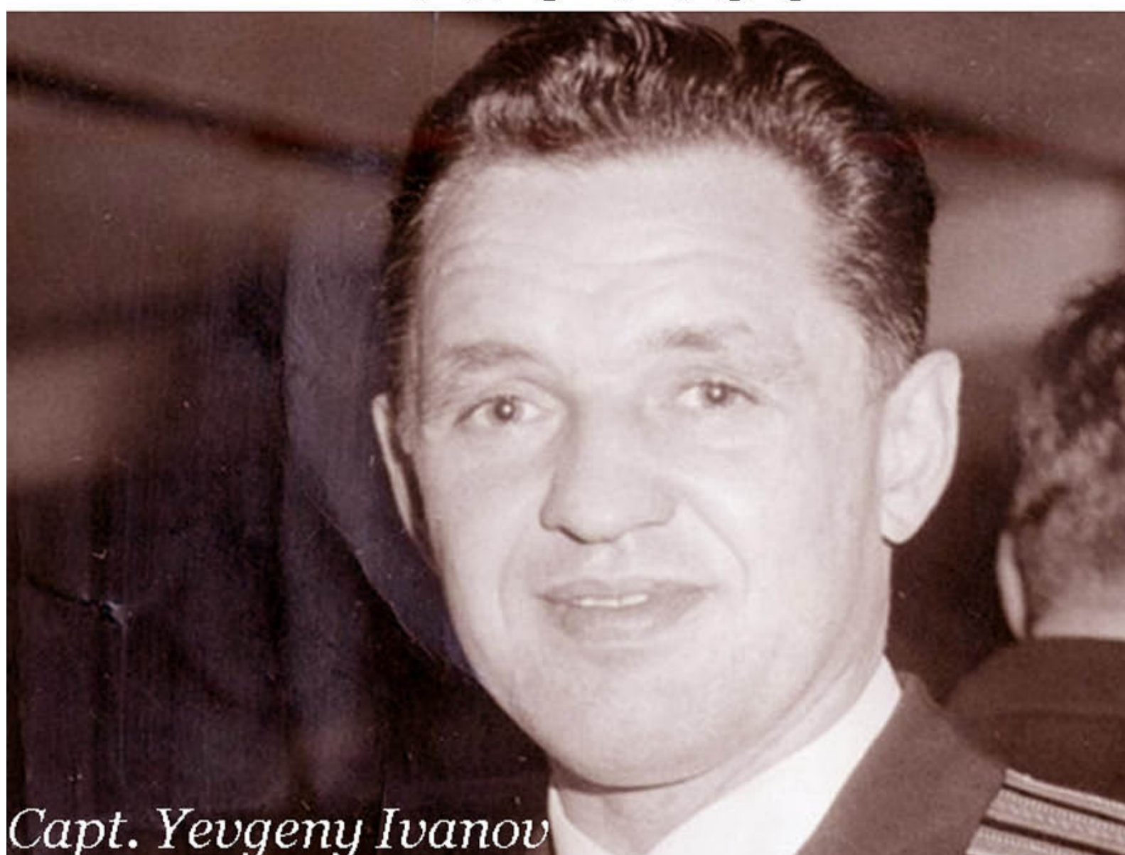
Capt. Yevgeny Ivanov

Capt. Yevgeny Ivanov, the Kremlin agent who shared Christine Keeler's affections with Britain's War Minister Profumo. Contrary to published reports, it was not the Profumo scandal that caused Ivanov's downfall—but his relationship with Penkovsky. The two were old friends and classmates for four years at Moscow's Military Diplomatic Academy, Russia's top espionage school.