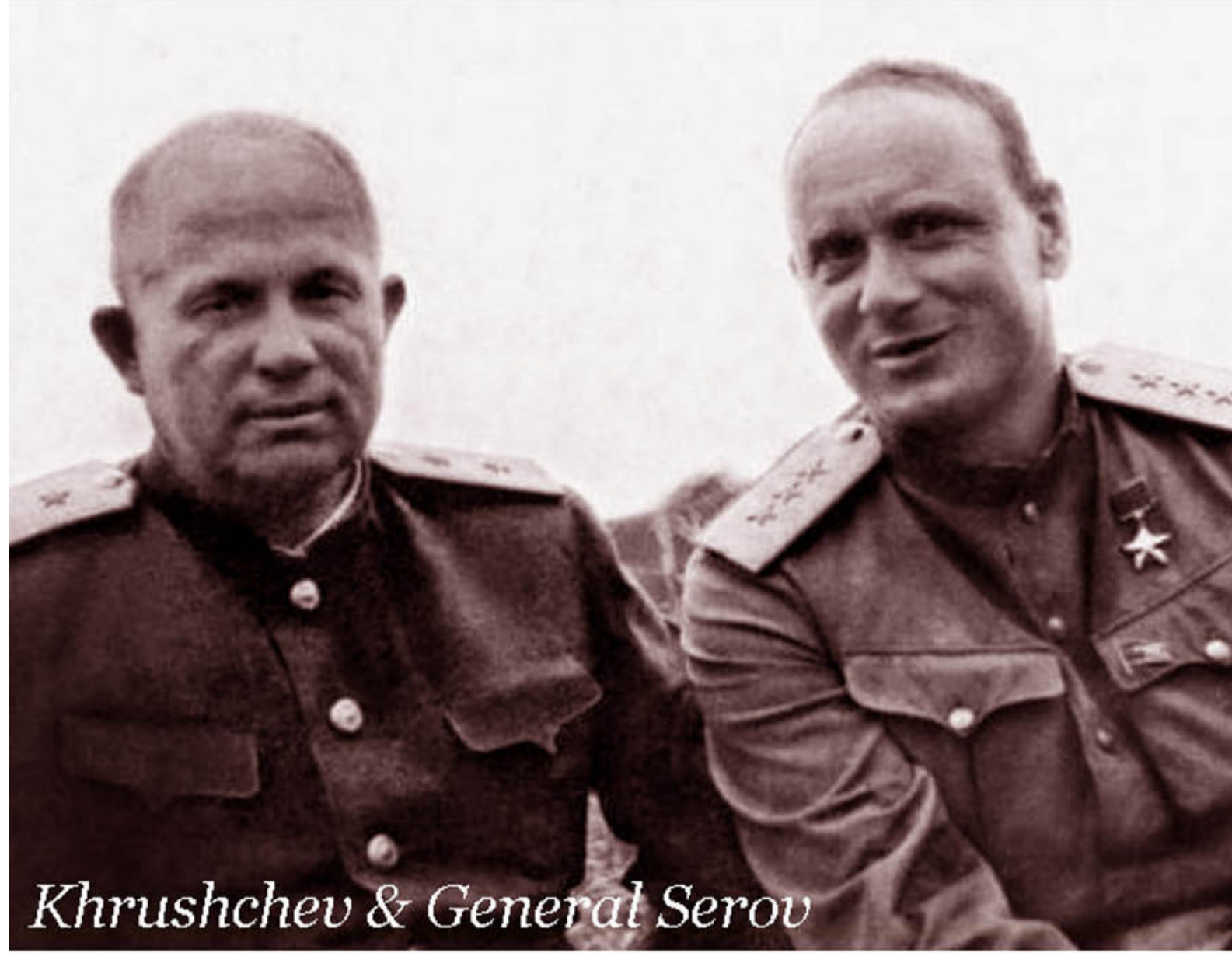
Khrushchev & General Serov

Serov, an old-time executioner in charge of many Kremlin blood baths, favored assassinating Khrushchev. But cooler heads prevailed.