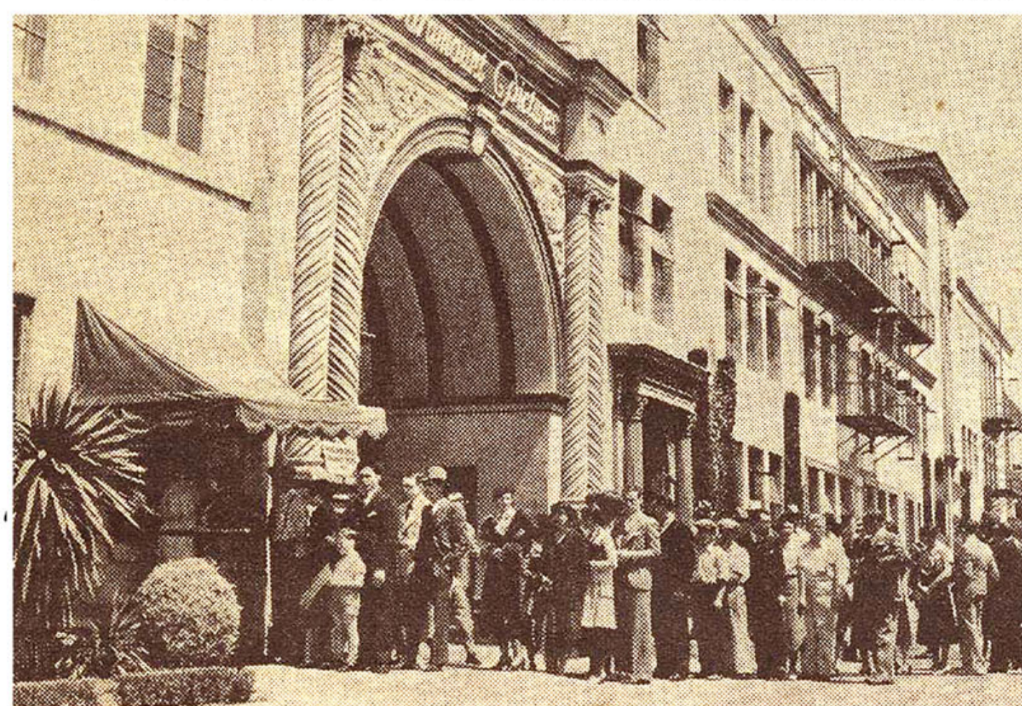
"Extras" waiting to be checked in at a Hollywood studio.

The constant cry is "Give us work!" It can't be done to satisfy the need. Until recently, perhaps because of misunderstanding of the problem, the destitute and