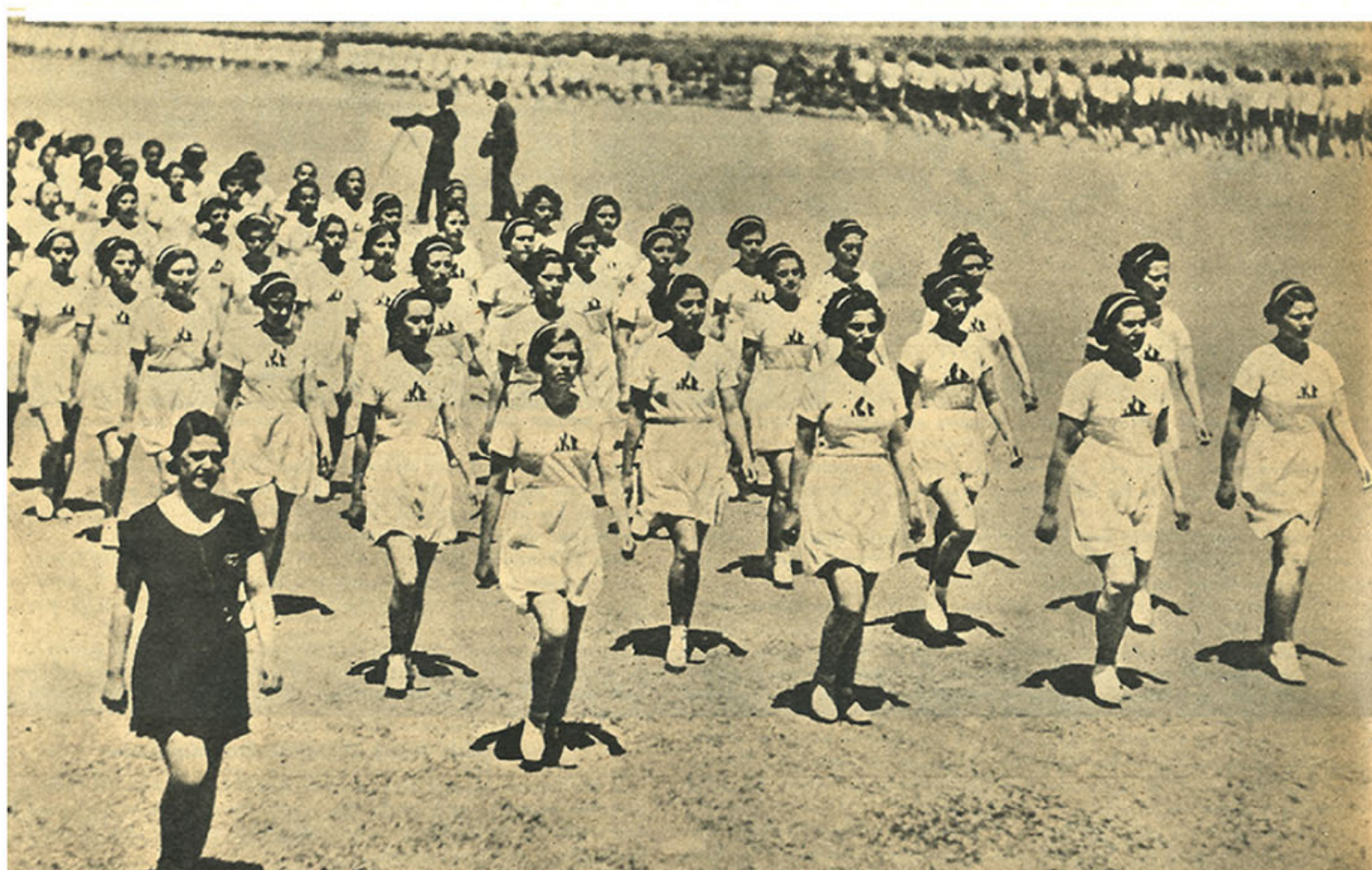
Appropriately-dressed Turkish girls display trim, firm, healthy bodies on Istanbul athletic field. Modernization of Turkey began under Kemal Ataturk (Father of Turks), first president of Turkish Republic, unanimously elected in 1923 (reelected in 1927, 1931 and 1935) who abolished caliphate, monasteries, polygamy, ancient dress modes, inaugurated reforms

We can have peace at a price—and it will be less than price of another war.