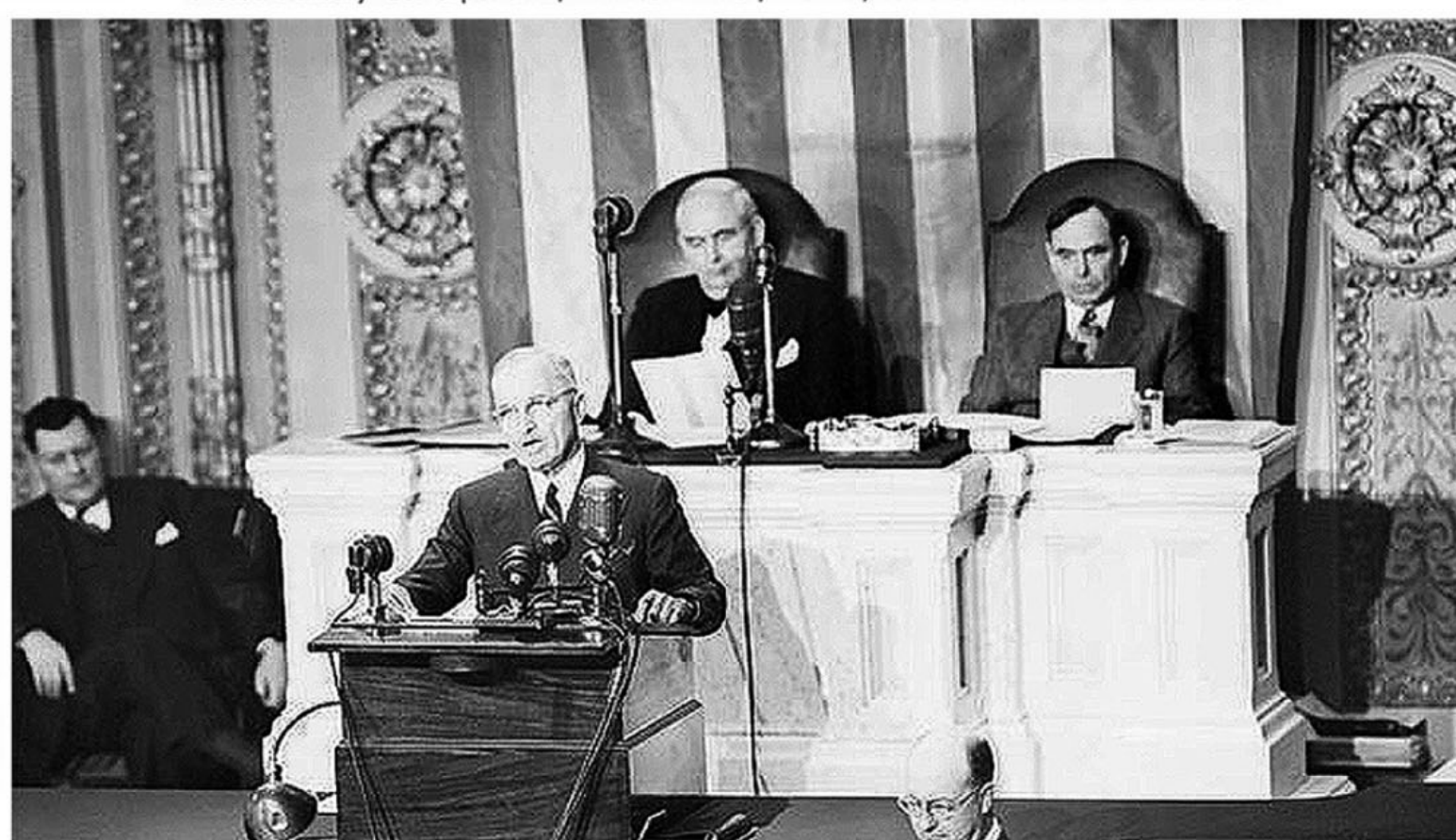
PRESIDENT ASKS CONGRESS FOR $400-MILLION TO AID GREECE AND TURKEY IN CAMPAIGN TO CHECK RUSSIAN TOTALITARIANISM. BEHIND TRUMAN ARE VANDENBURG, SPEAKER MARTIN

Noted Military Correspondent, Political Writer, Author, Lecturer and Radio Commentator