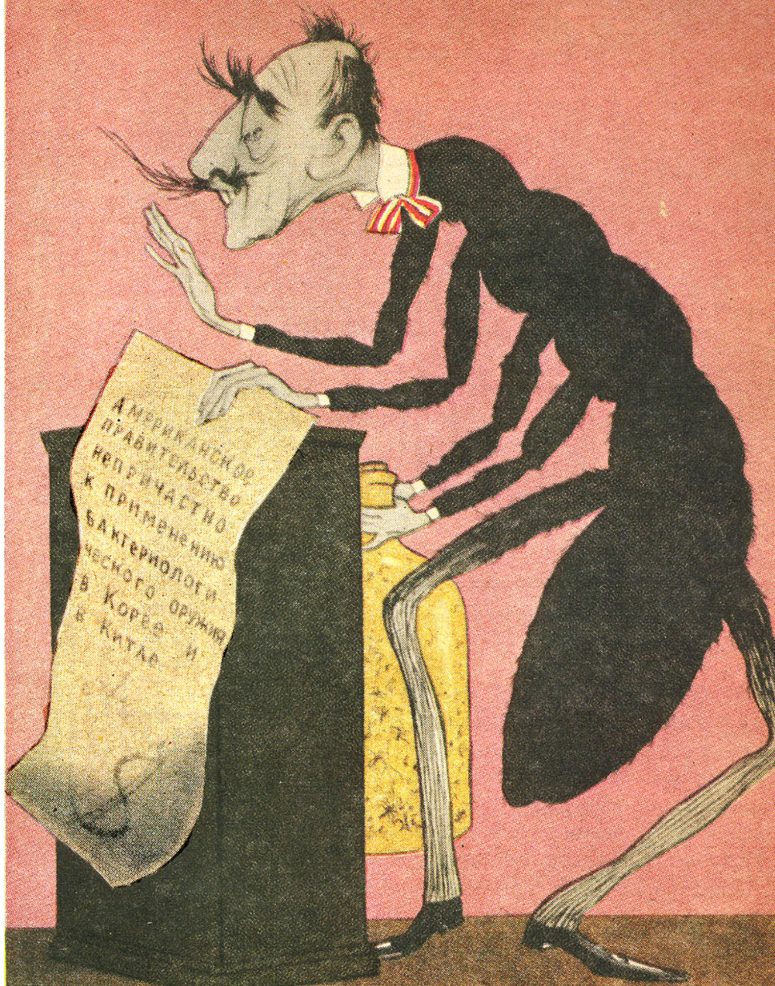
Spidery Secretary of State. Dean Acheson's placard explains that "The U.S. Government has no part in the application of bacteriological weapons in Korea and China."