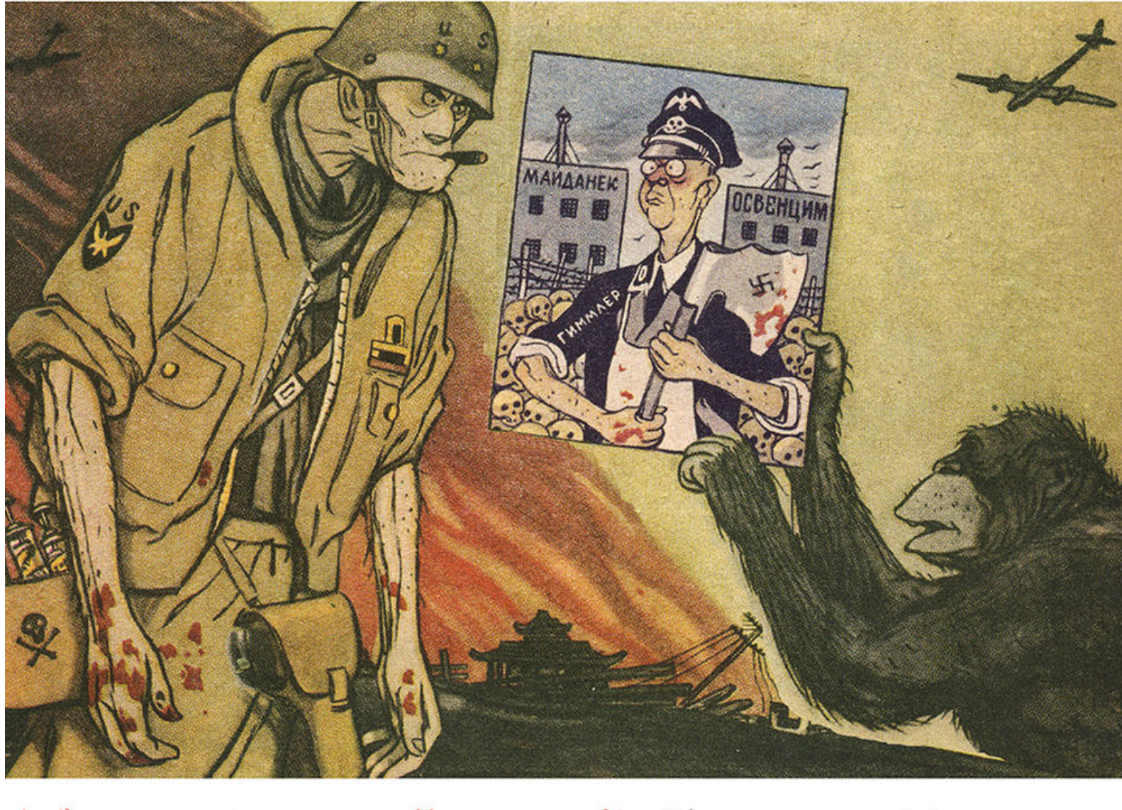
"Corrections to Darwin." The ape holds a picture of Gestapo chief Himmler and Nazi concentration camps. He tells the U.S. soldier: "No, it's not from me you descend, Mister, it's from him."

Line of Lies. Since then the Kremlin—echoed by Reds everywhere—has accused the U.S. of torture, rape and germ warfare. Americans, the Reds claim, have led war prisoners by rings through their noses. U.S. soldiers, they charge, stuffed a woman's hair into her mouth and pulled it out through a hole they had cut in her throat.