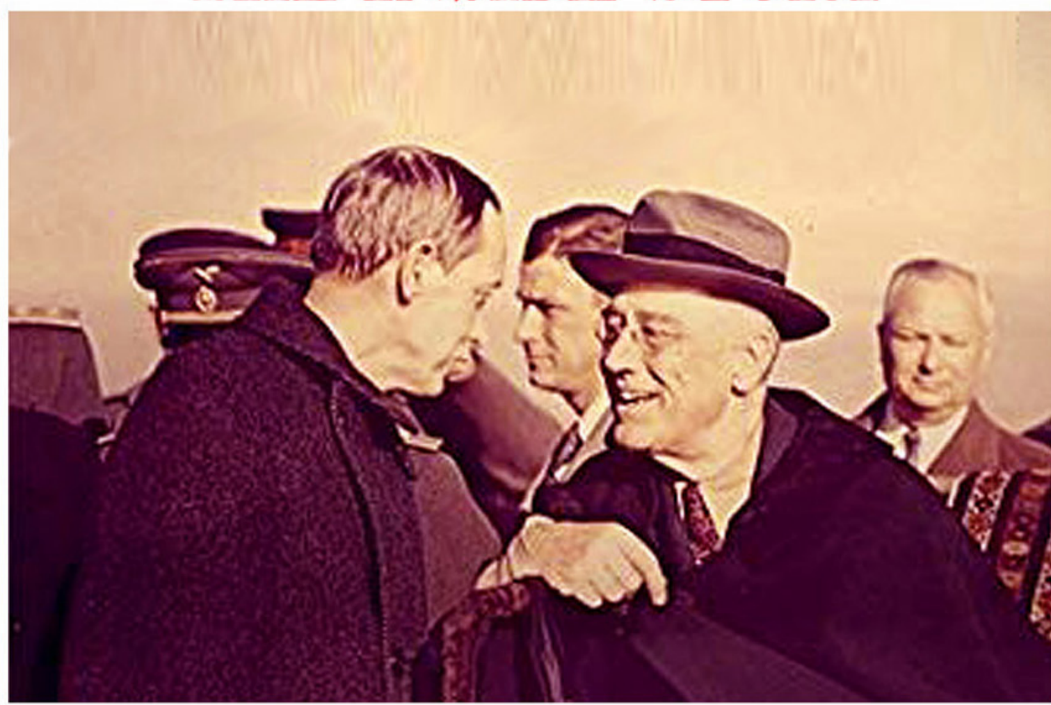
The President and his right-hand man

No man could forget the picture of the dictator of Russia as he stood watching me leave—an austere, rugged, determined figure in boots that shone like mirrors, stout baggy trousers, and snug-fitting blouse. He wore no ornament, military or civilian. He's built close to the ground, like a football coach's dream of a tackle. He's about five feet six, about a hundred and ninety pounds. His hands are huge, as hard as his mind. His voice is harsh but ever under control. What he says is all the accent and inflection his words need.