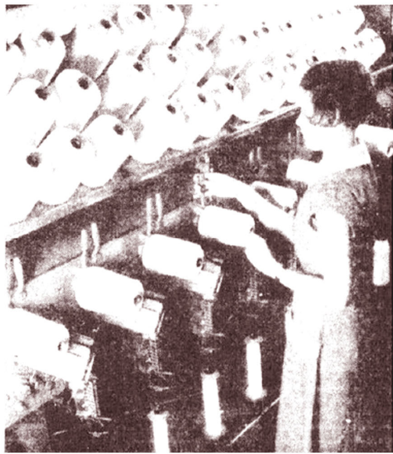
Finally, rayon yarn is wound on cones for the weaving- and knitting-mills

Nor can silk exporters raise their price much above $2, because whenever silk costs more than three times as much as rayon, the synthetic fiber producers rush in and snip off a little bit more of the silk market.