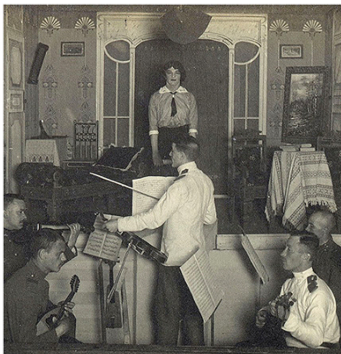
A Russian production being rehearsed at the German prison camp at Königsbruck. (image & caption added)

Early in the summer of 1915, we are told, the professional musicians formed a musical society, "to secure accommodation for practise and study for the professional musicians and students interned, and to organize concerts and other musical entertainments in the camp." We read: