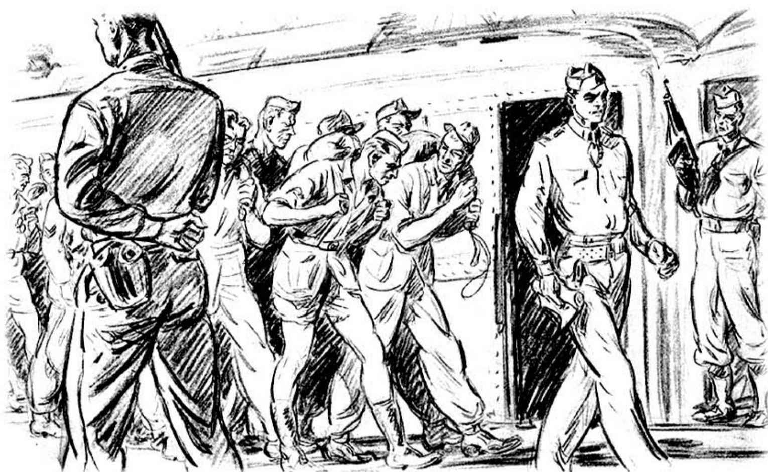
ONCE IN THE U. S., AXIS PRISONERS ARE HERDED INTO TRAINS BOUND FOR CAMPS IN INTERIOR. UNIFORMS ARE A MOTLEY OF THEIR OWN AND ALLIED ARMIES

This account of life aboard a U. S. train carrying Nazi prisoners to internment camps is an authentic bit of after-the-battle reporting by an Army MP who was a civilian artist. That his eye missed no telling detail is evident from both his first-person story below and his on-the-spot pencil sketches on these pages.—EDITOR