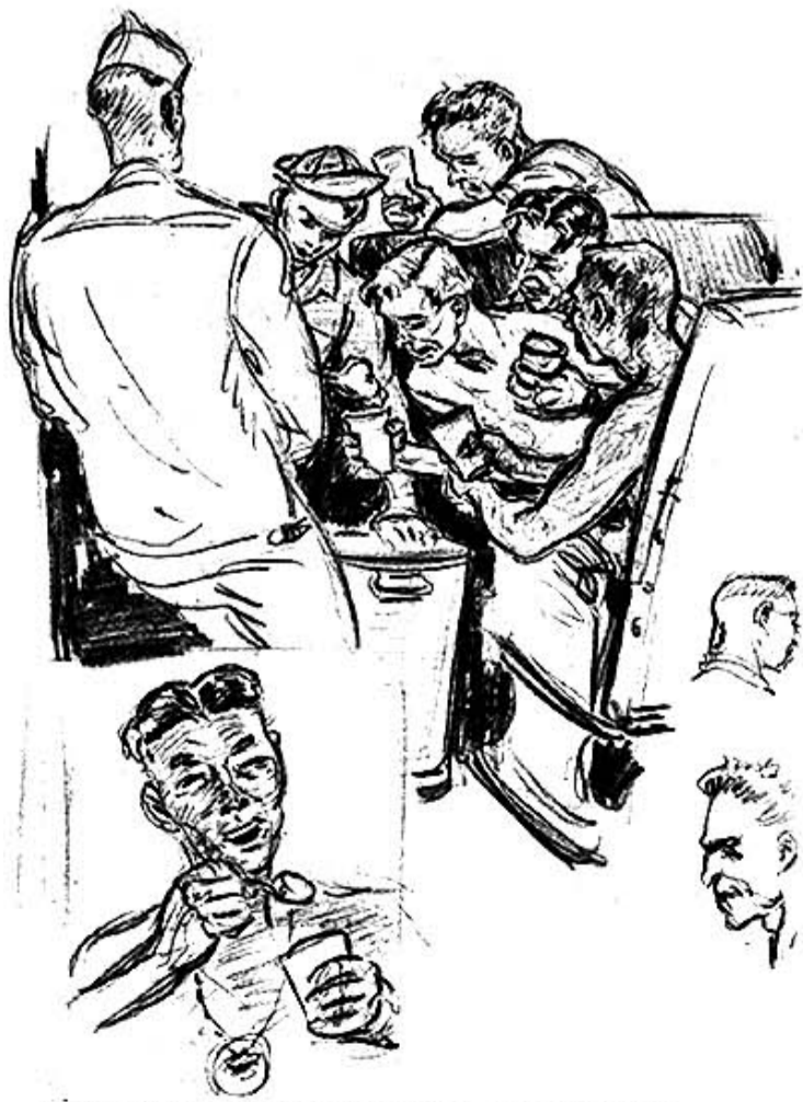
NAZI CAPTIVES EN ROUTE EAT AS IF STARVED. THEY'RE CRAZY ABOUT ICE CREAM

Their craving for candy and chewing gum is as great as for cigarettes. They are allowed to smoke for 30 minutes after each meal. The miserliness with which they save butts speaks for the quality and quantity they are used to.