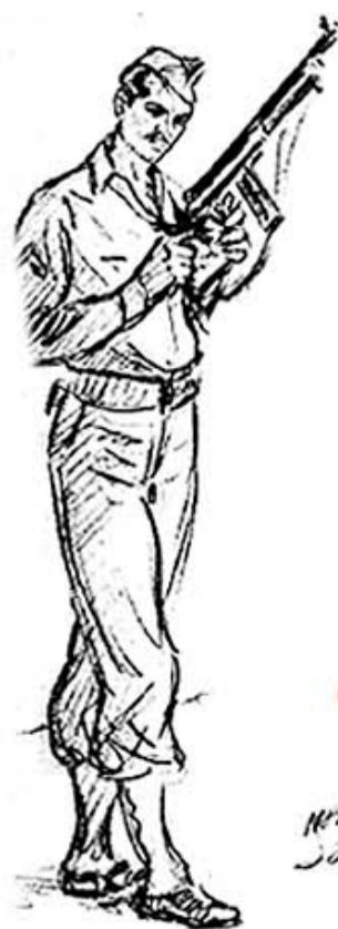
ARTIST Norm Saunders juggles sketch-pad, tommy-gun.