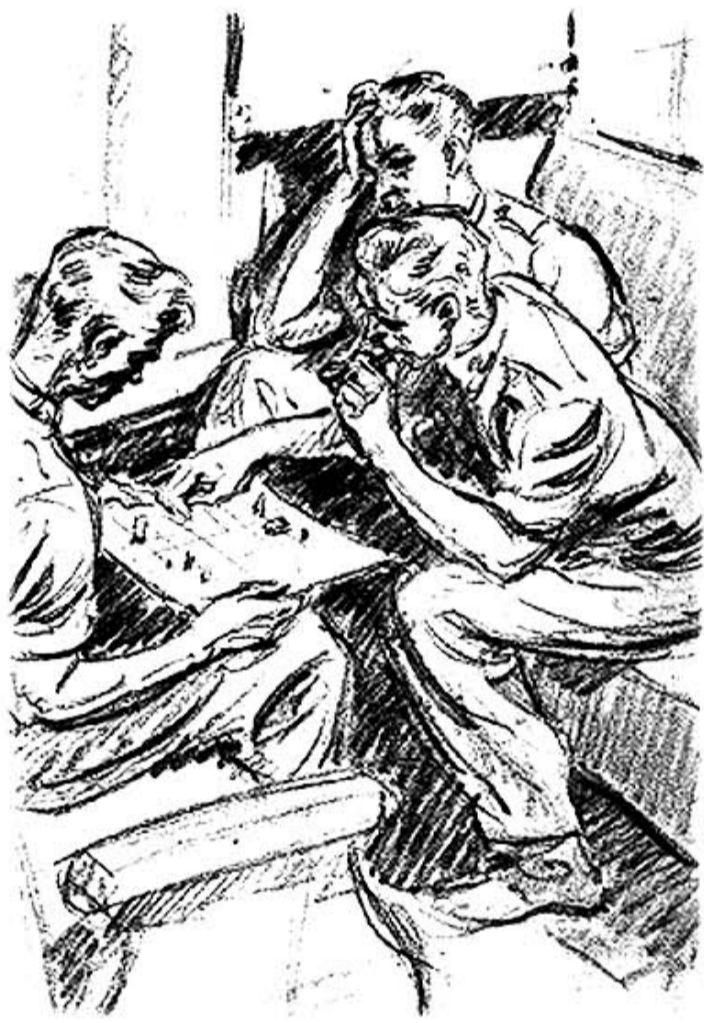
WOUNDS SUFFERED BEFORE CAPTURE ARE DRESSED BY U. S. MEDICAL OFFICERS