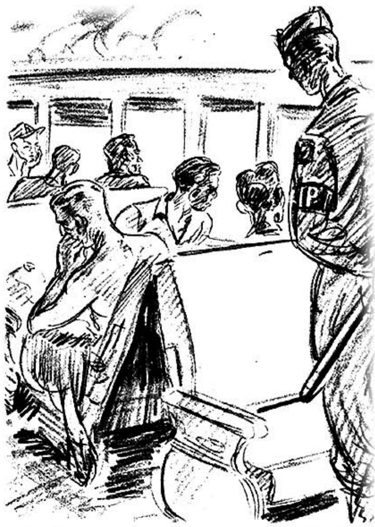
EACH COACH CARRIES 50 PRISONERS. ONLY ONE MAY MOVE ABOUT AT A TIME