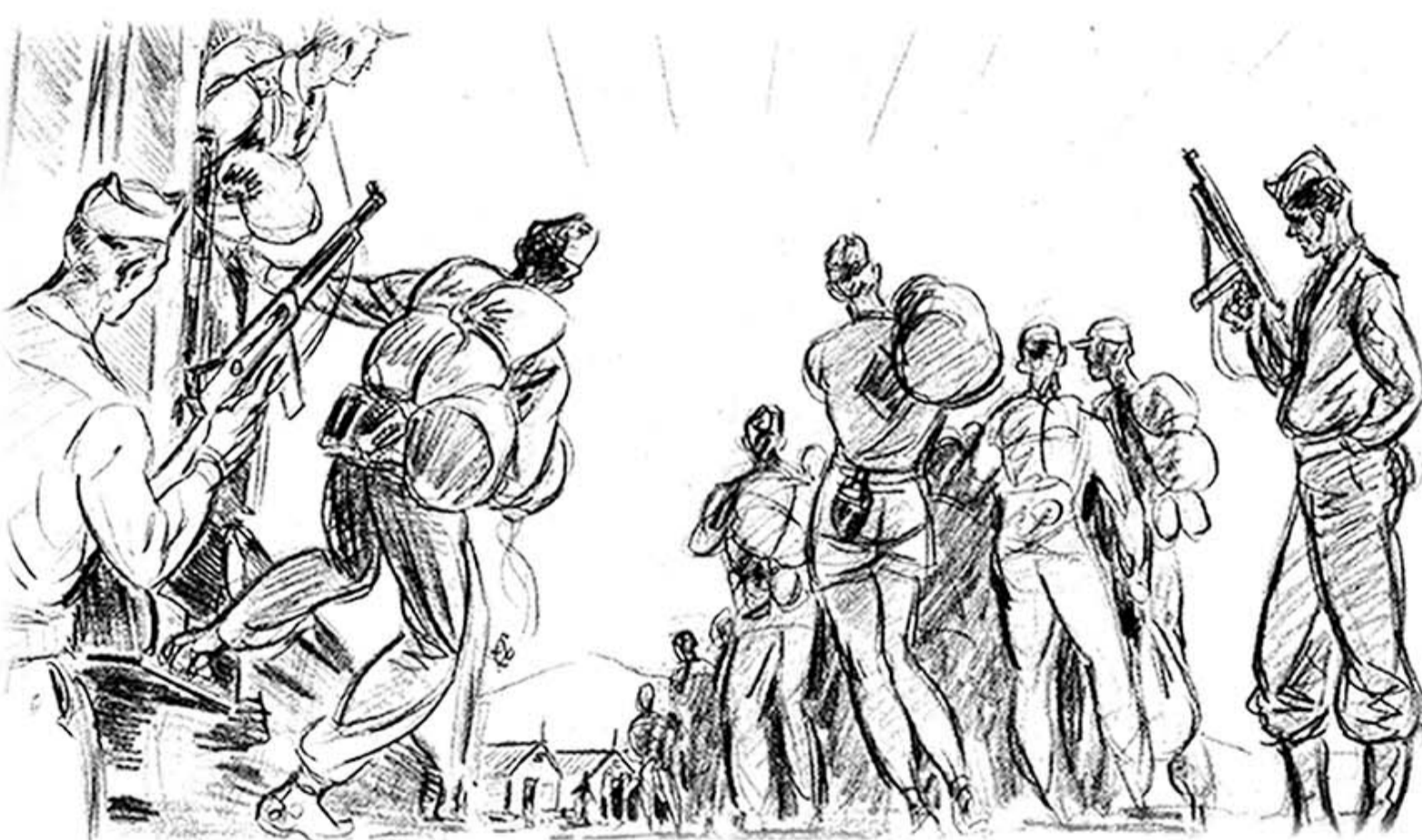
JOURNEY'S END IS AN ISOLATED U. S. PRISON CAMP. WARY OF THE TOMMY-GUNS, PRISONERS LEAVE THE TRAIN QUIETLY—STILL CURIOUS BUT NO LONGER ARROGANT