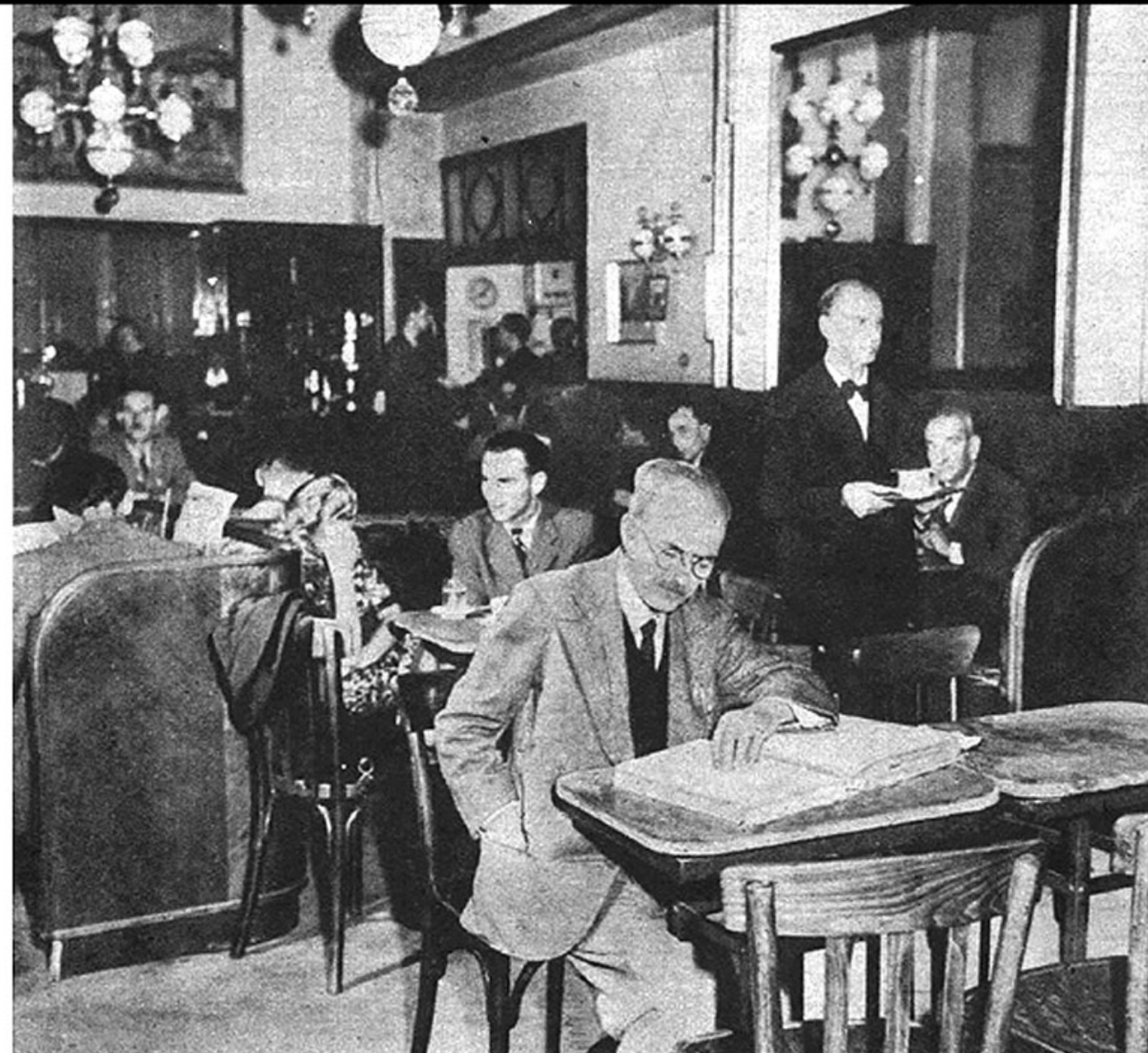
This is one of the surviving cafes, once the centers of Viennese culture.

always sold out, proprietors will always make room for one of their favorite soldiers.