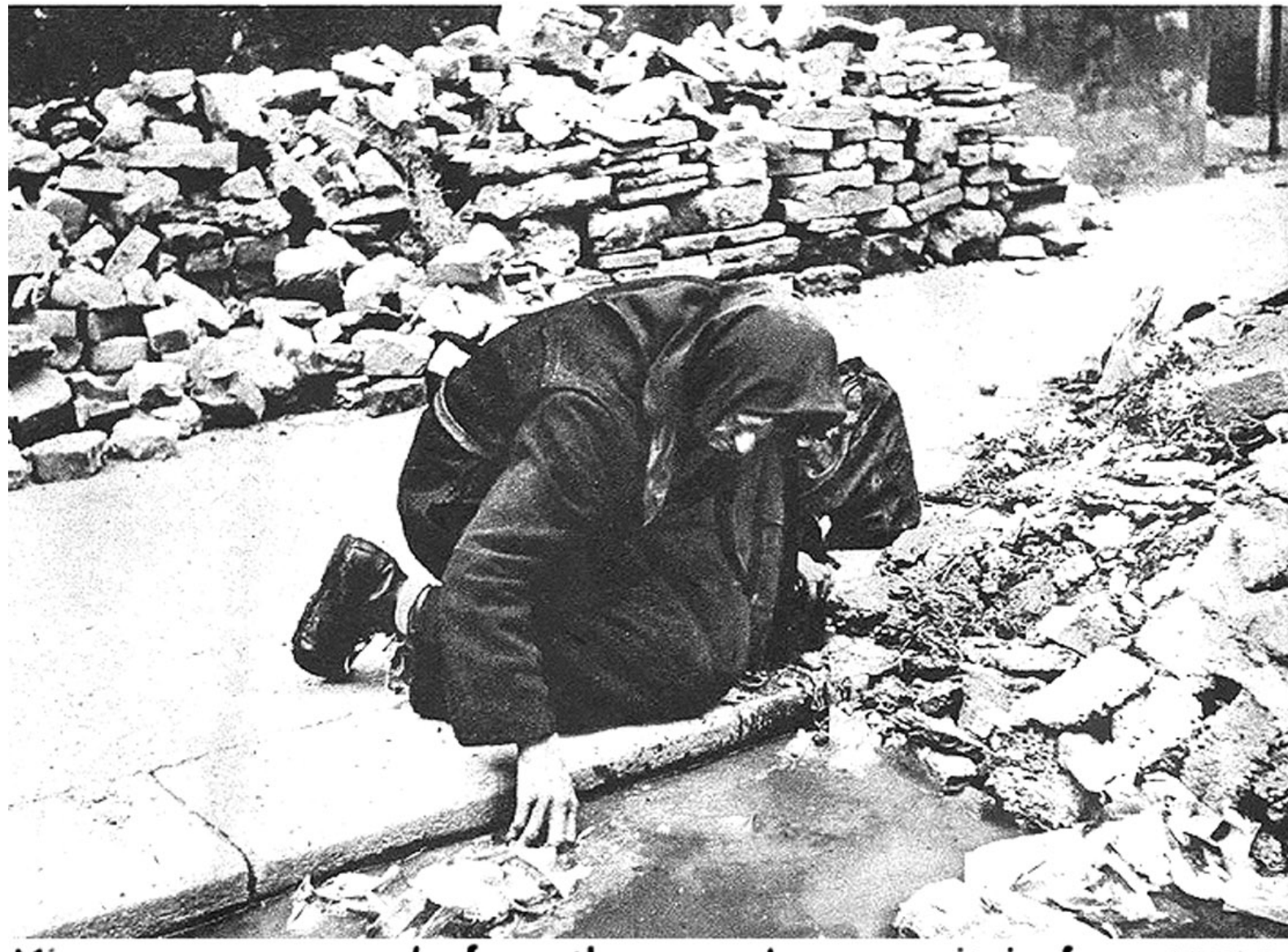
Vienna was poor before the war, but now it is far poorer.

Women must hunt for usable junk in the gutters.